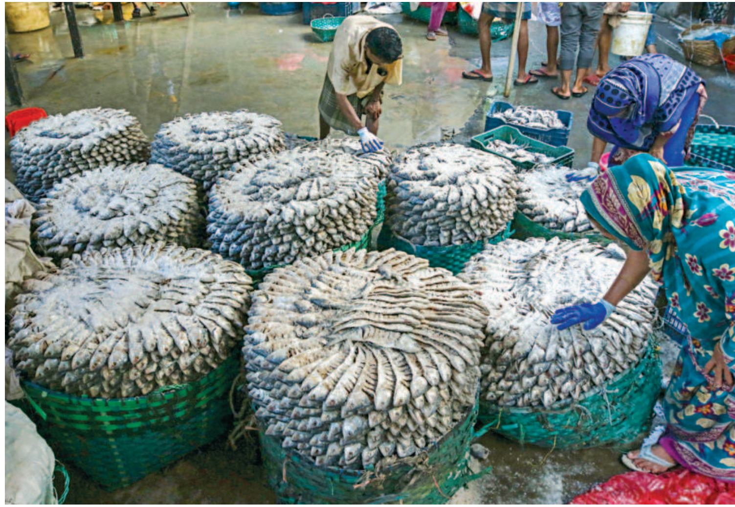
Workers applying salt on hilsa to make Nona Ilish in Firingi Bazar area of Chattogram city yesterday. Traders at the market are now busy preparing the salted hilsa amid the ongoing 22-day ban on catching and transporting the fish. They said they supply per maund of Nona Ilish for Tk 12,000-16,000 to different parts of the country.