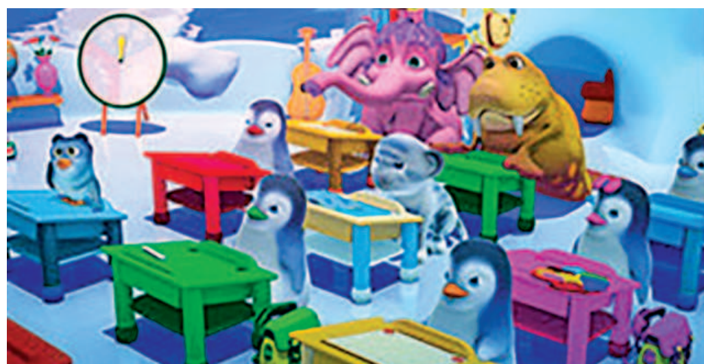
Ozie Boo! Save The Planet