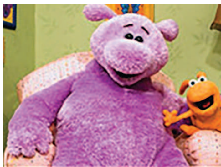
Big and Small