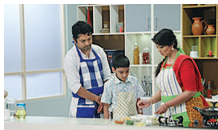
Banai Mojar Khabar Ma-Baba Ar Ami