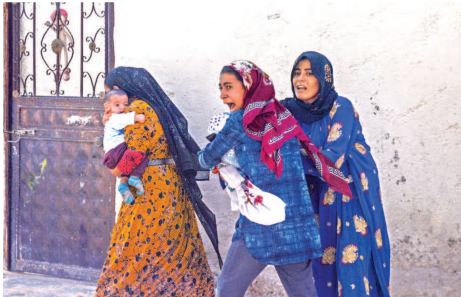
Women run out of their home after a rocket fired from Syria landed in their neighborhood in the Turkish border town of Akcakale in Sanliurfa province, Turkey, yesterday.

Republicans savaged Trump Wednesday for allowing Turkey to attack US allies in Syria as the president offered varying reasons for giving Turkey the green light, including the fact that Kurds did not fight alongside the US in World War II.