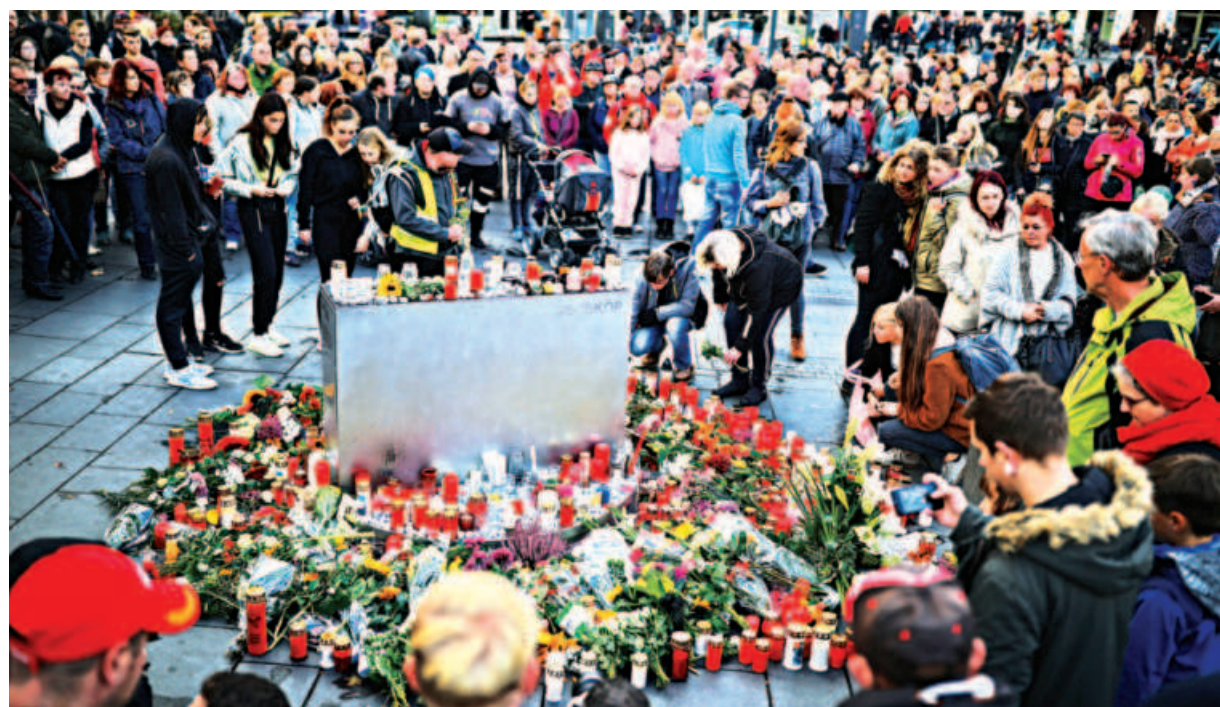
Mourners gather at the market square in Halle, Germany yesterday, after two people were killed in a shooting. The gunman, Stephan B., suspected of attacking a German synagogue wanted to commit a massacre and incite others by live-streaming his deadly rampage, Germany's federal prosecutor said yesterday. Sources say Stephan B., a man who was influenced by scary anti-Semitism, xenophobia and racism, was heavily armed with many weapons. Investigators found 4 kilograms of explosives in his car.