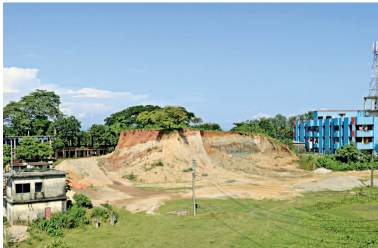
This is what is left of Bangla Tila in Sylhet Sadar upazila's Chhalia area. Unscrupulous traders have long been razing the hillock to extract earth for sale. The authorities have apparently turned a blind eye to the illegal act. Some buildings were also constructed there.