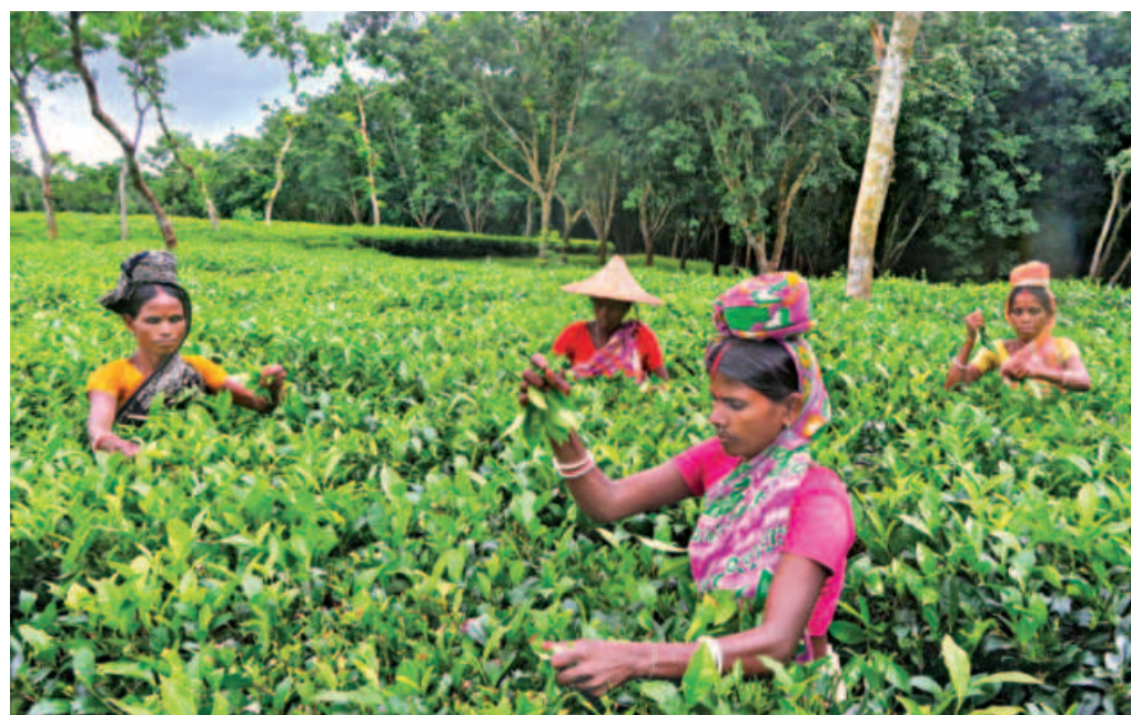
Workers busy plucking leaves in Rangichhara tea garden in Kulaura of Moulvibazar recently.