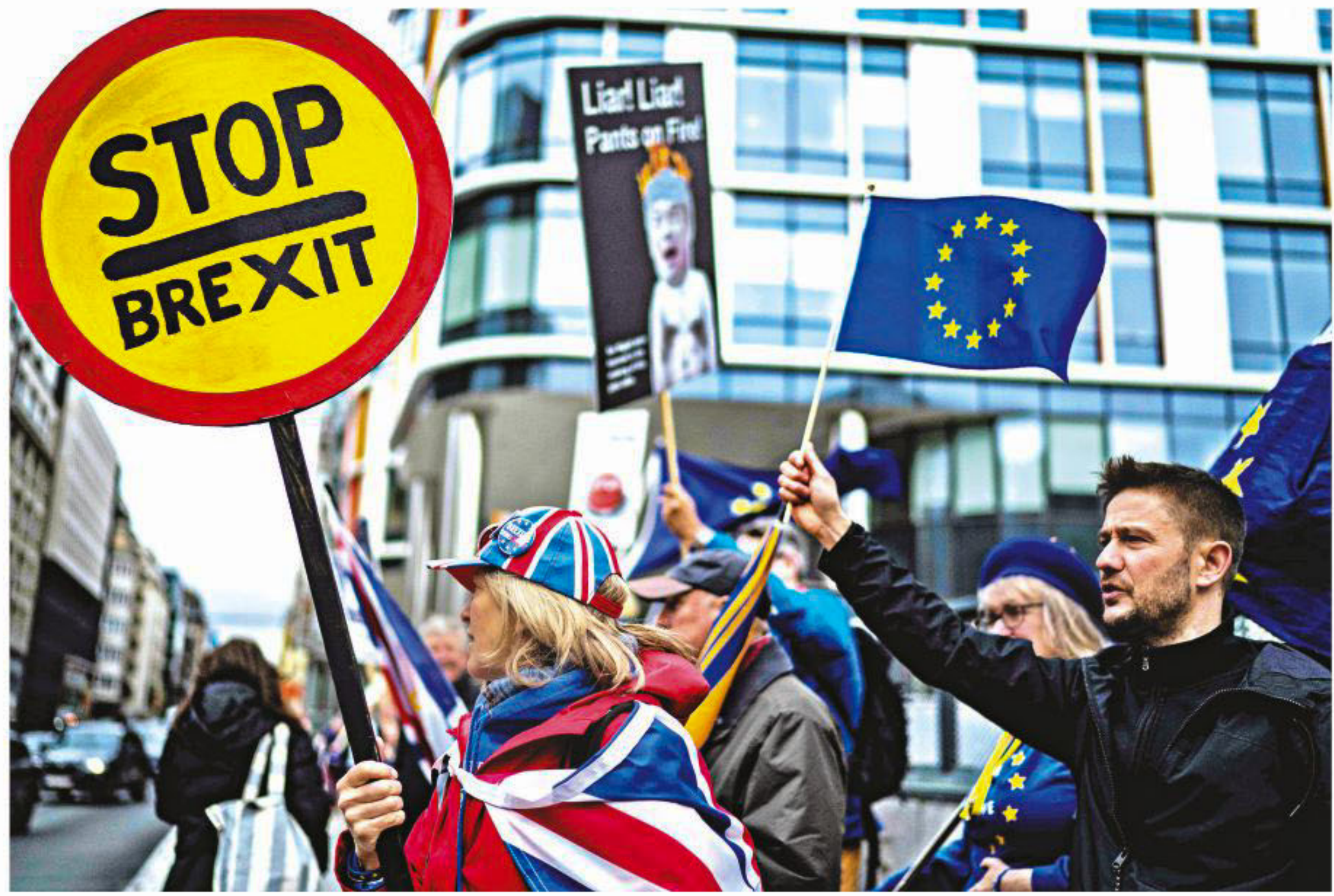
Anti-Brexit activists protest near the European Parliament in Brussels, yesterday. Britain's Brexit Secretary Steve Barclay will meet EU chief negotiator Michel Barnier in Brussels today, as talks on the country's exit from the bloc reach a critical stage, Downing Street said.