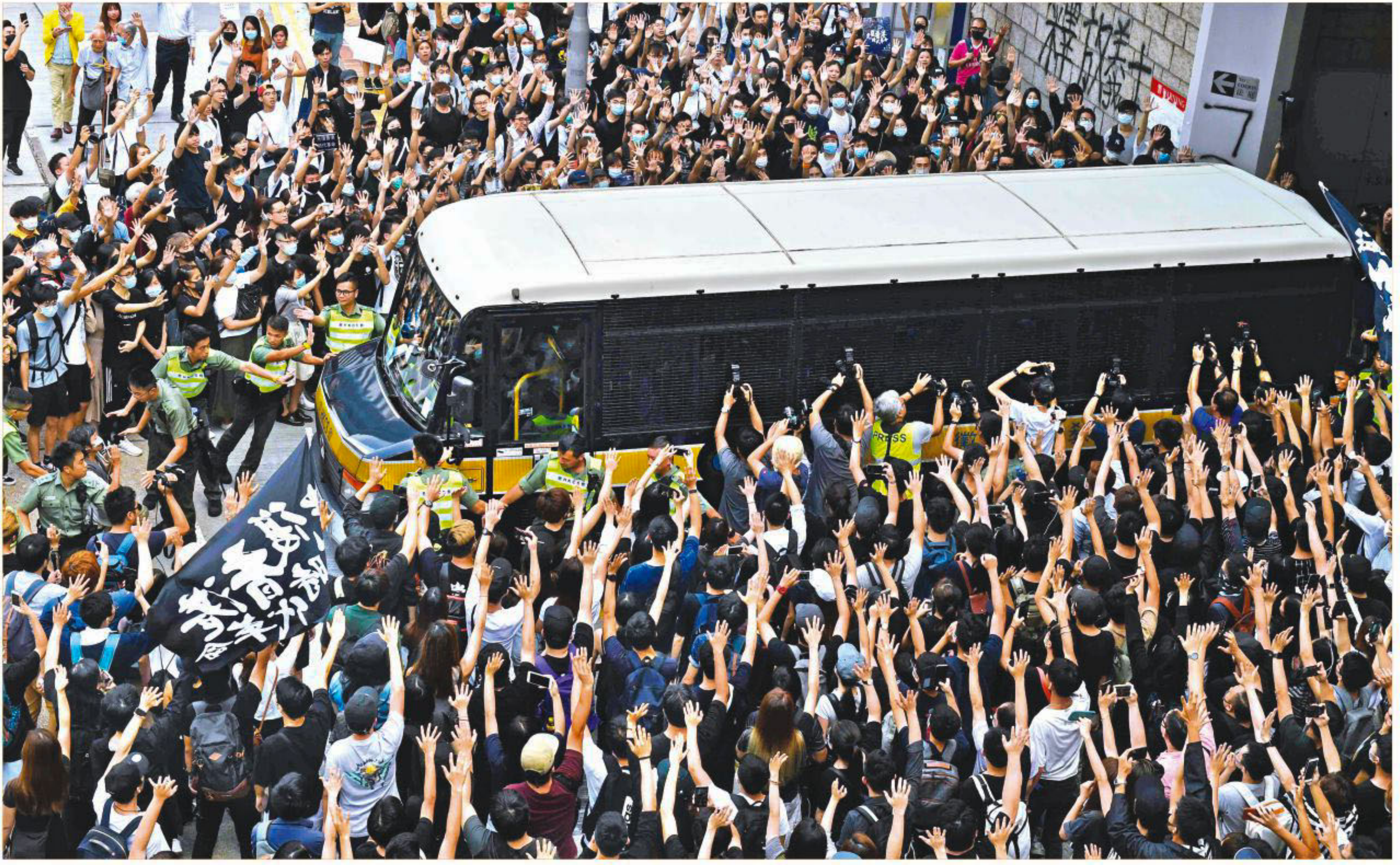
A correctional services van transporting Hong Kong activist Edward Leung, jailed for taking part in the 2016 Mongkok riots, leaves the High Court following an appeal hearing for his period of sentence in Hong Kong, yesterday.

The heightened US pressure on China's policies in Xinjiang comes at a tense time for the two countries, which have been locked in a trade war for more than a year.