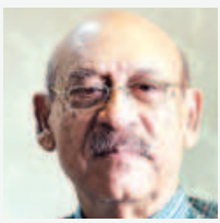
NOTED ACTOR ABUL HAYAT

"Some so-called meritorious students are becoming monsters. Why? They have to be stopped immediately."