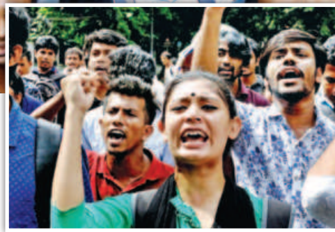
Dhaka University students marching with black flags in front of the Buet protesting the killing of Abrar Fahad and violence on campus yesterday. Inset, demonstrators of left-leaning student bodies in front of the Buet.