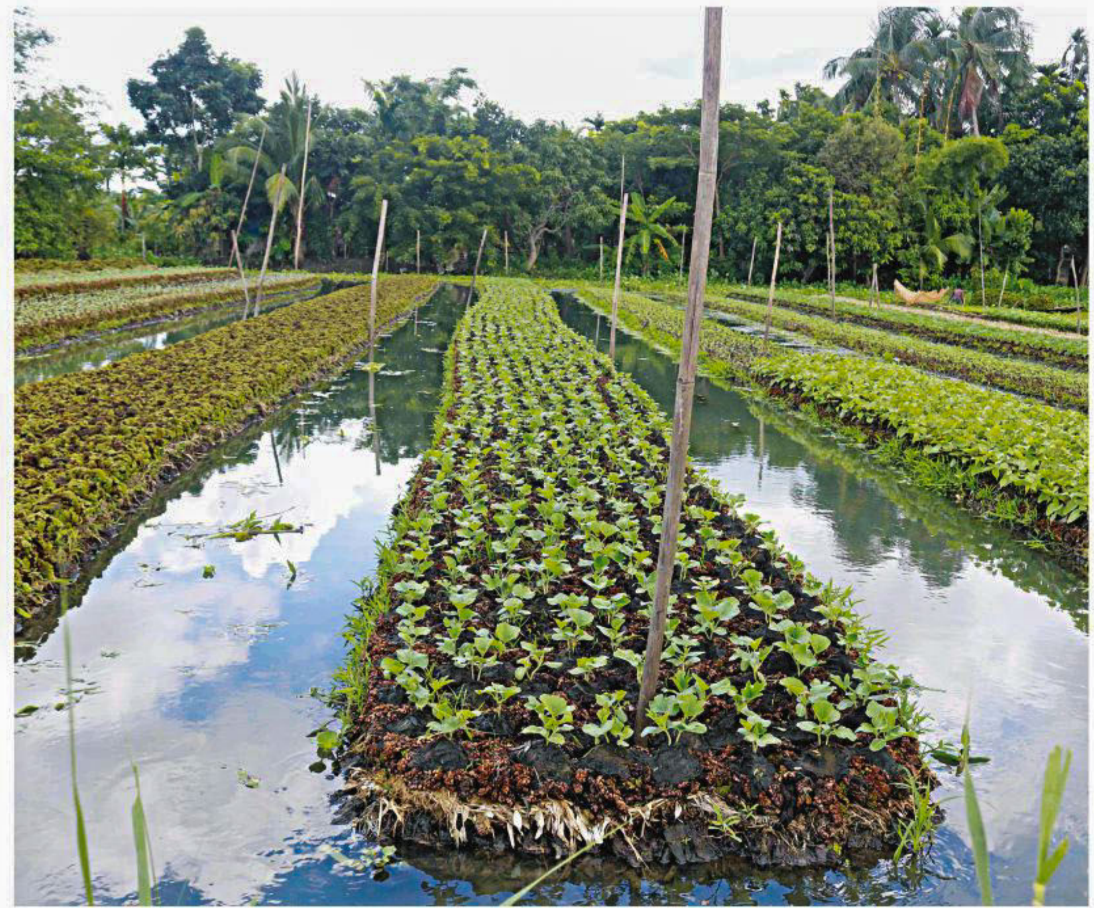
Women using aquatic weeds to make doullas for floating beds. Right, vegetables grow in a floating bed at Balodia village in Pirojpur's Nesarabad upazila.