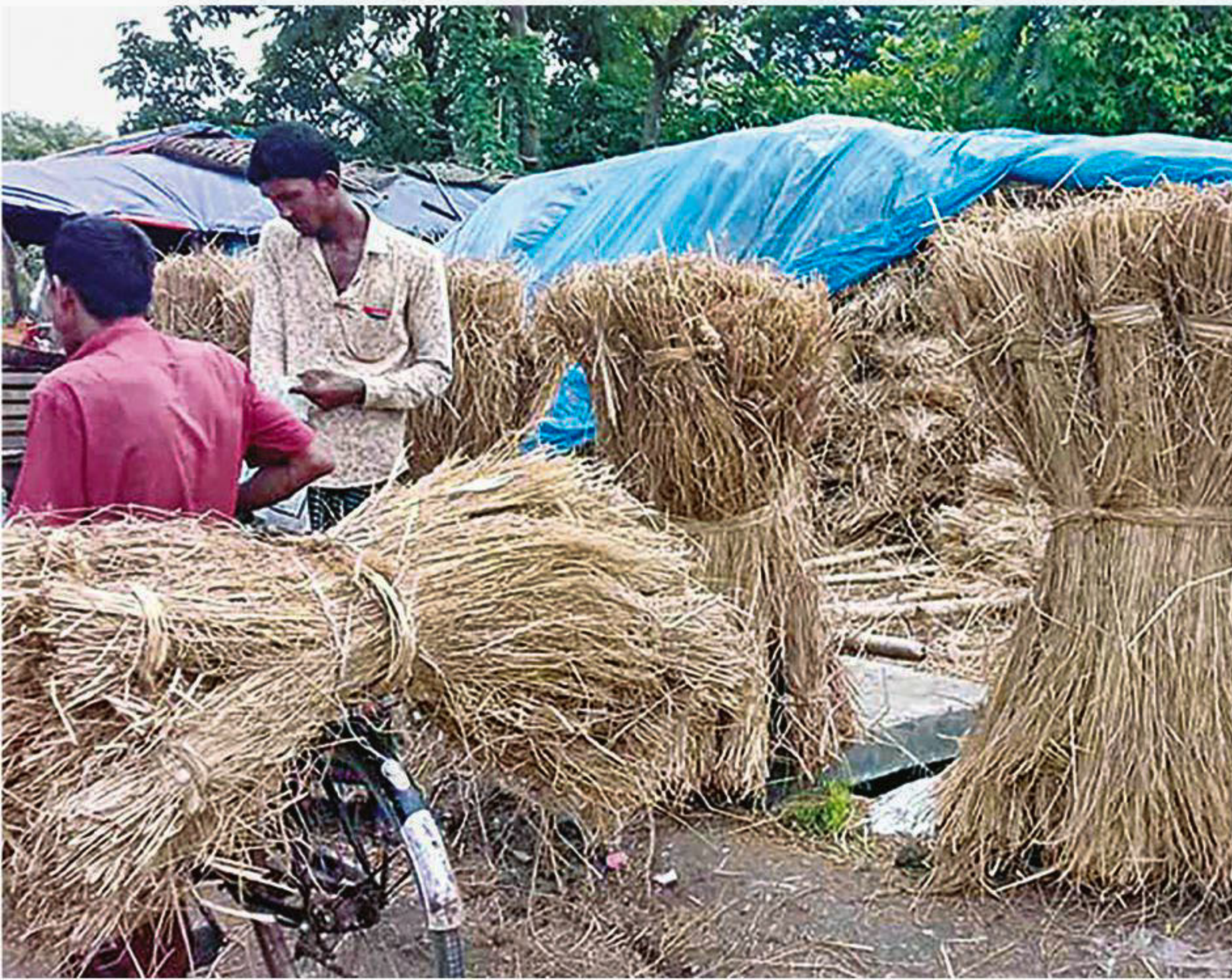
Straw, widely used as fodder, is kept for sale at Sundarganj Bazar in Gaibandha. The item is now selling at unreasonably high prices as cattle farmers in sandy lands of Teesta basin areas see fodder crisis due to the recent floods affecting vast croplands including those cultivated with Napier grass.

A gang might have strangled the youth and dumped the body in the river, said the police official.