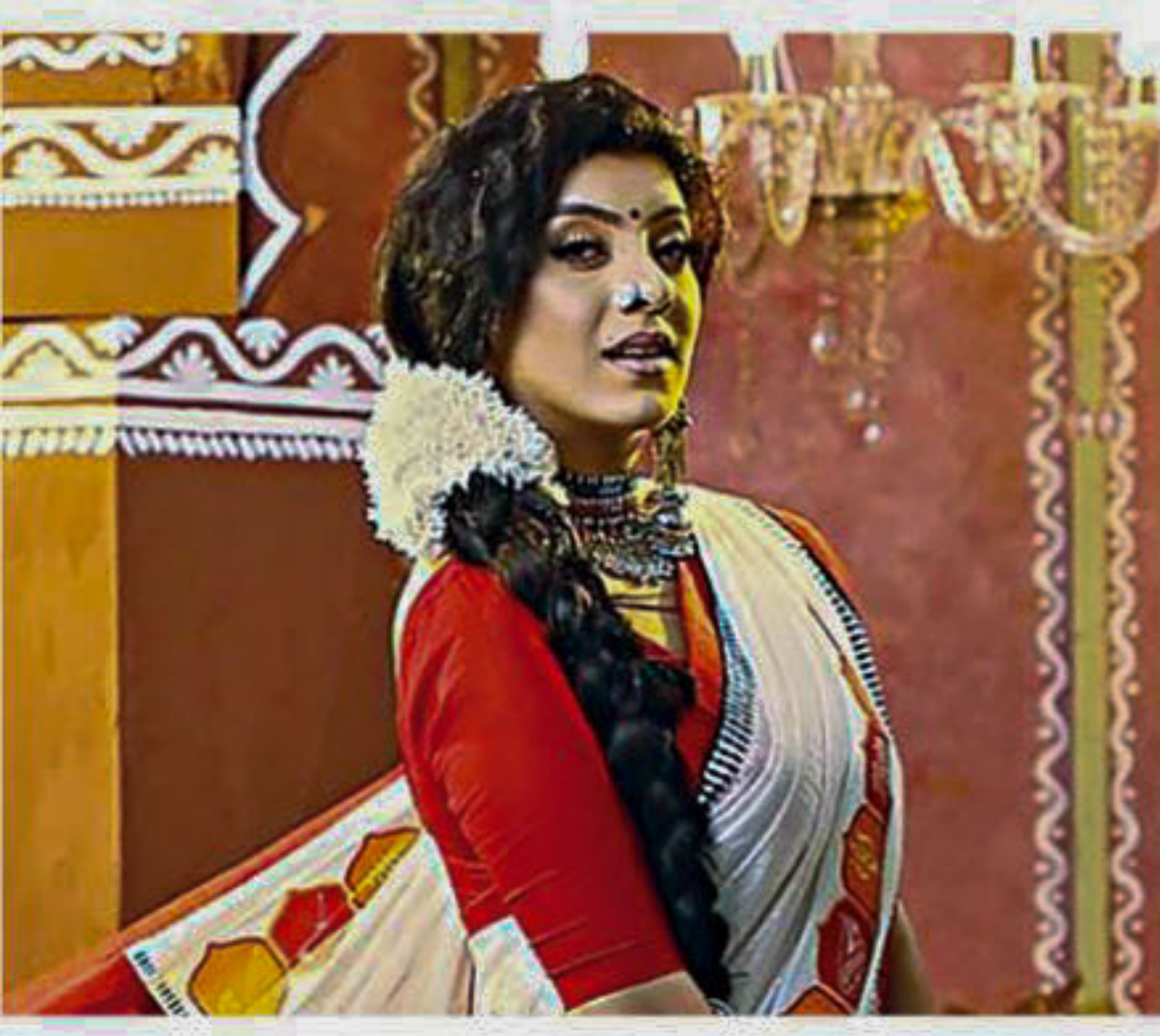
Mou gracing the Puja collection.

Solo Print Exhibition Title: "Transformation" by Md Rafiqul Islam Venue: La Galerie, AFD Date: September 27 - October 12 Time: 3 pm – 9 pm