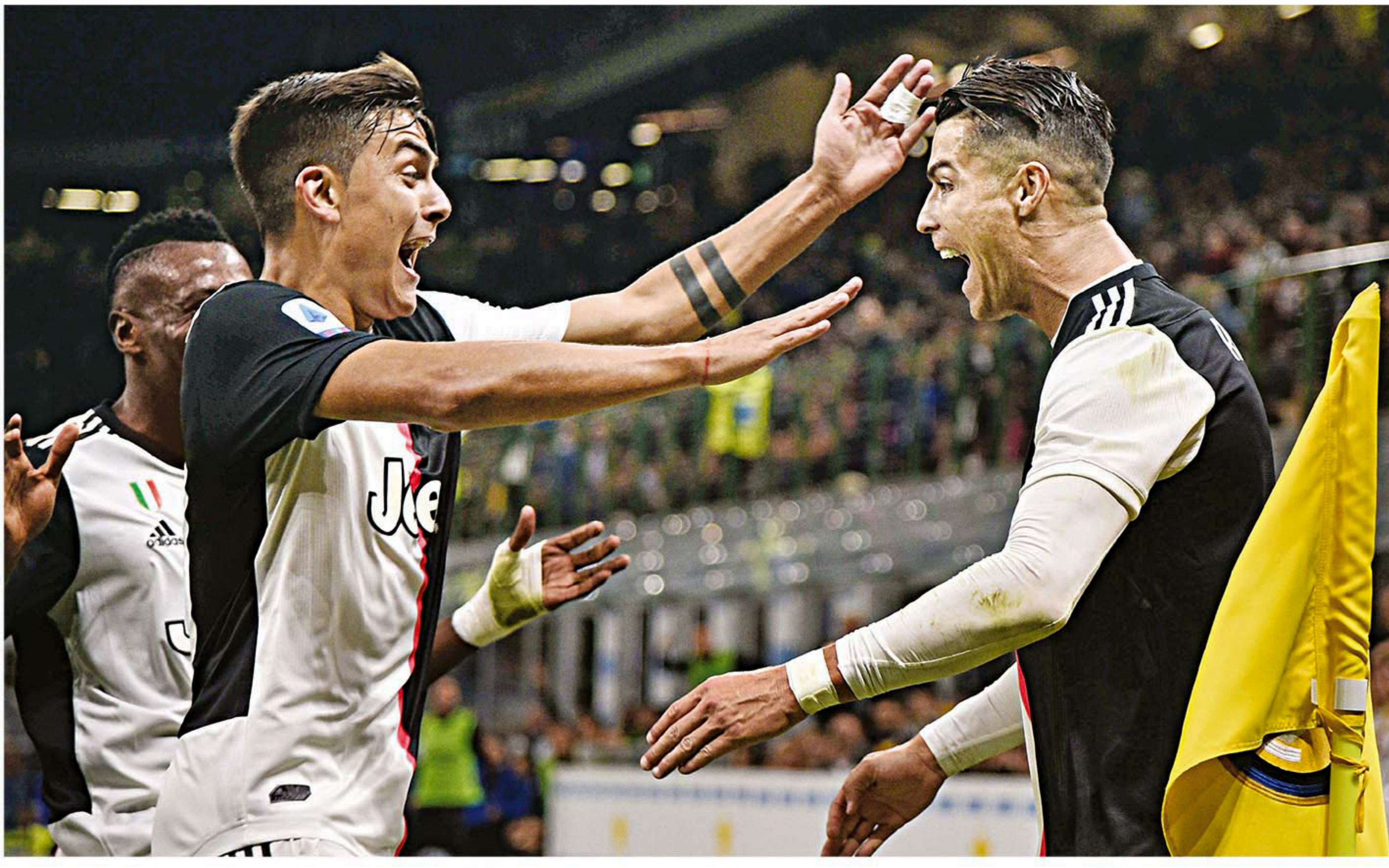
Juventus forward Paulo Dybala (R), who scored just four minutes into the match, celebrates with teammate Cristiano Ronaldo after the latter scored a goal during their Serie A encounter with Inter Milan at the San Siro Stadium in Milan yesterday. However, the ex-Real Madrid superstar had his goal disallowed.