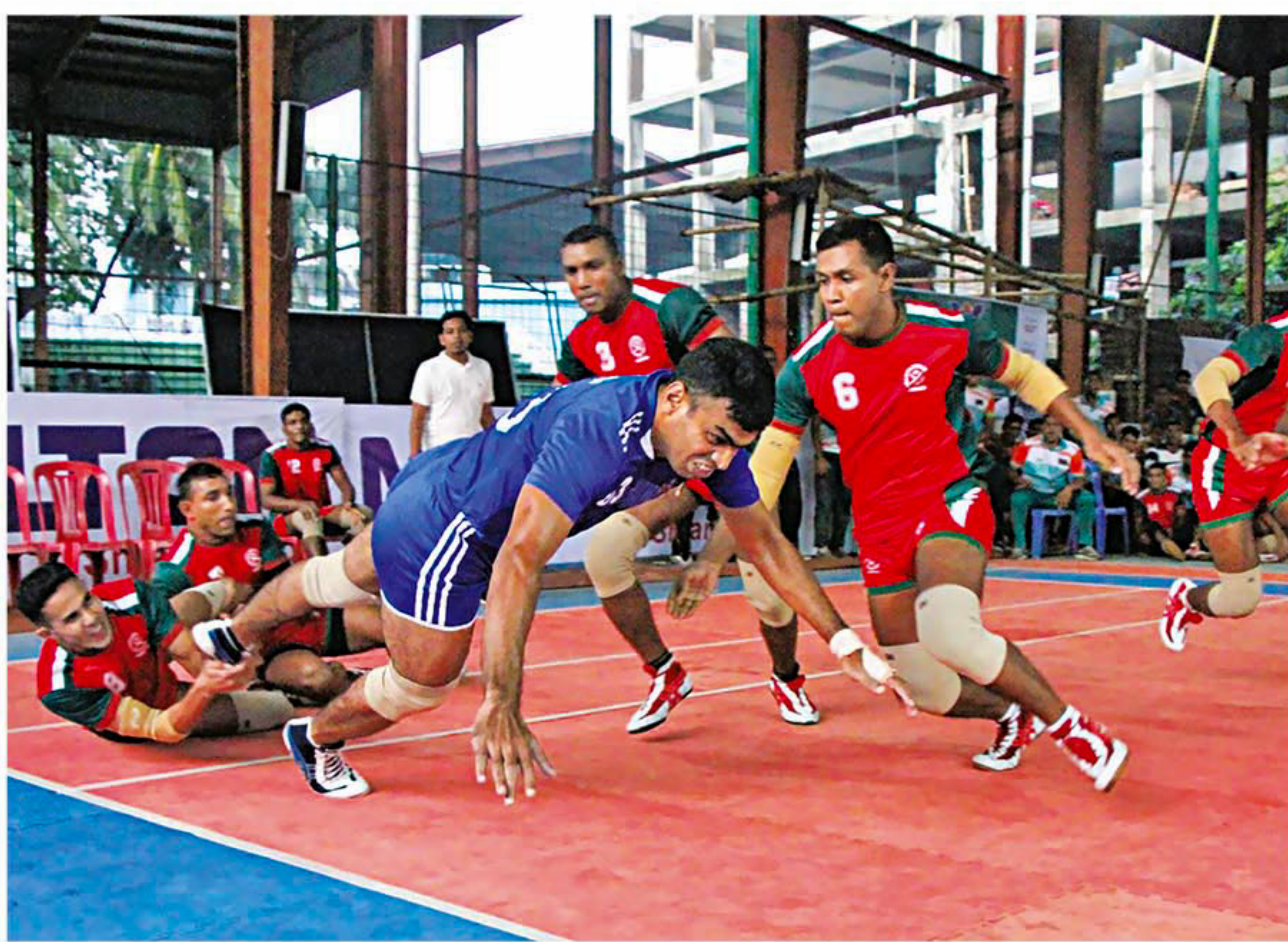
The match between Bangladesh Air Force (blue) and Bangladesh Army kicked off the super league stage of the Kabaddi Premier League at the Kabaddi Stadium in Paltan yesterday. Air Force won the closely-contested encounter by 44-37 points.

Steve Mandanda will take over in goal for France against Iceland while Paulo Gazzaniga, who replaced Lloris on Saturday, is likely to continue in the role for struggling Spurs.