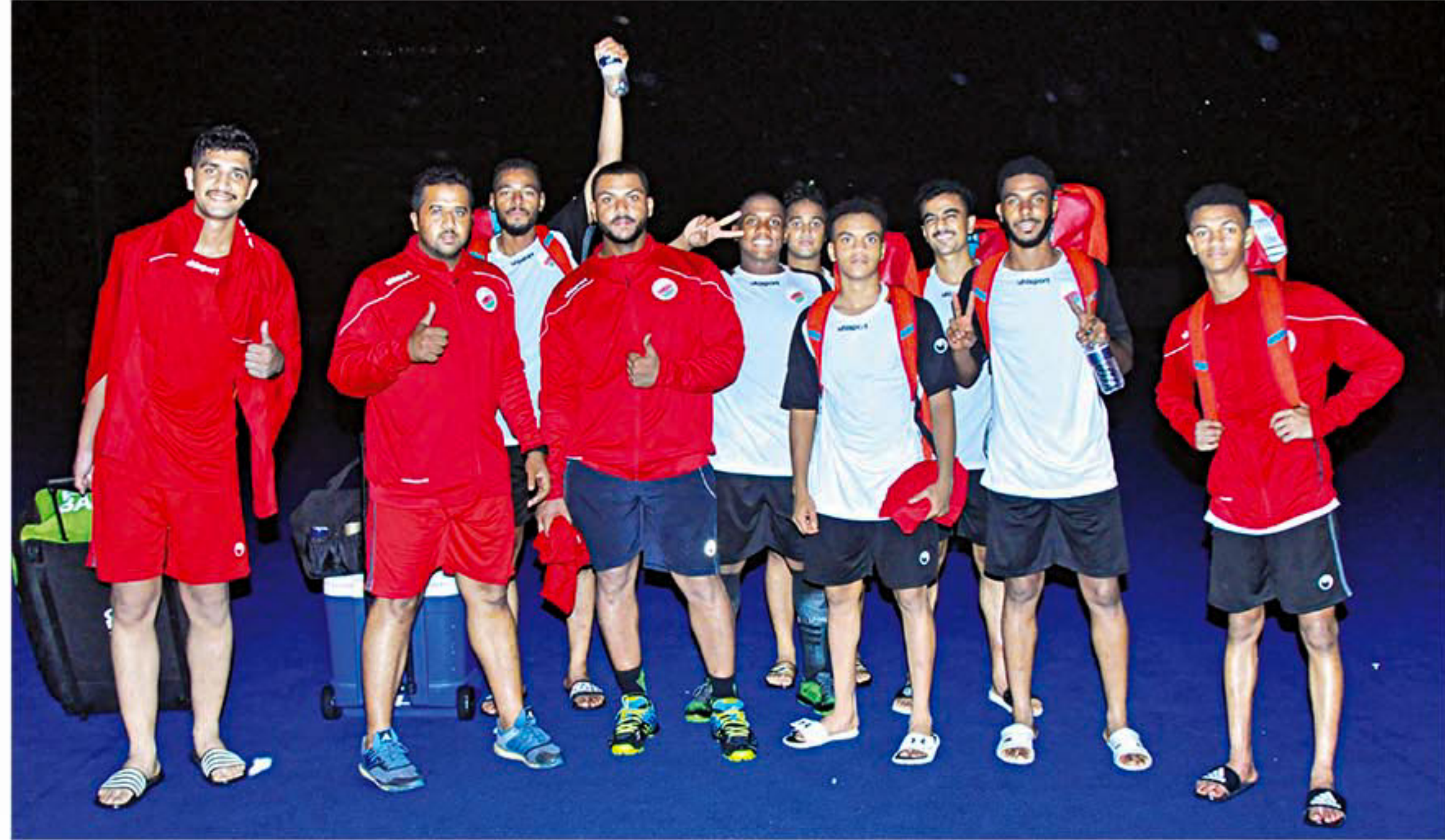
The Oman under-21 hockey team, who are here for five matches against their Bangladesh counterparts, had their first training session at the Maulana Bhasani Hockey Stadium yesterday.