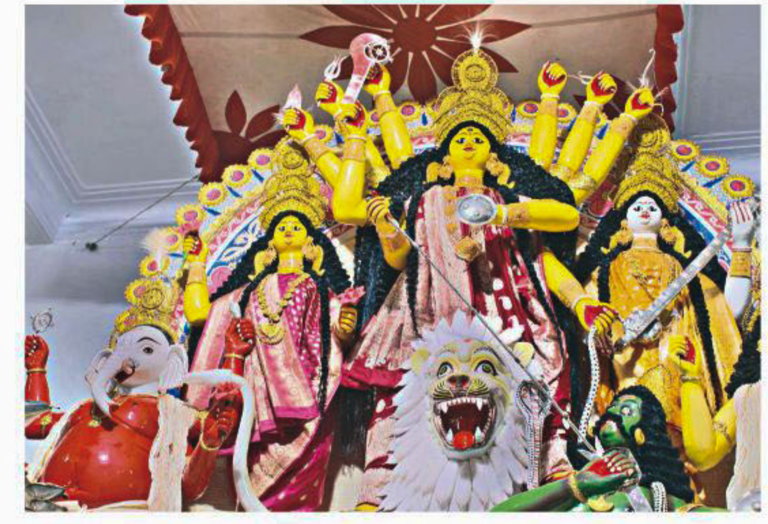
Ranada Barir Puja