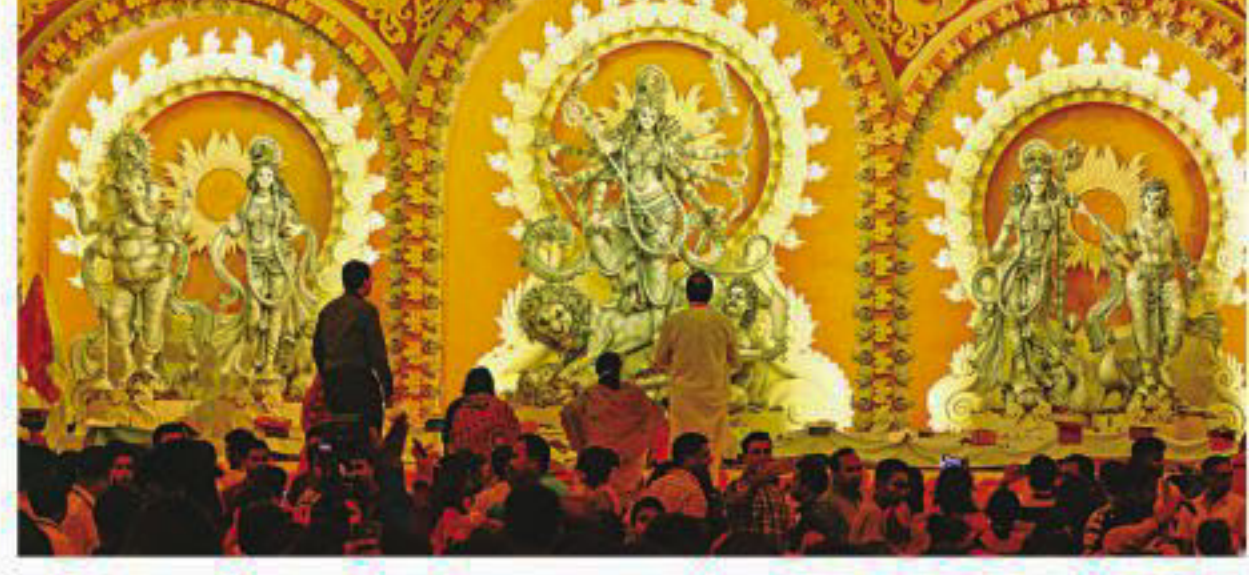
Devotees paying their respects to the Pratima.