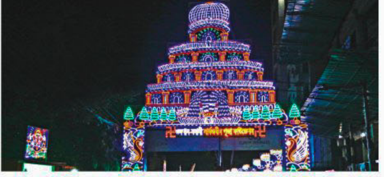
The brilliantly lit entrance.