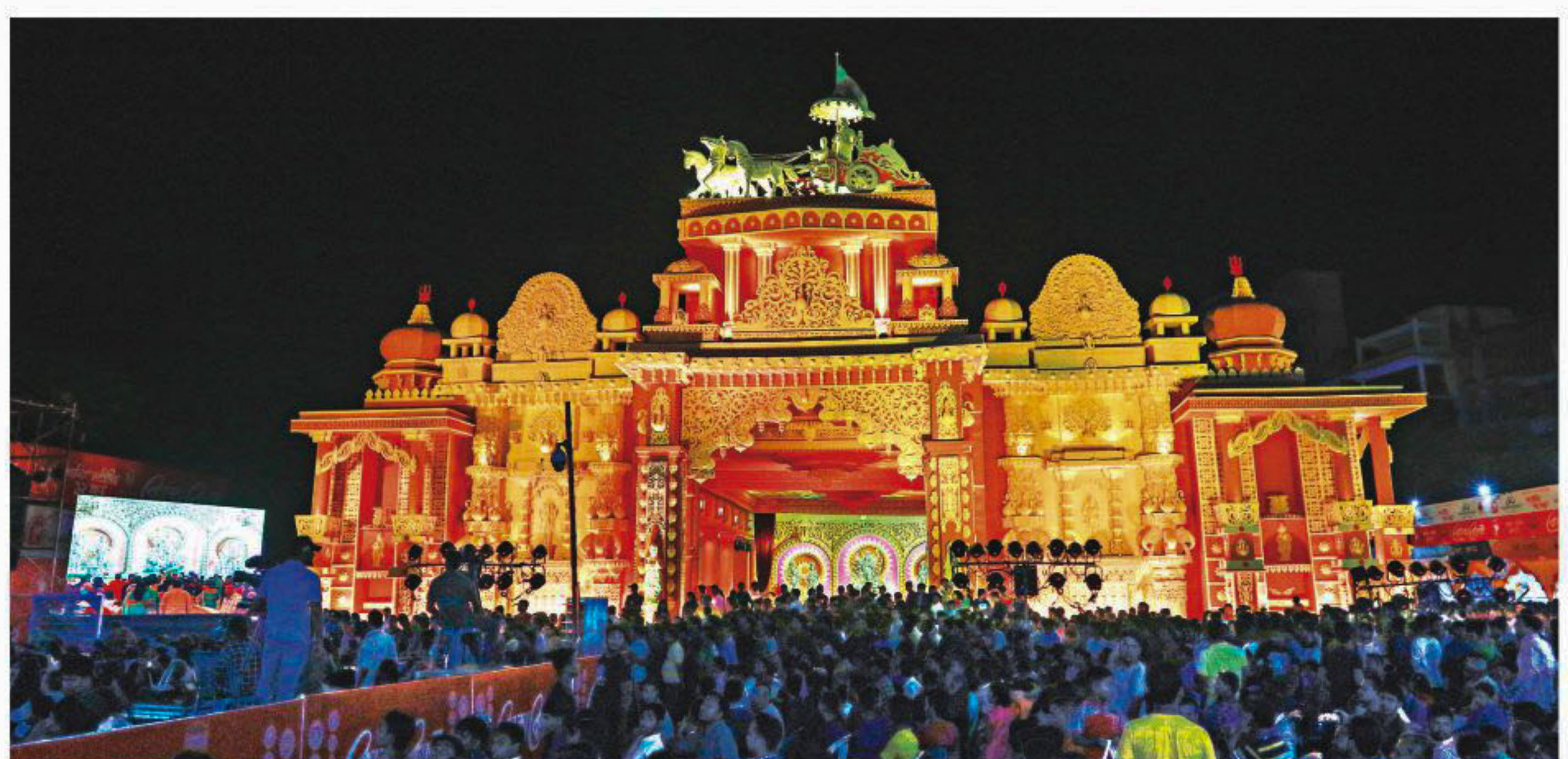
Thousands of people flocking the beautiful Mandap.