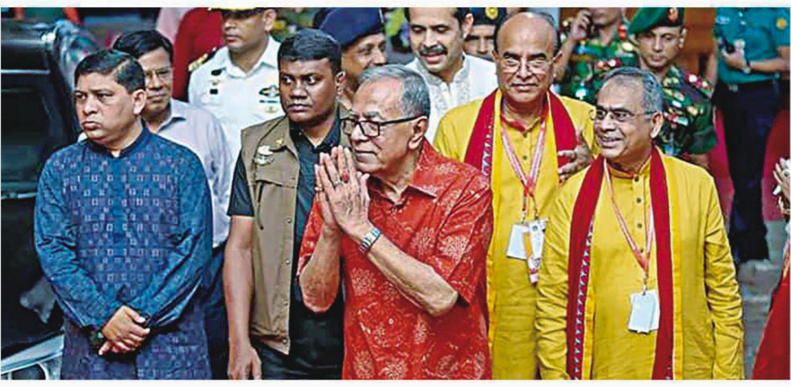
President Abdul Hamid (C) visits Banani Puja Mandap.