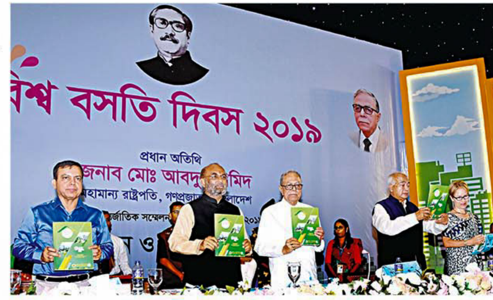
President Abdul Hamid unveils the housing ministry's special publication in the capital, marking World Habitat Day.

Says President Abdul Hamid on World Habitat Day BSS, Dhaka World Habitat Day 2019 was observed yesterday in Bangladesh and the rest of the world, in a bid to raise awareness among people about safe shelter. United Nations designated the first Monday of October every year as World Habitat Day to reflect on the state of our towns and cities, and on the basic human rights to adequate shelter. The day is also intended to remind the world that we all have the power and responsibility to shape the future of our cities and towns. The theme of the year is "frontier technologies as an innovative tool to transform waste to wealth". On the eve of the day, President M Abdul Hamid and Prime Minister Sheikh Hasina issued separate messages. In his message, President Abdul Hamid said, "It is indispensable to use creative technology along with proper utilisation of resources to fulfil the demand of increasing urbanisation in developing countries." In light of vision 2041, he said the government has taken various steps for building a sustainable and environment-friendly urban