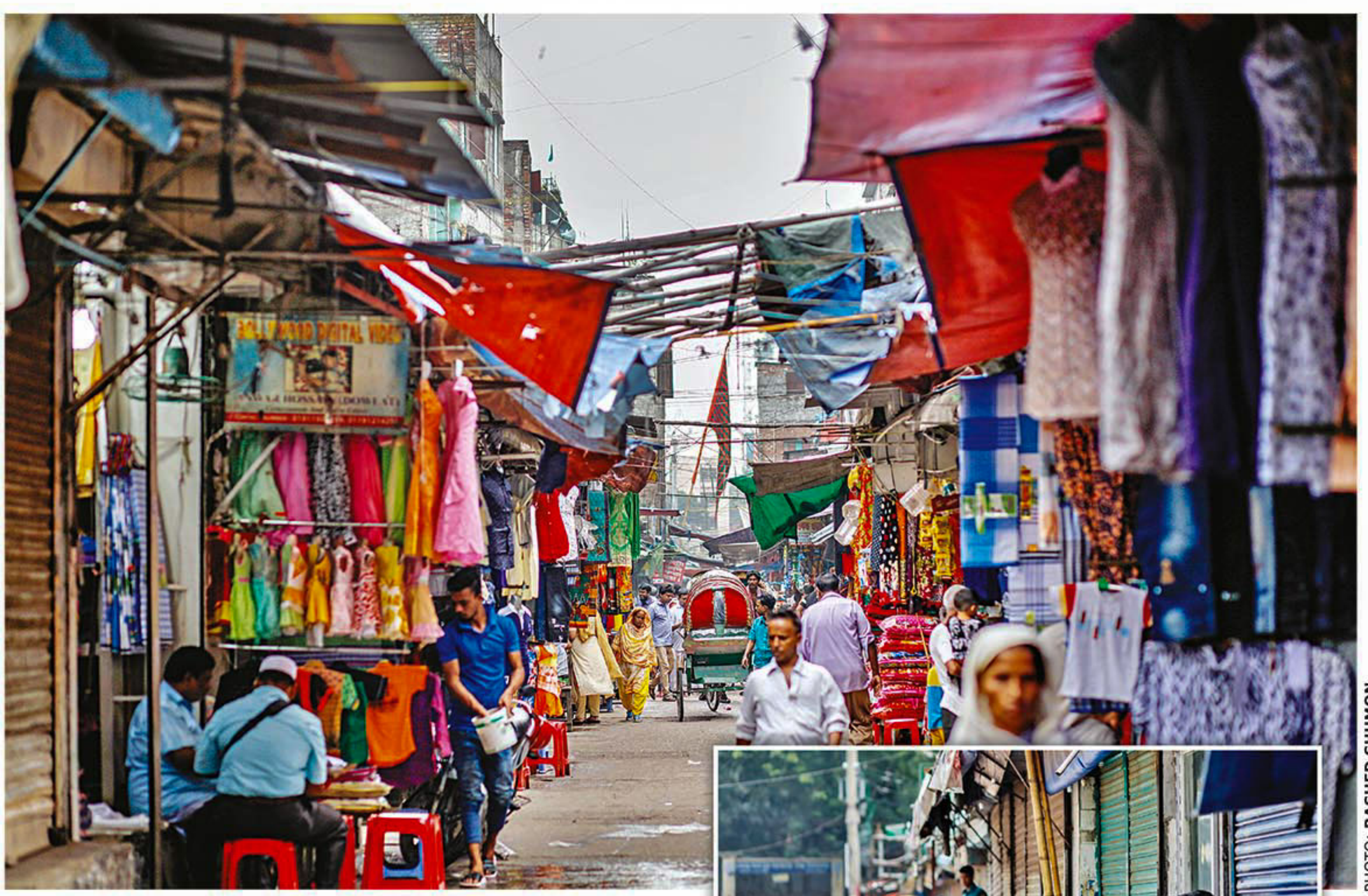
Life is slowly getting back to normalcy at the Geneva Camp in Mohammadpur, three days after a clash between locals and police here left scores injured. Shops inside the camp alleys were seen open with people getting on with their day-to-day business. However, shops at the entrance of the area remained close where police personnel remained deployed, inset the photos were taken yesterday morning.