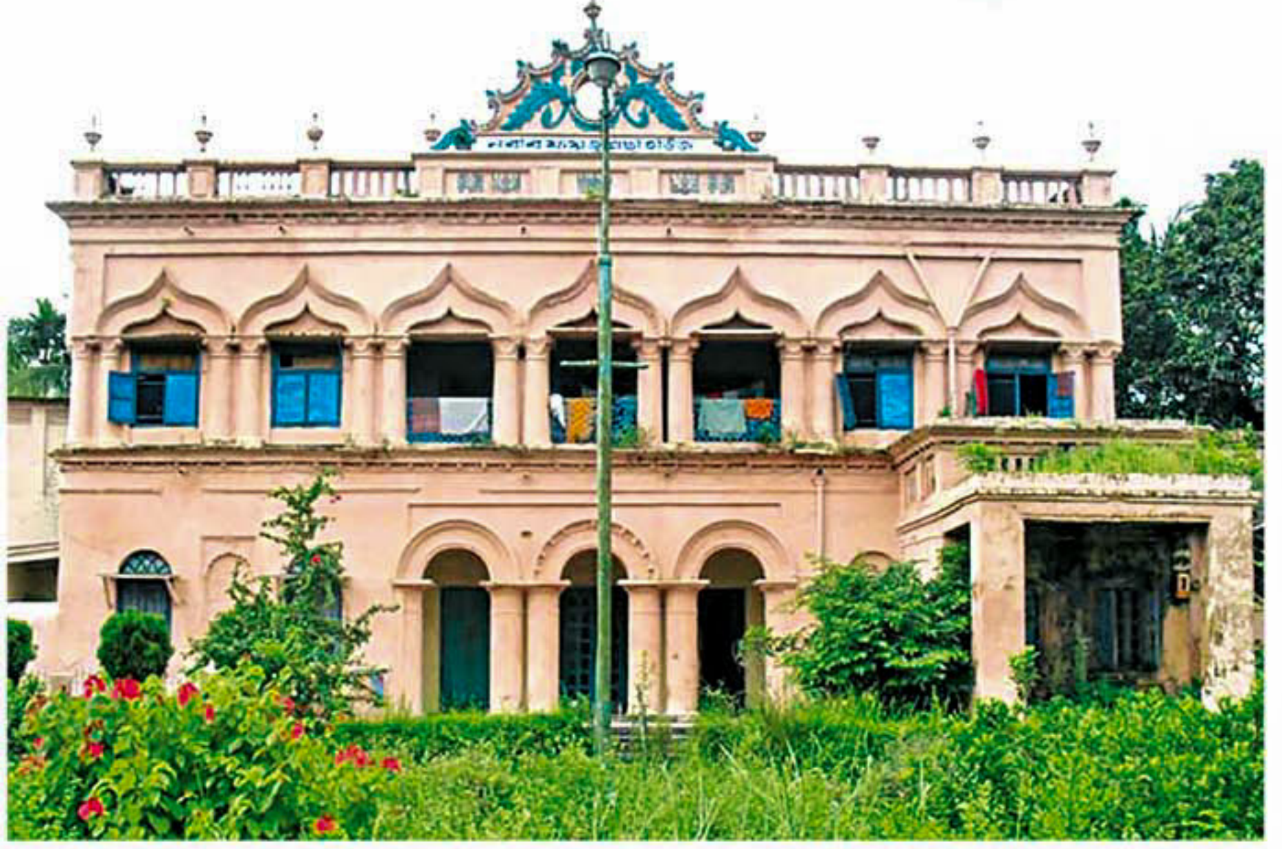
The work of preserving the homestead of Nawab Faizunnesa underway.