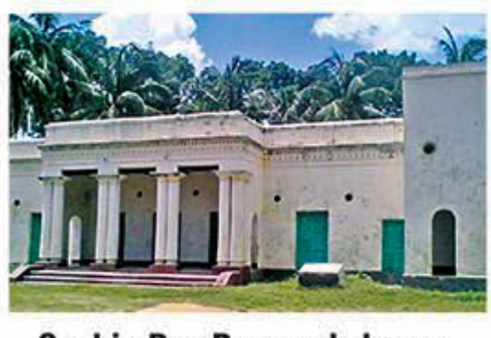
Sachin Dev Burman's house