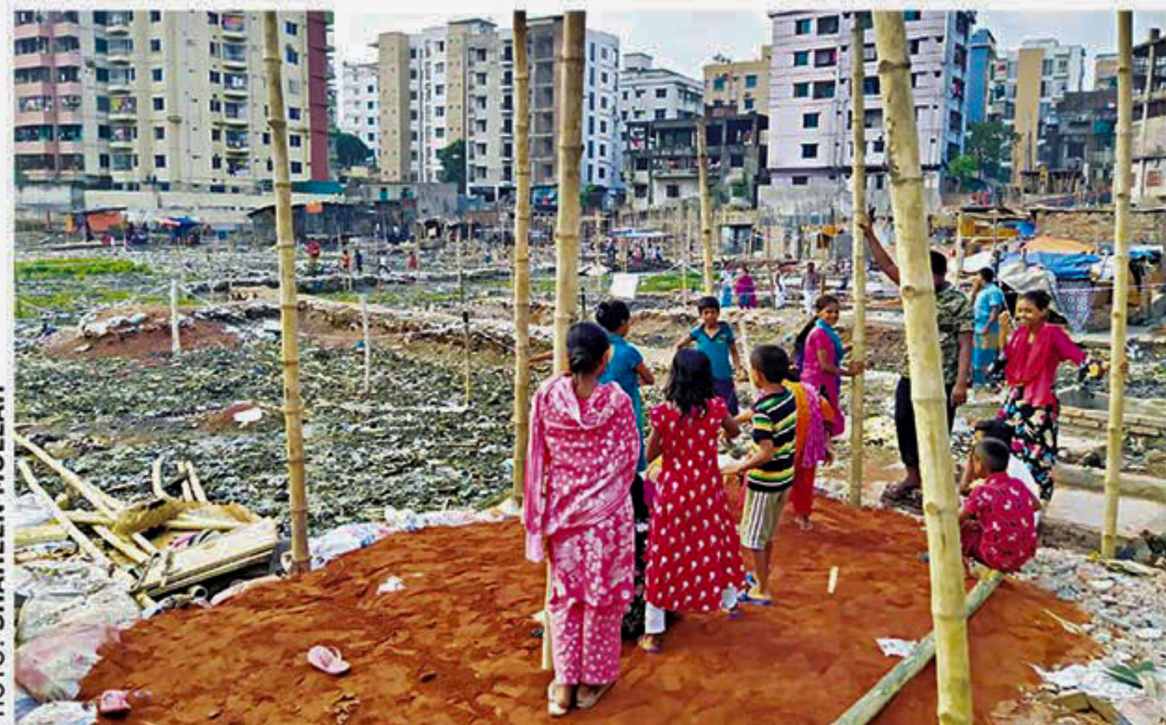
Some dwellers, who have been attempting to rebuild shanties at the site of the Chalantika slum in Mirpur that was razed by a fire in August, say police are obstructing them from doing so. The photo was taken yesterday.