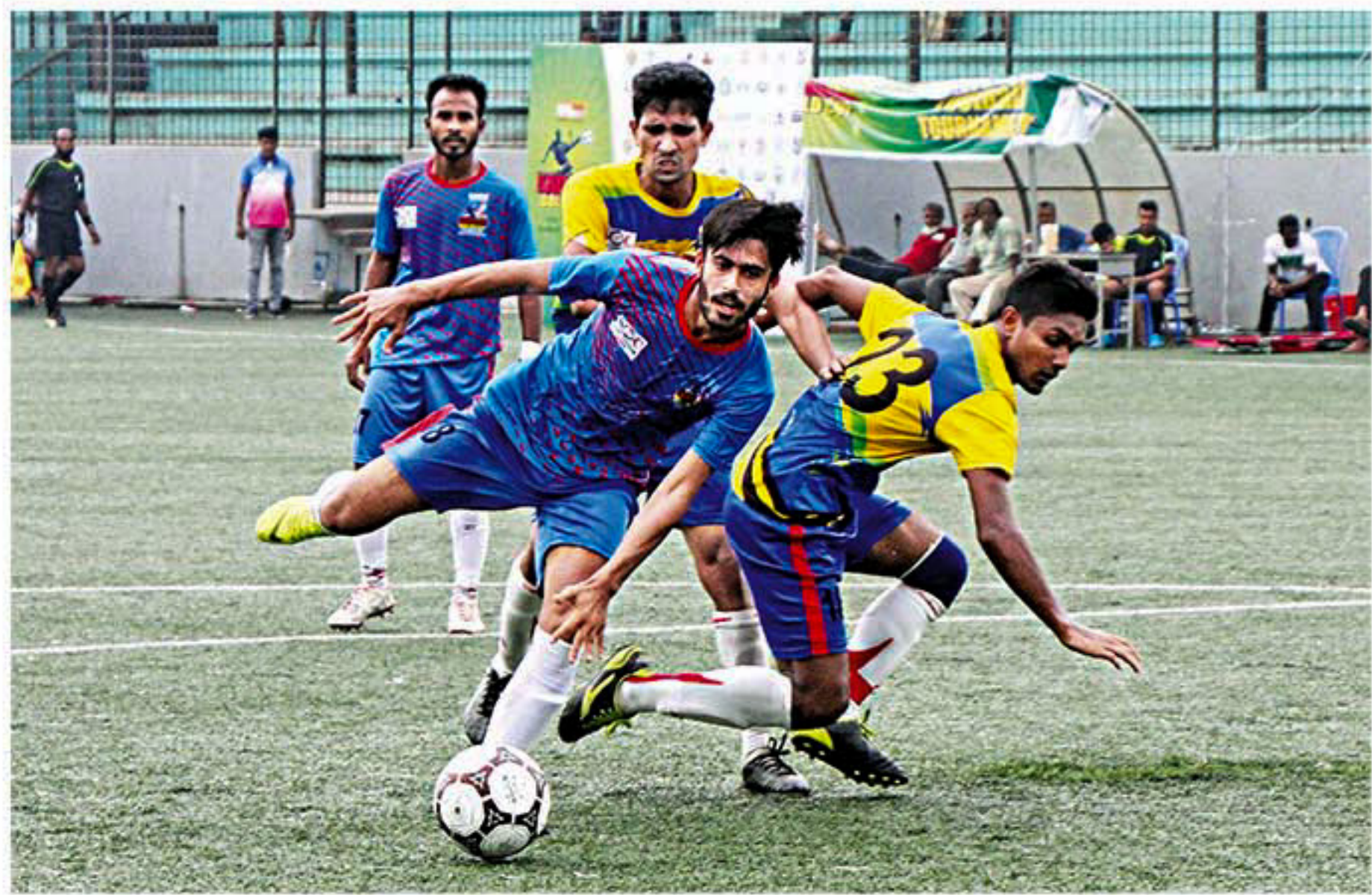
A Gono University player jostles for the ball with his Jahangirnagar University counterpart during a Faraz Intervarsity Gold Cup match in Kamalapur yesterday. Gono University won the encounter 3-0.