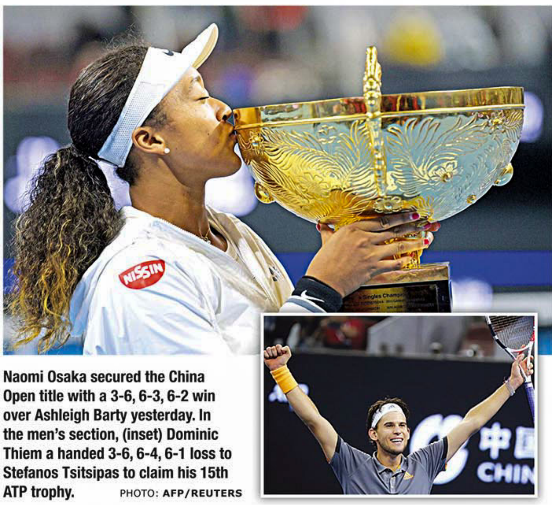
Naomi Osaka secured the China Open title with a 3-6, 6-3, 6-2 win over Ashleigh Barty yesterday. In the men's section, (inset) Dominic Thiem a handed 3-6, 6-4, 6-1 loss to Stefanos Tsitsipas to claim his 15th ATP trophy.