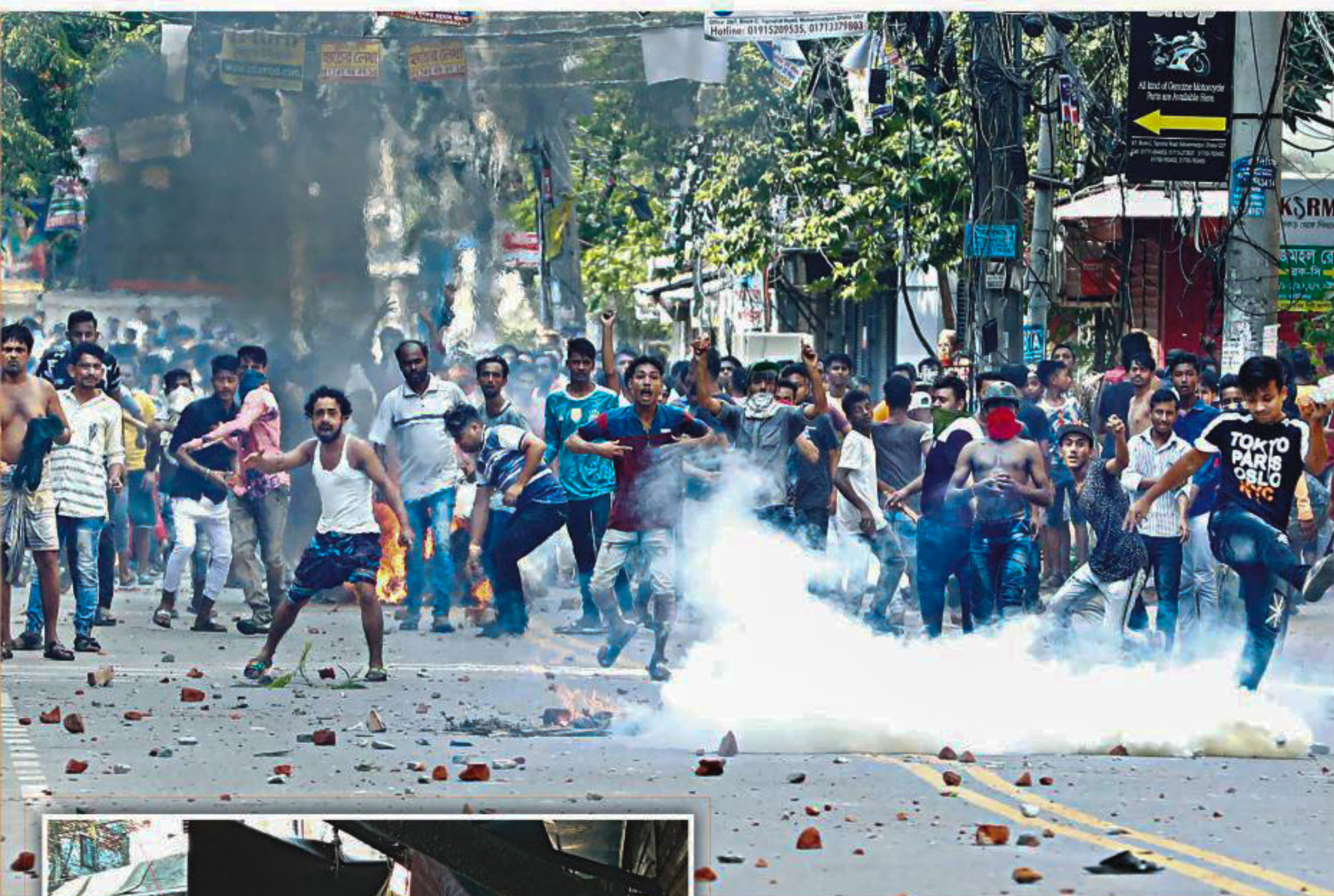
Residents of the Geneva Camp in the city's Mohammadpur in running battles with law enforcers yesterday protesting power supply disruptions. The police, inset, storm the camp and clashed with protesters in the alleys.