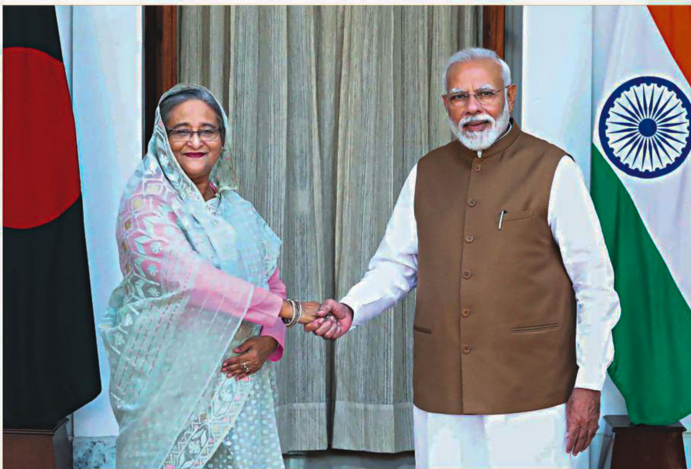
Prime Minister Sheikh Hasina and Indian PM Narendra Modi shake hands as the latter receives her at the Hyderabad House in New Delhi yesterday.

The Indian PM said his government was SEE PAGE 2 COL 1 PM RECEIVES 'TAGORE PEACE AWARD 2018' - PAGE 2