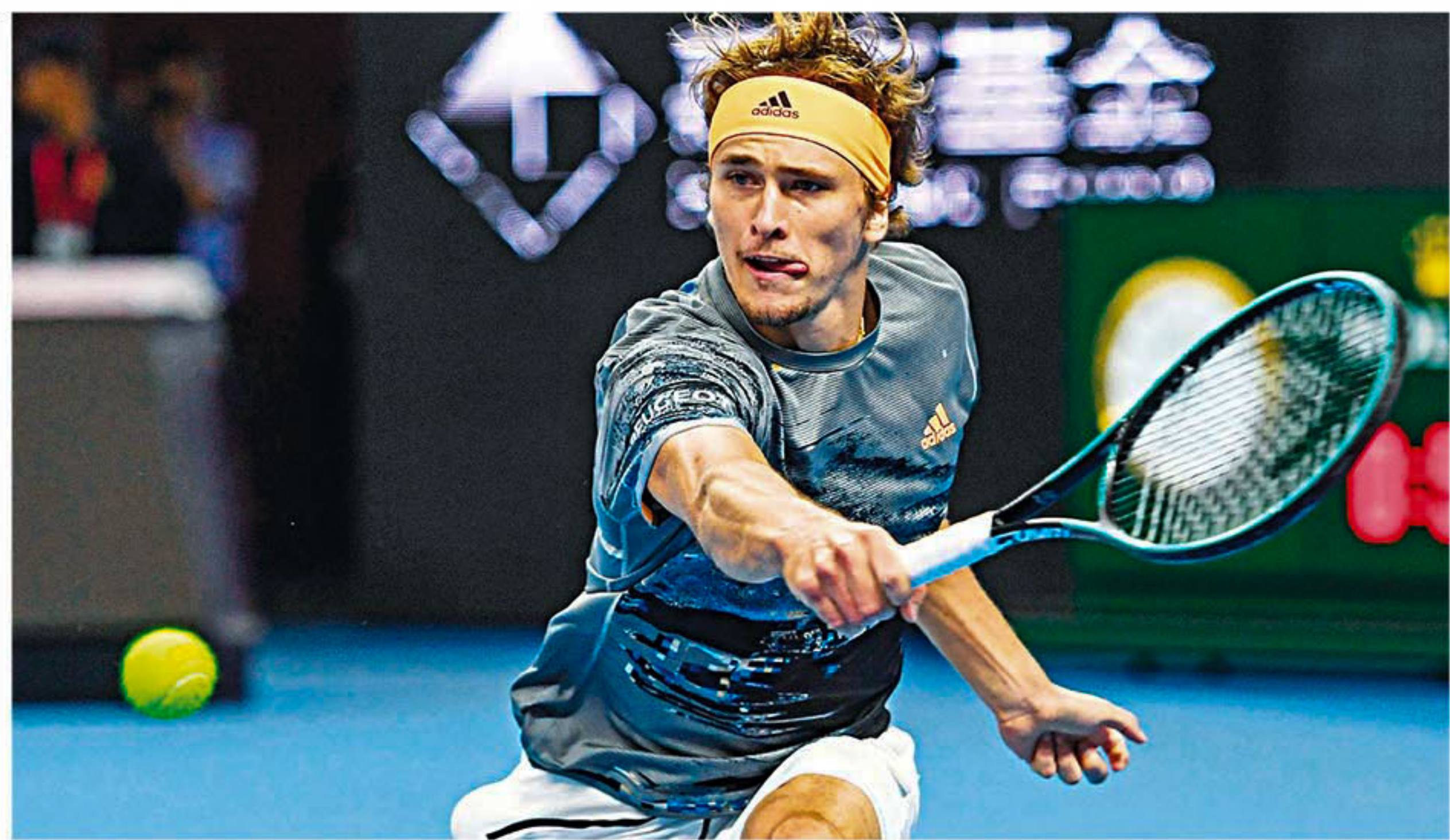
Alexander Zverev drove past Sam Querrey 7-6(3), 6-2 to secure a semifinal berth in the China Open in Beijing yesterday. Meanwhile, (bottom) Andy Murray made his exit after being beaten 6-2, 7-6(3) by top seed Dominic Thiem.

Martinez added he was "relatively optimistic" about Courtois who was replaced at half-time in Real Madrid's 2-2 draw with Club Brugge on Tuesday due to a stomach problem. The Red Devils sit top of their group unbeaten before hosting San Marino on October 10 before travelling to Kazakhstan three days later.