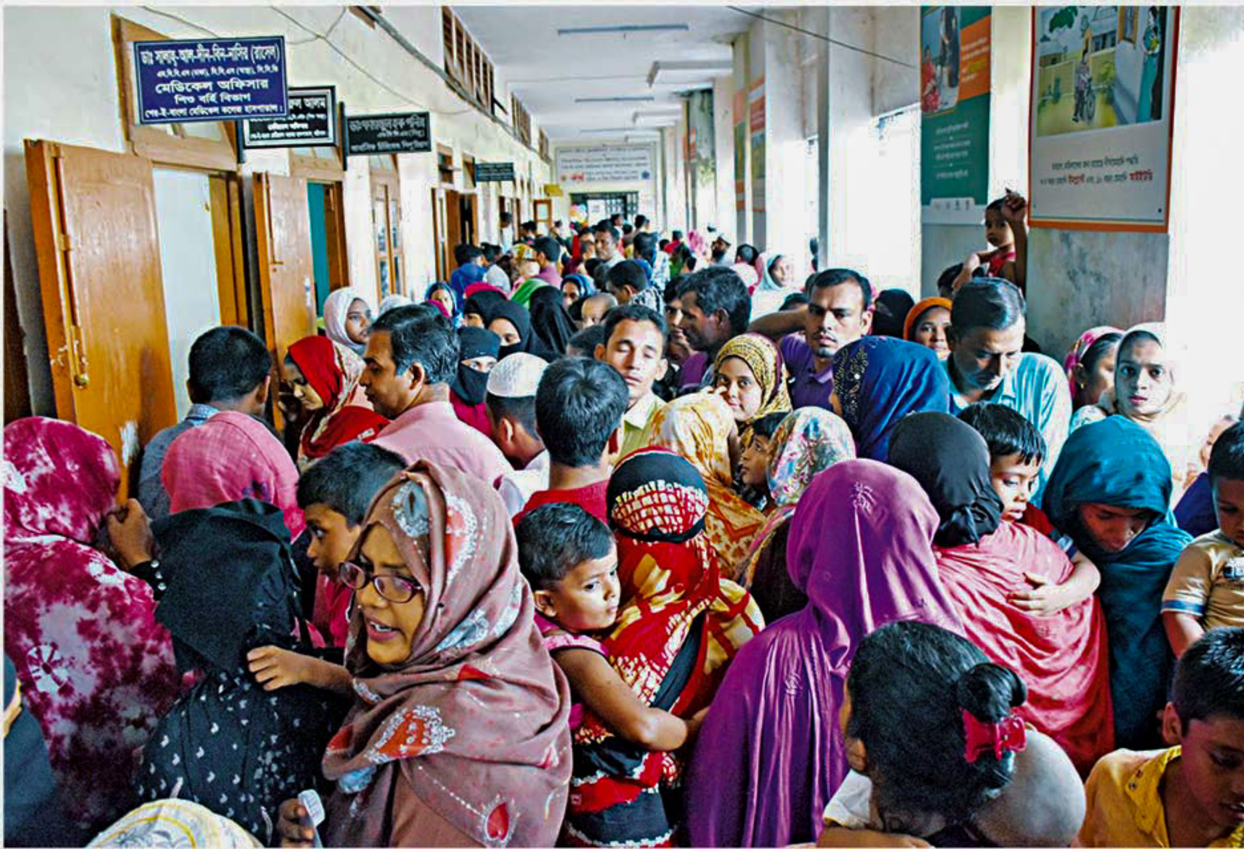
Crammed into a corridor, guardians along with their little ones wait for their turn to see a doctor at the children's ward of Sher-e-Bangla Medical College Hospital in Barishal.