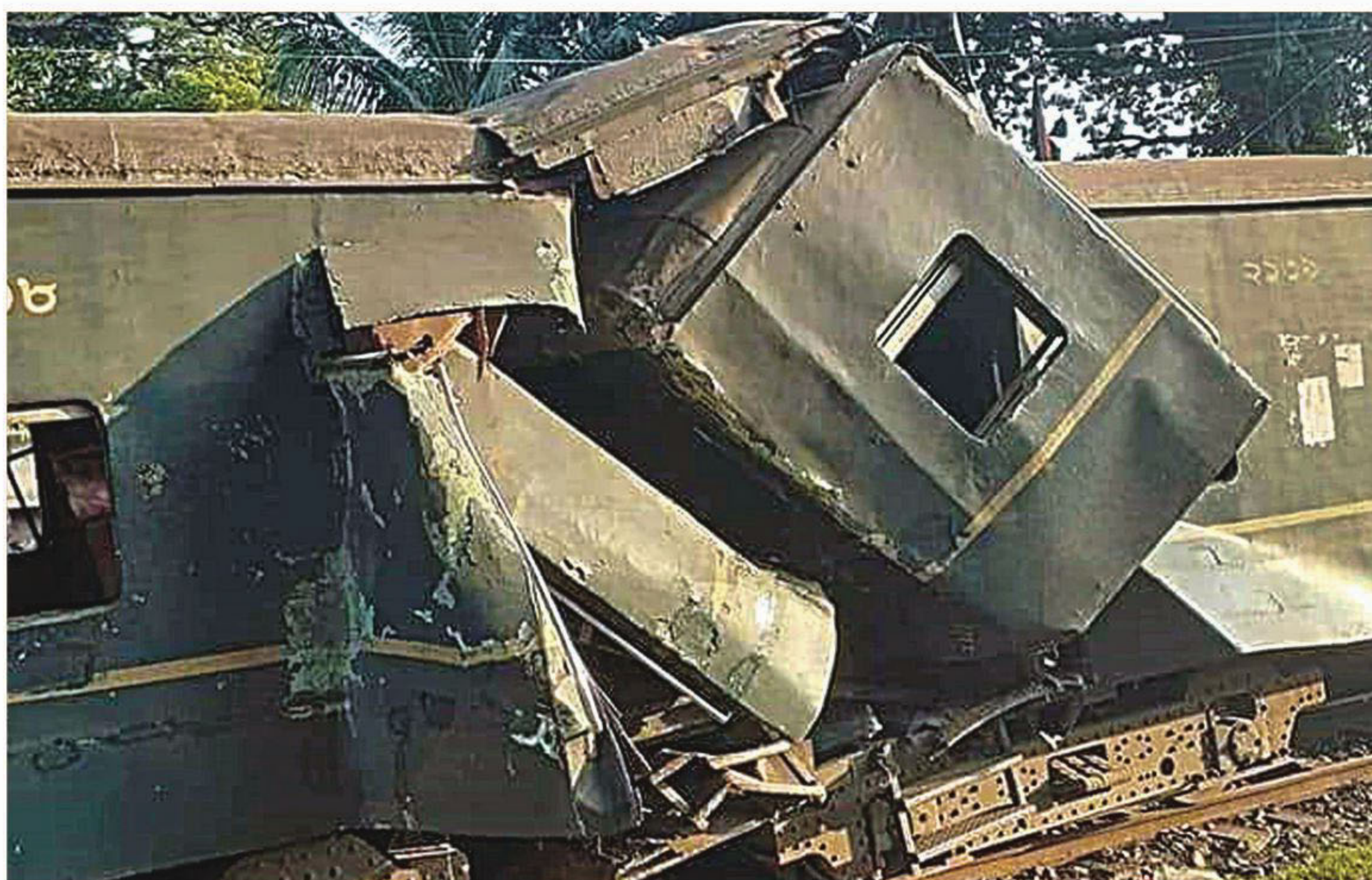
Wreckage of train carriages after a locomotive hit them hard at Kaunia Railway Station in Rangpur yesterday afternoon. The accident left a passenger dead and at least 80 others injured.