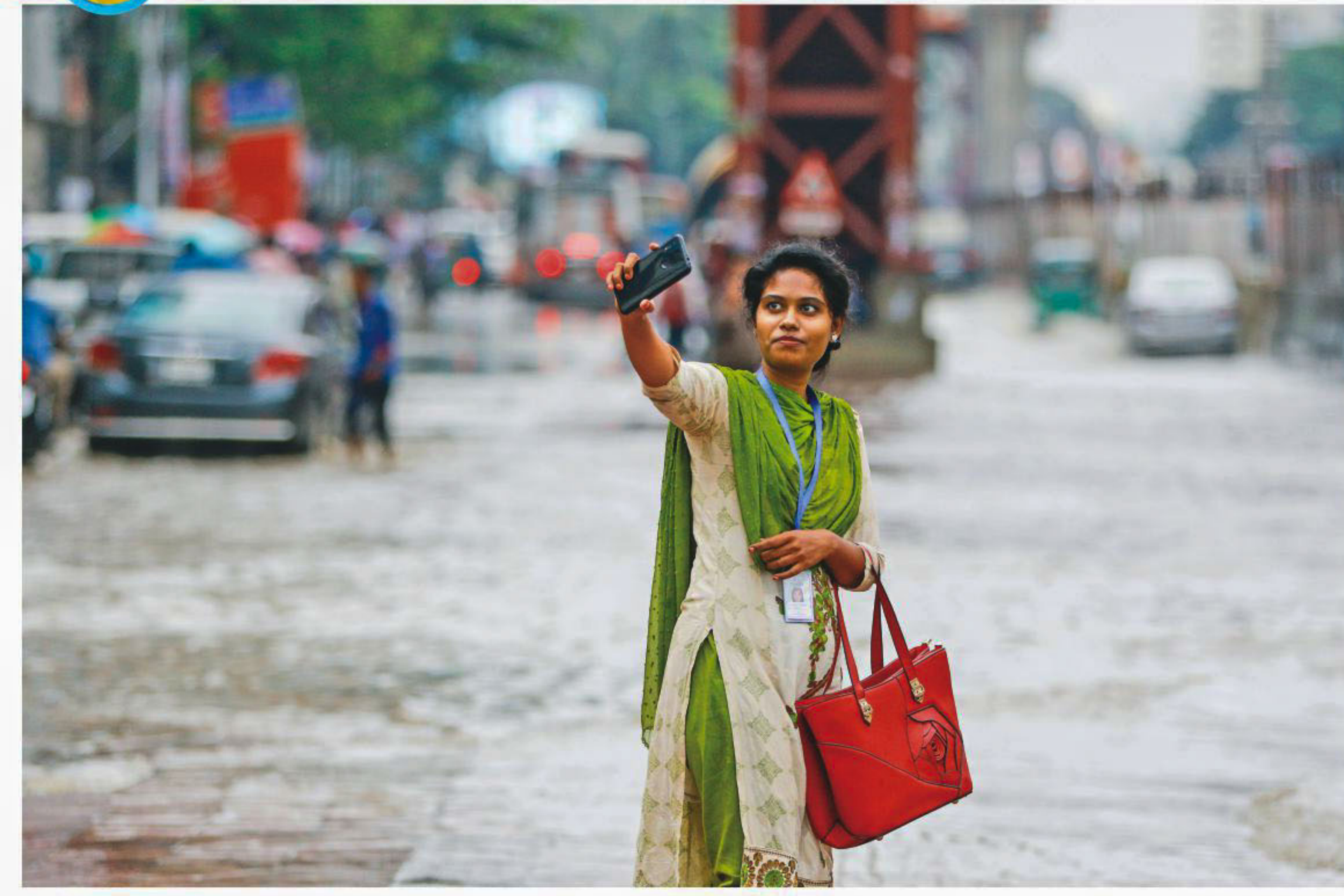
Rain or shine, any time is apparently a good time for a selfie. The photo was taken yesterday at Karwan Bazar, after heavy rainfall flooded Dhaka streets.