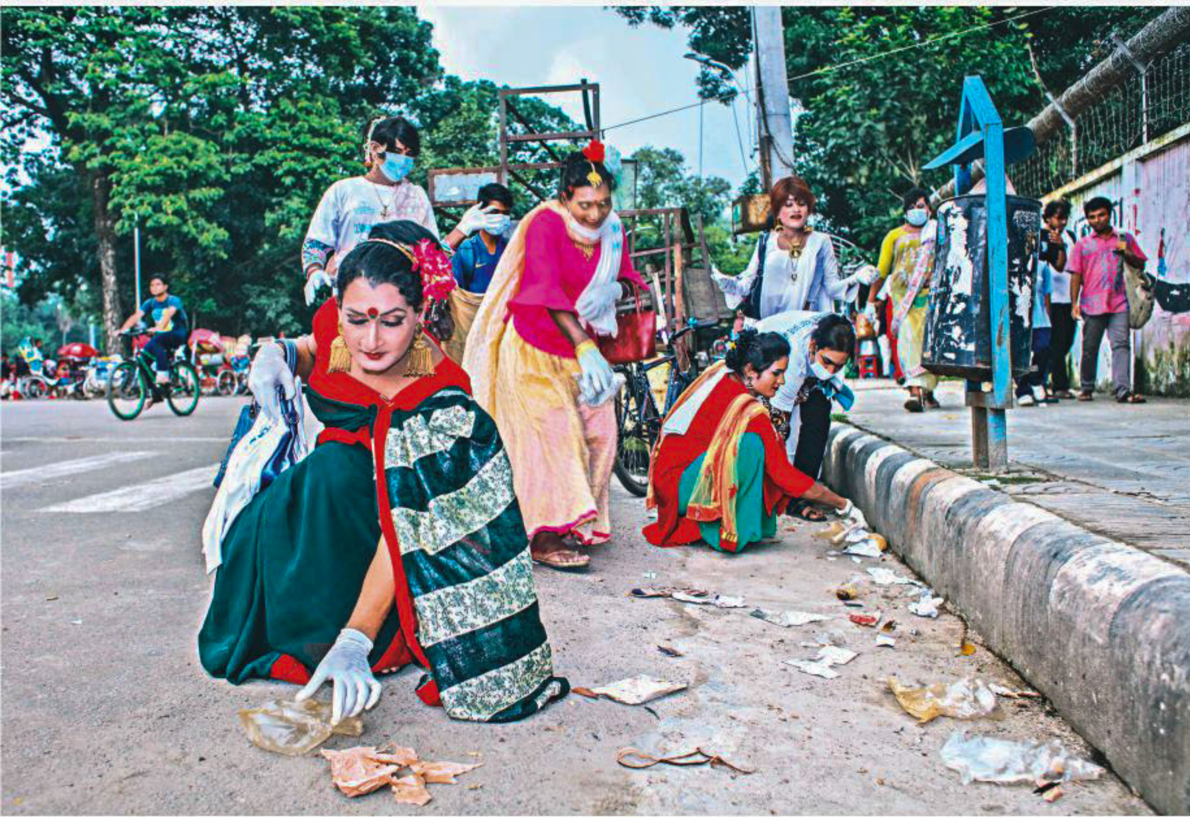
Members of transgender community take part in a cleaning drive in Dhaka University's TSC area yesterday. Brihannala, a non-government organisation, arranged the event.