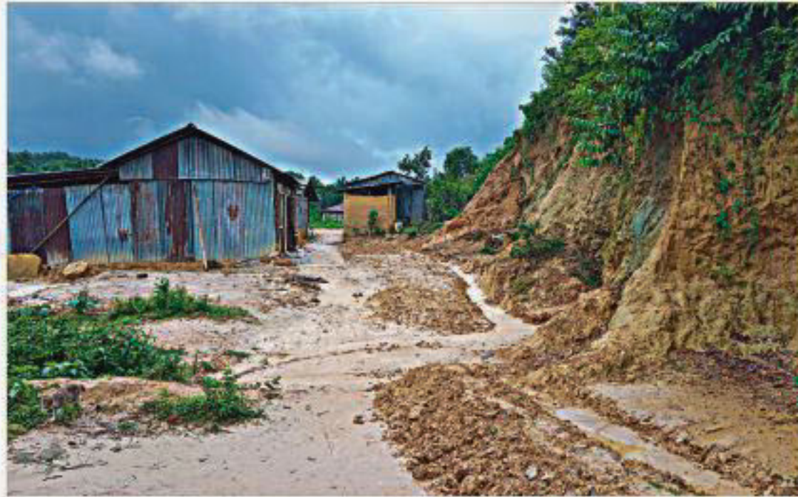
Structures built by cutting parts of a hillock in the centuries-old Tarapur Tea Estate in Sylhet's Baragul. Bottom right, a madrasa has been set up, razing another part of the hillock. The photos were taken recently.