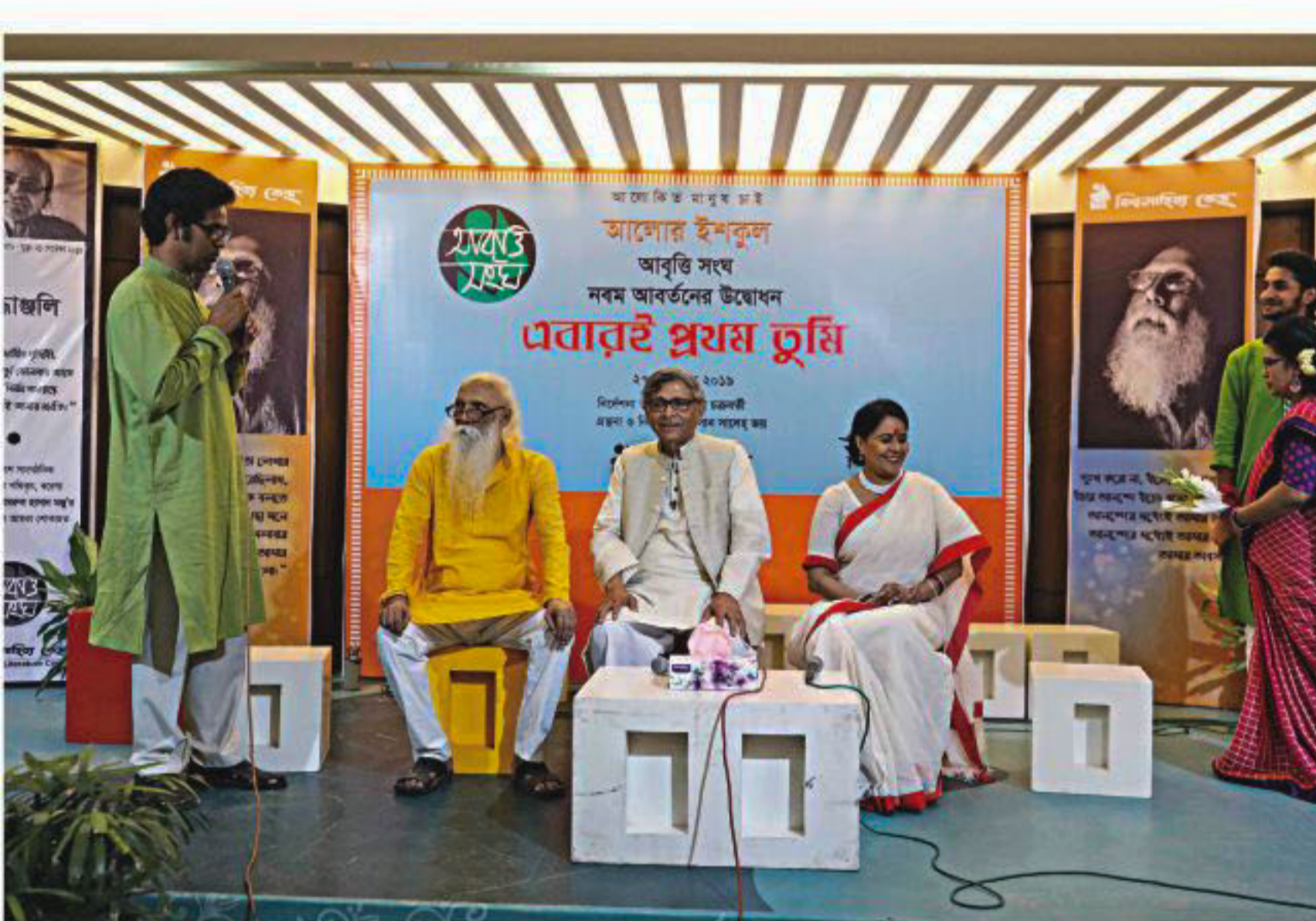
The honourable guests at the event.