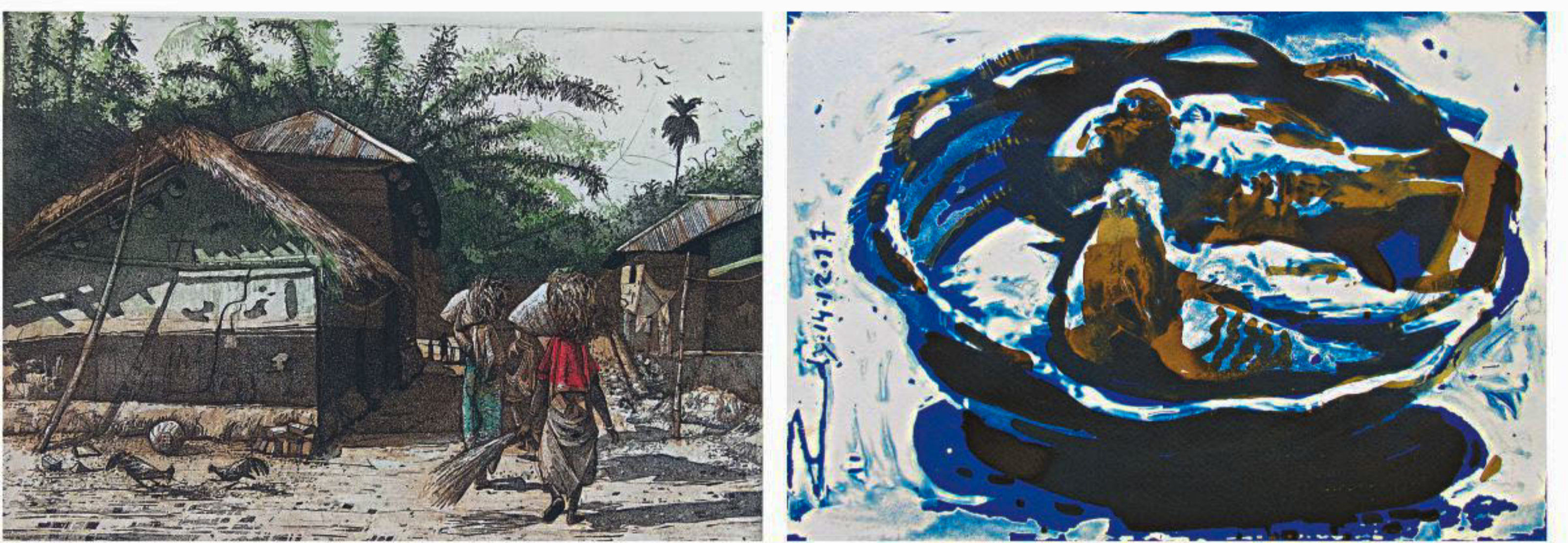
'Santal Life' (Etching and aquatint)