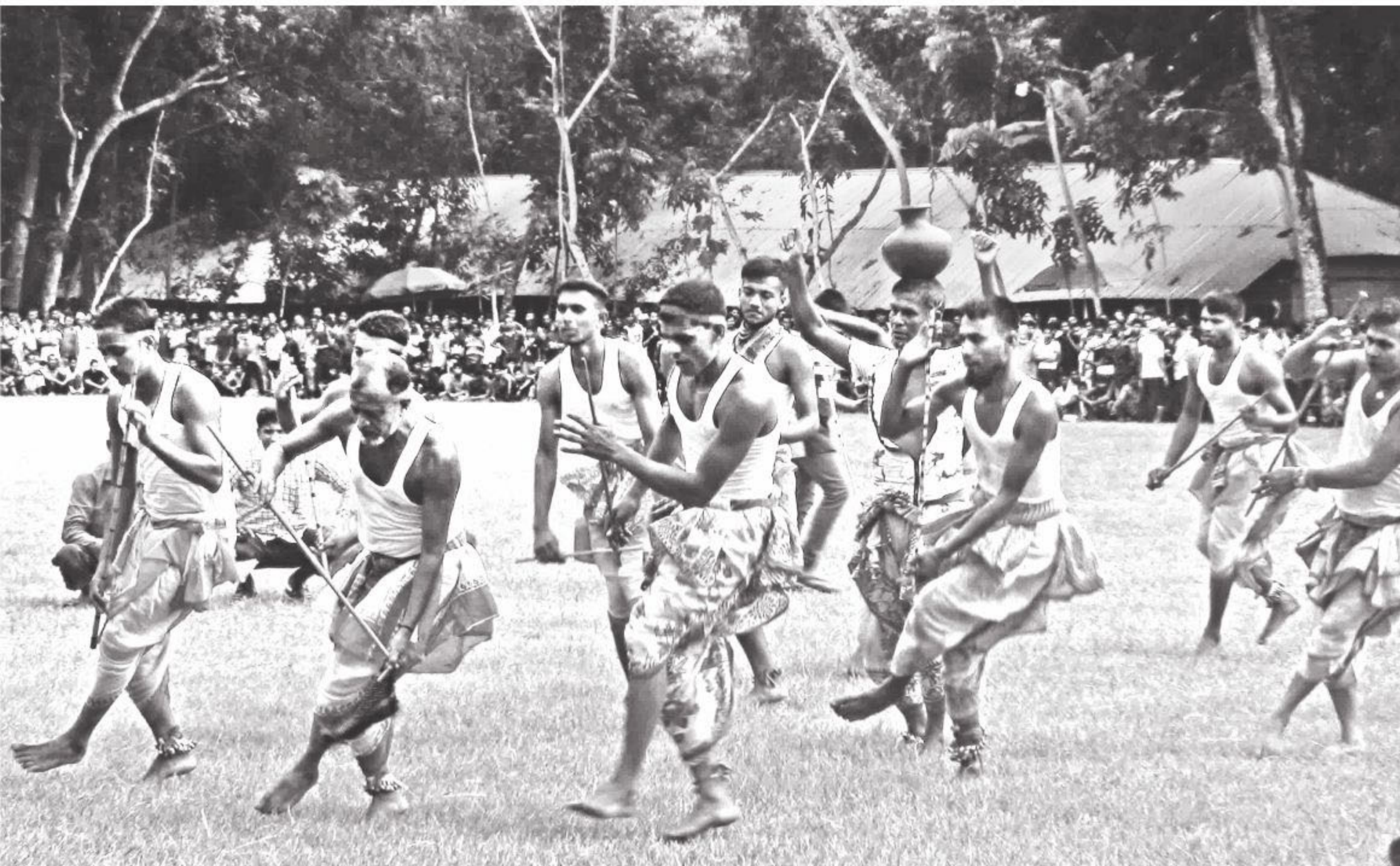
Hundreds of people from different areas thronged Matibhanga College premises in Pirojpur's Nazirpur upazila on Friday to enjoy a traditional lathi khela festival, organised by local Udayan Club.