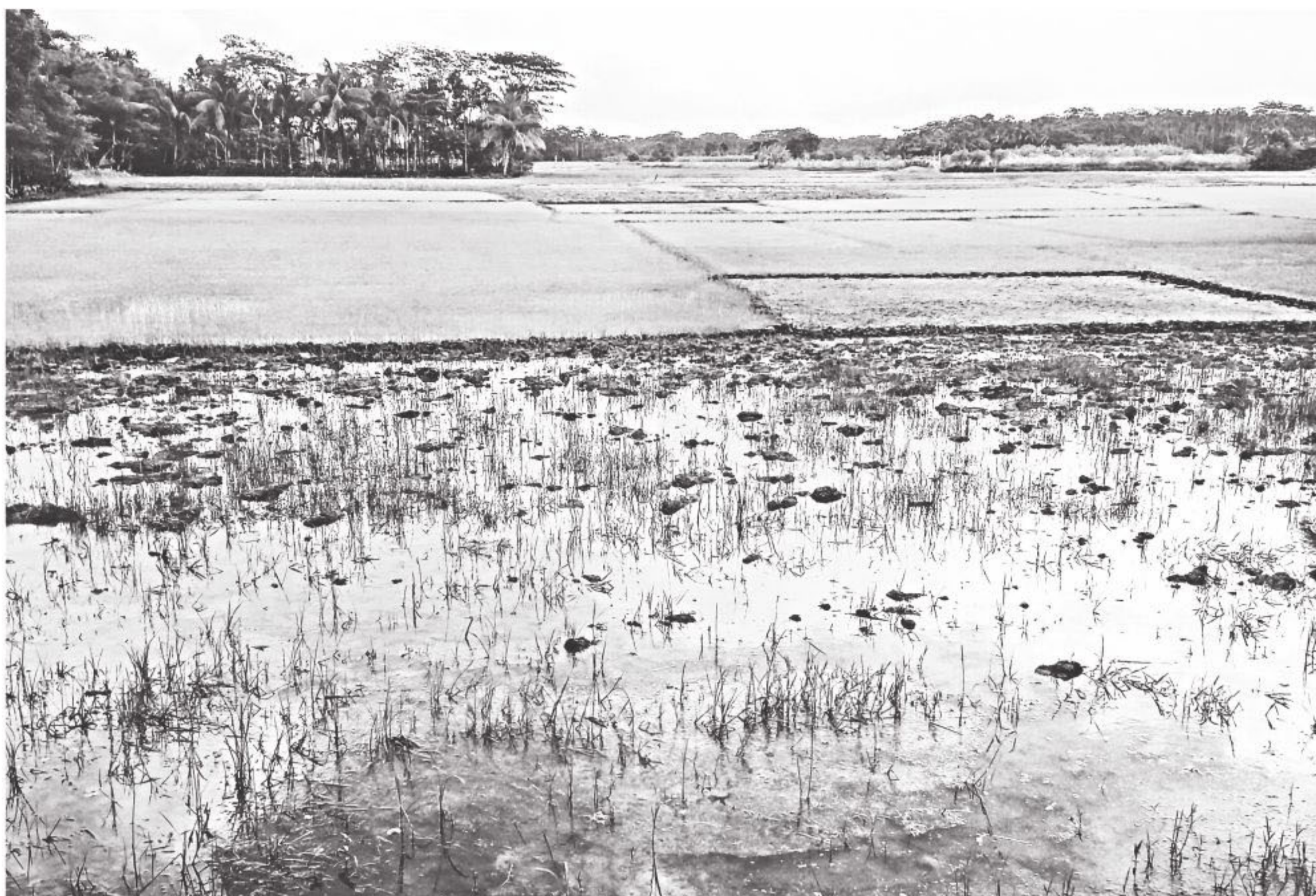
This recent photo taken from a field at Malipatan village in Bagerhat's Kachua upazila shows paddy saplings affected by salinity.