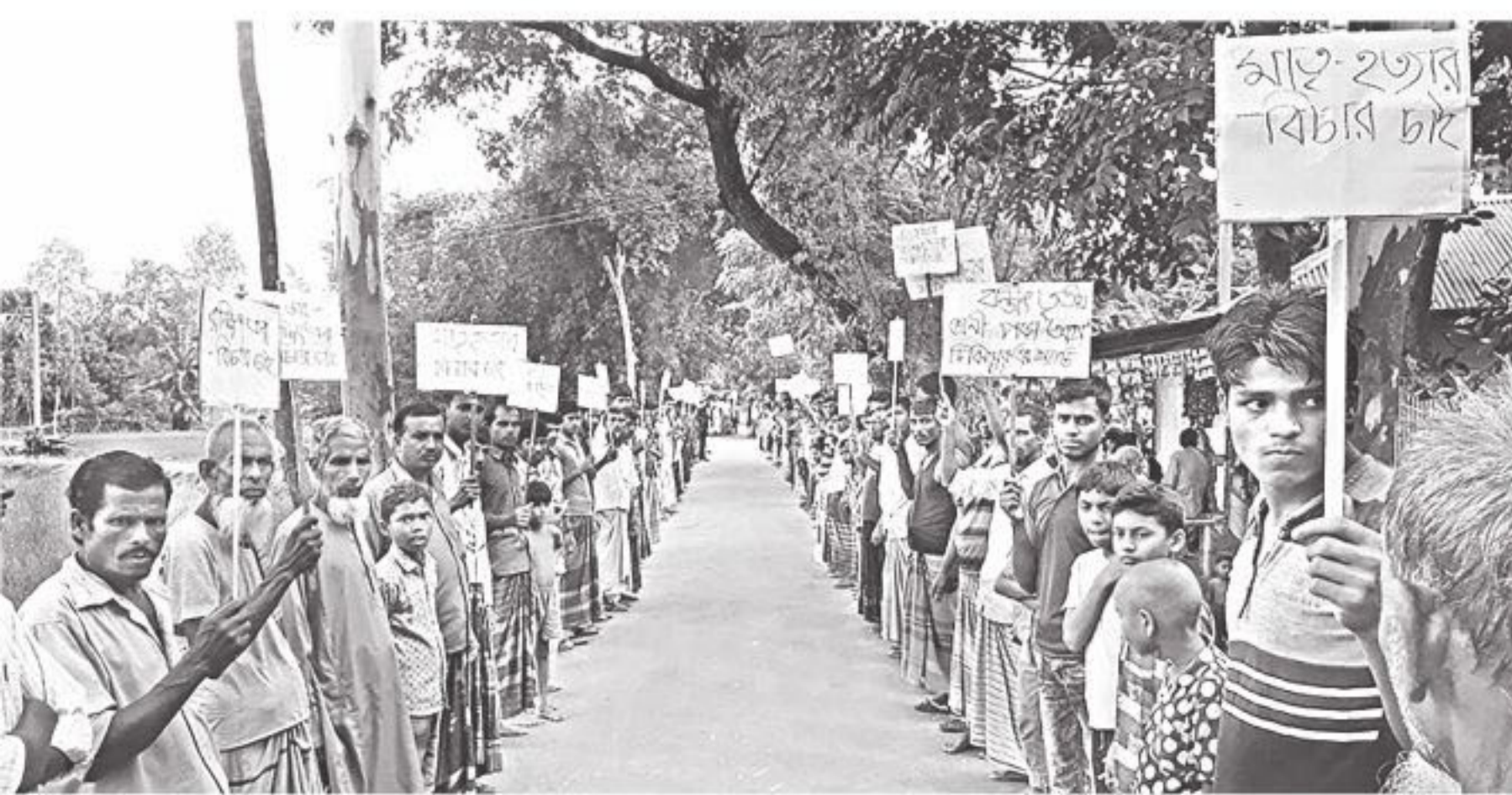
Locals form a human chain at Kherkathi Bazar in Nilphamari's Domar upazila yesterday protesting death of a woman allegedly due to wrong treatment.