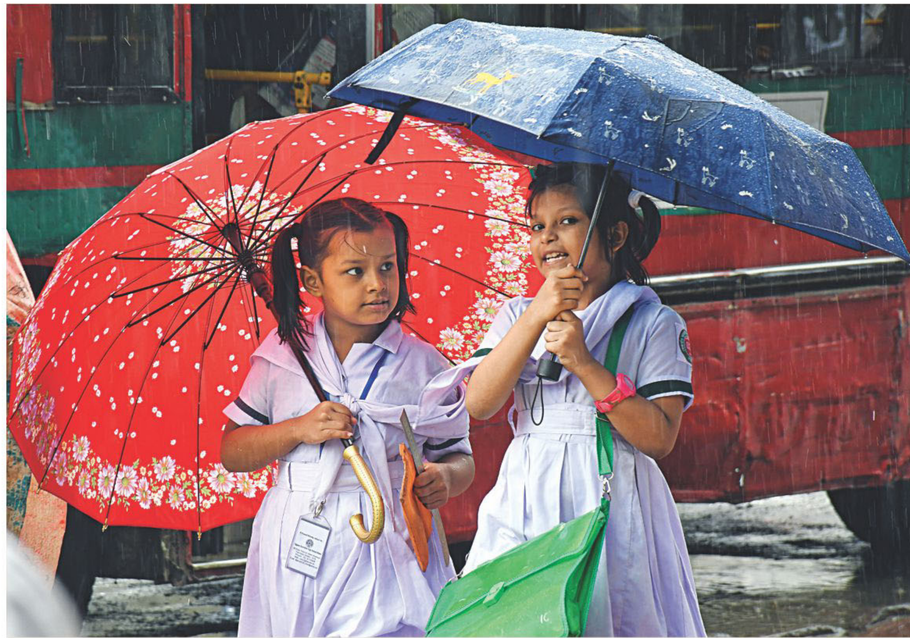
SHINING THROUGH THE RAIN...Two school girls chatting as they head home in the rain yesterday at the capital's Farmgate. There were intermittent rain and drizzle since midday and the weather forecast for today is similar.