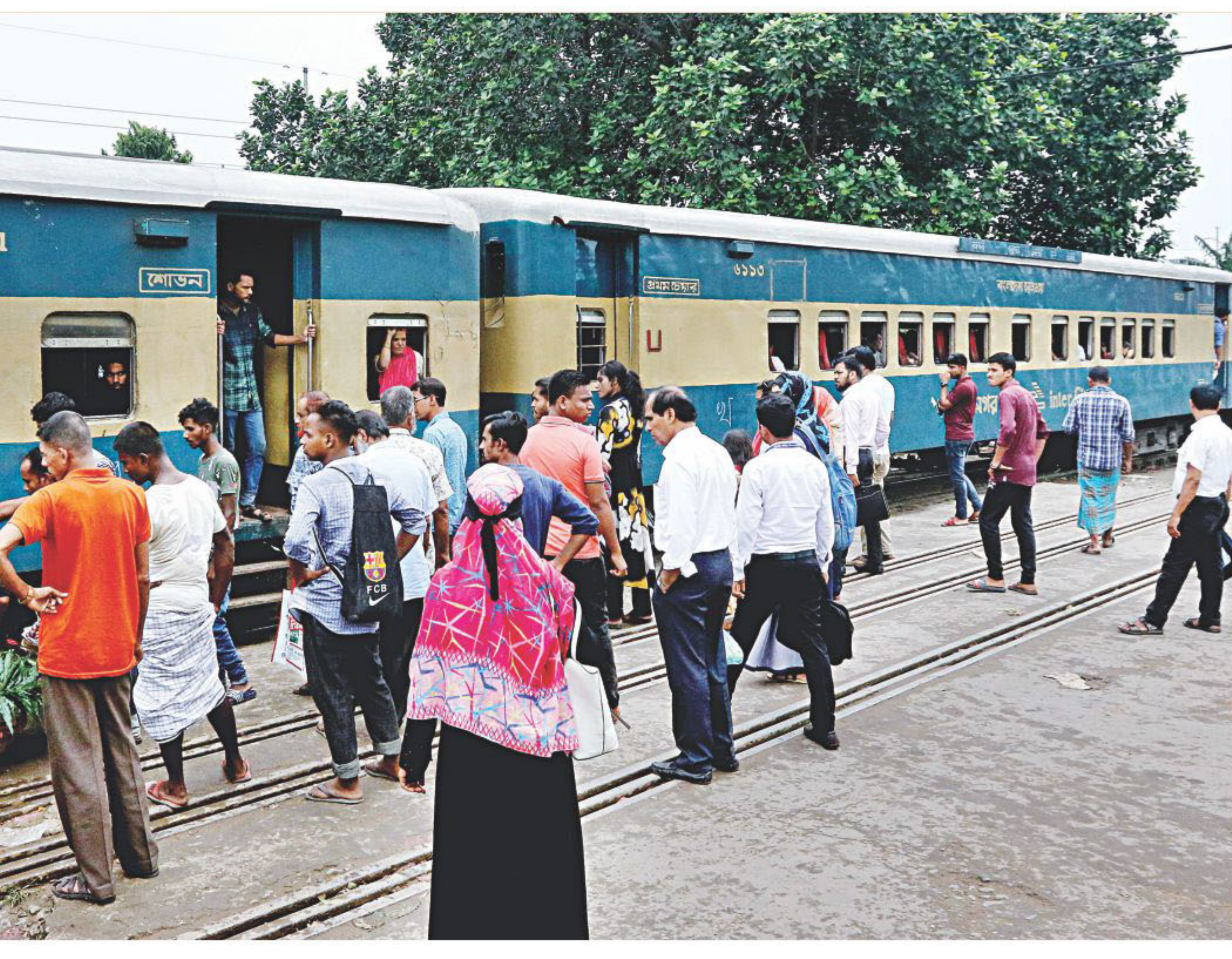
People wait for a train to go past, standing on rail lines at the level crossing near Airport Railway Station in the capital yesterday. They ignored the closed gate, the ringing bells and the flashing red lights to put themselves in harm's way.