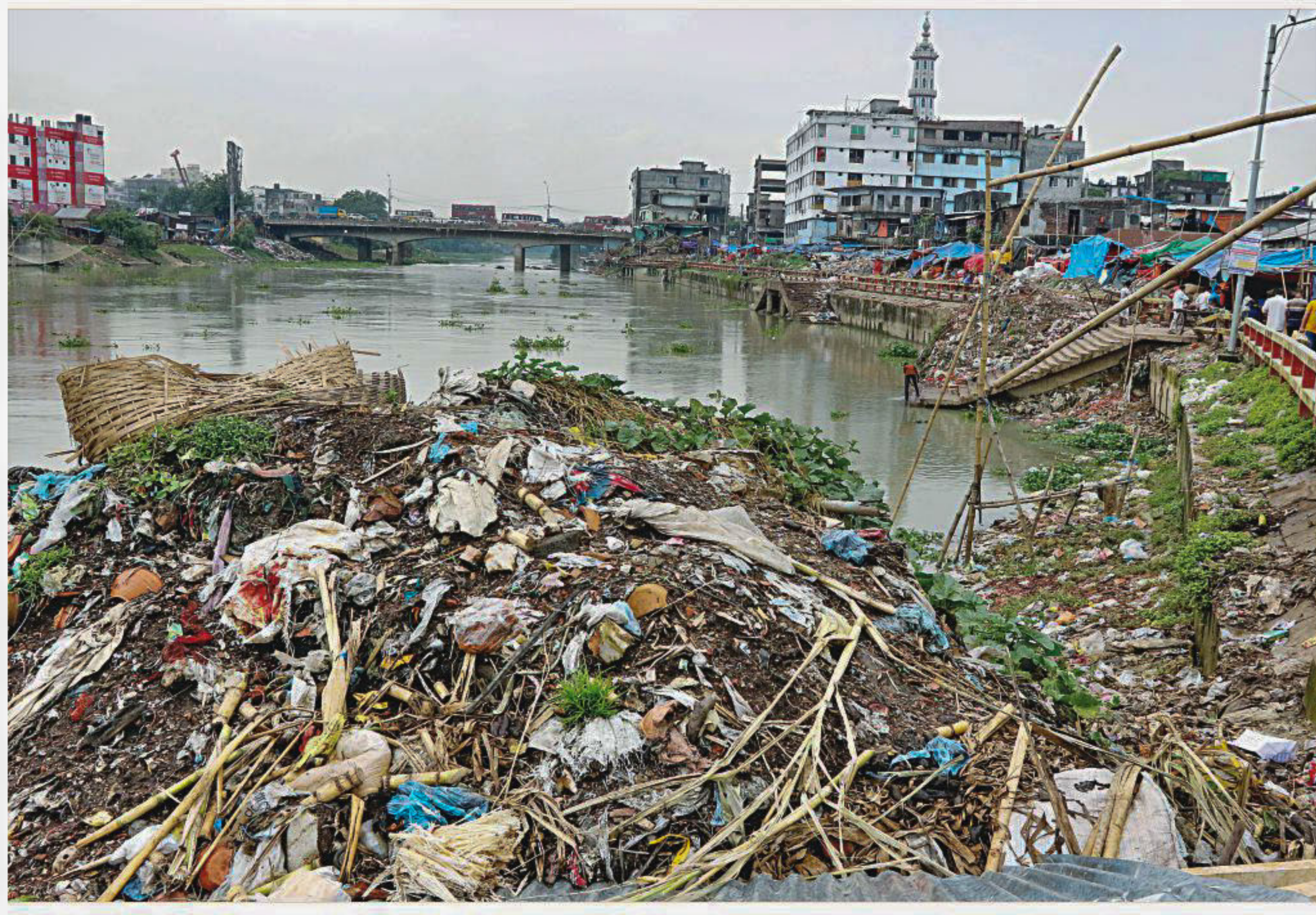
Piles of garbage on the Turag are polluting the water and narrowing the river near Abdullahpur bridge in Tongi. The photo was taken yesterday.