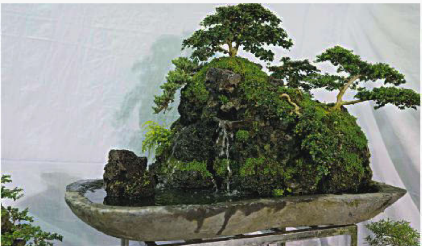
Rizwan Samad's 'Mountain Landscape'