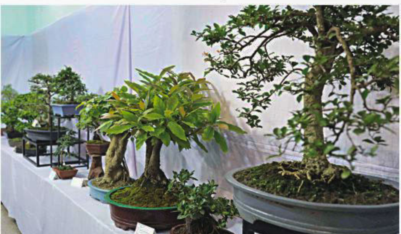
Informal upright bonsais on display at the event.