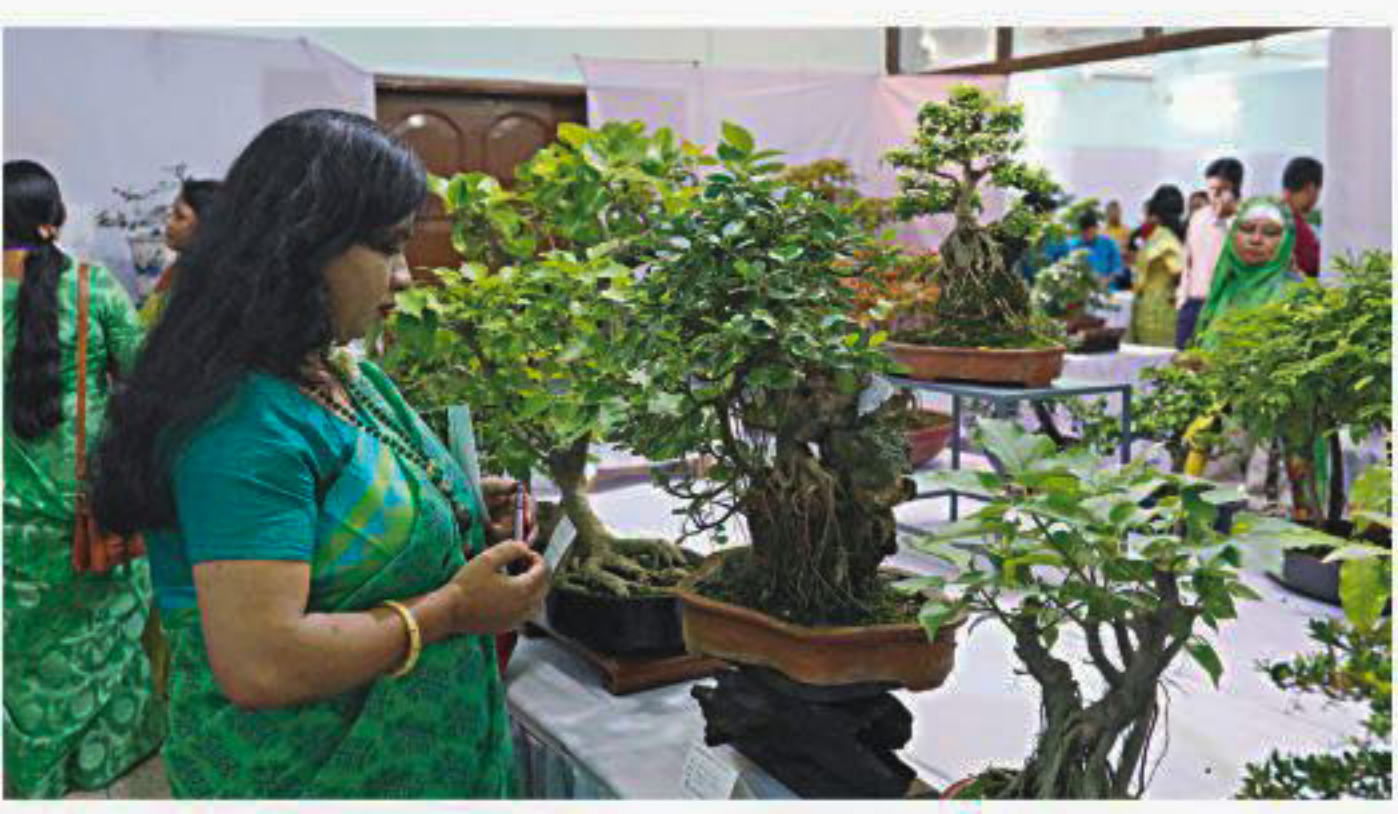
A visitor looks at a root-on-rock bonsai at the exhibition.