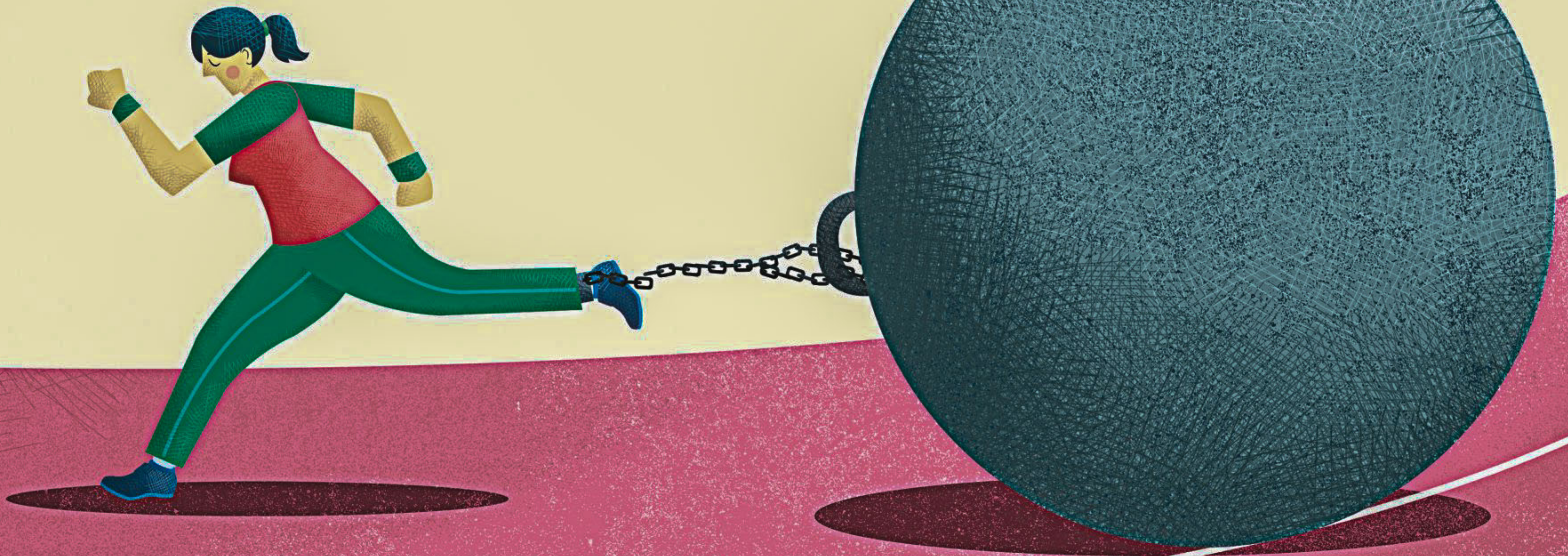
ILLUSTRATION: NOOR US SAFA ANIK