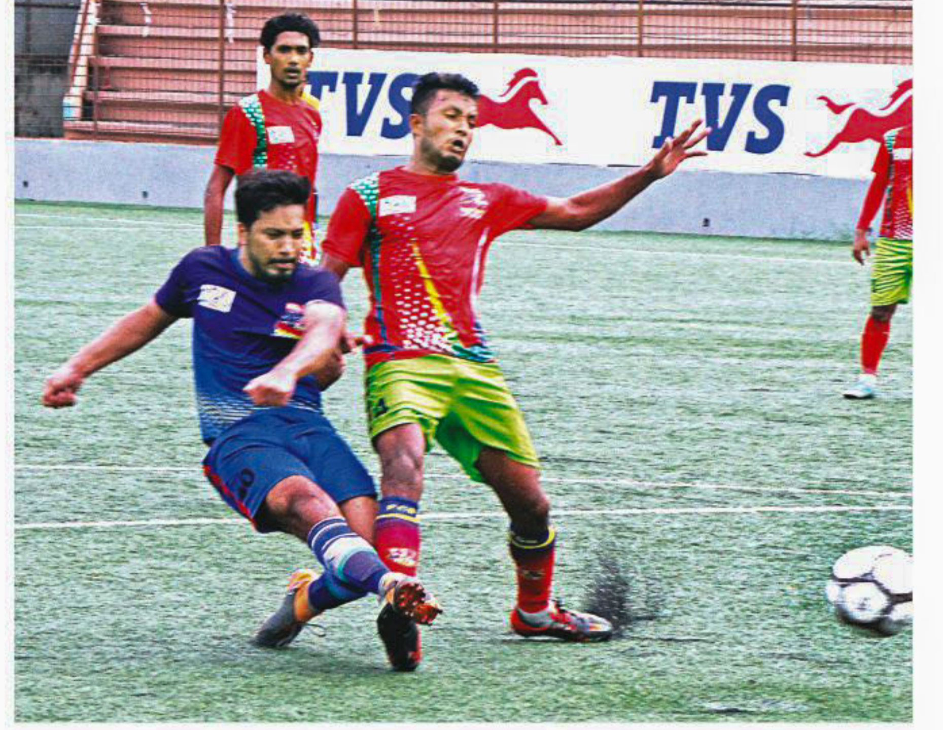
Independent University Bangladesh secured a 2-0 win over Shanto-Mariam University in their Faraaz Intervarsity Gold Cup encounter at the Bir Shrestha Shaheed Mustafa Kamal Stadium in Kamalapur yesterday.

will be a change," the sports daily quoted Hoeness as saying. "Before that happens we would prevent any of our players turning out for the national side." Along with Neuer, Bayern contributes several key players to the national squad with any boycott would deprive Low of defender Niklas Sule, midfielders Joshua Kimmich and Leon Goretzka as well as attacker Serge Gnabry. Low had promised to give Ter Stegen more playing time in 2019 but so far he has made just one appearance for Germany, a 45-minute cameo in a friendly against Serbia last March. Under FIFA rules, Bayern could face sanctions running from fines to exclusion from competitions for depriving the national team of players.