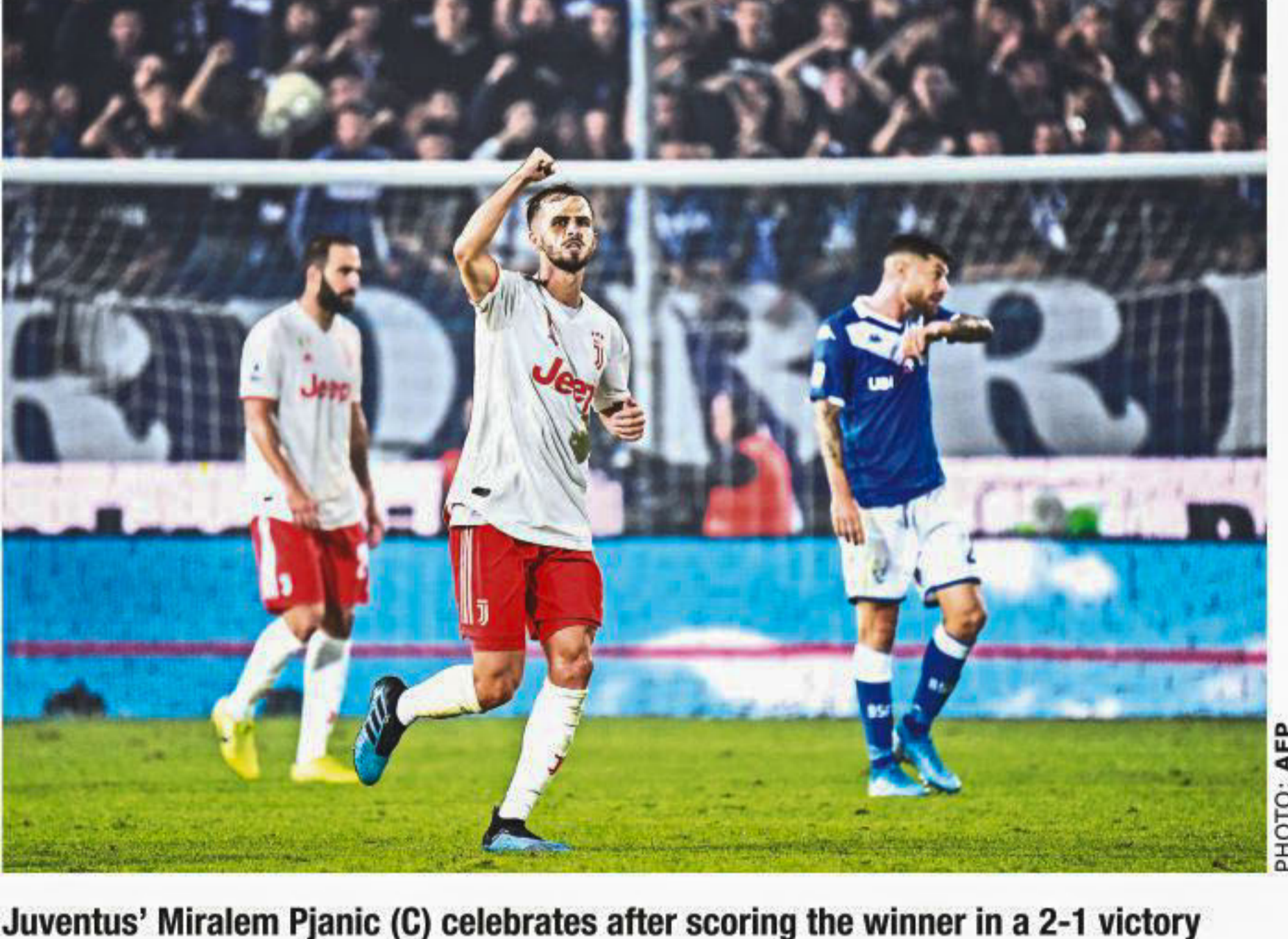
Juventus' Miralem Pjanic (C) celebrates after scoring the winner in a 2-1 victory over Brescia in a Serie A encounter at the Stadio Mario Rigamonti on Tuesday.

Certainly, Barcelona would have been eager to see Messi in the line-up, having suffered a humbling 2-0 loss at newly-promoted Granada on Saturday, a result that left them with seven points from five games, their worst start to a season since 1995. They arrived at Camp Nou with doubts hovering, particularly over Valverde, but delivered a far more convincing win than the scoreline suggested, thanks to early goals from Antoine Griezmann, his third of the season, and Arthur Melo. Santi Cazorla put Villarreal in touch on the stroke of half-time but in truth the visitors barely threatened thereafter, with Barcelona impressively composed when nerves might easily have taken over. It means Valverde's side climb to fourth in the table, one point behind Real Madrid and level on points with Atletico Madrid, who both play on Wednesday. Villarreal's encouraging start stalls a little as they drop to eighth. Barcelona started well, with Griezmann heading in after just six minutes, darting to the near post to flick home Messi's floated corner. Seven minutes later, there was a second and another goal almost from nothing. Arthur collected the ball 30 yards out and harpooned a shot straight past Sergio Asenjo and into the top right-hand corner. Messi took treatment on the sideline just after the half-hour mark and Cazorla pulled one back soon after with a swerving effort from distance.