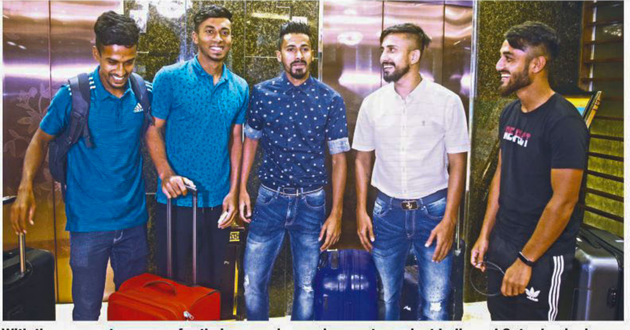
With the preparatory camp for their upcoming assignments against India and Qatar beginning today, the Bangladesh football team reported to the team manager at a city hotel yesterday.