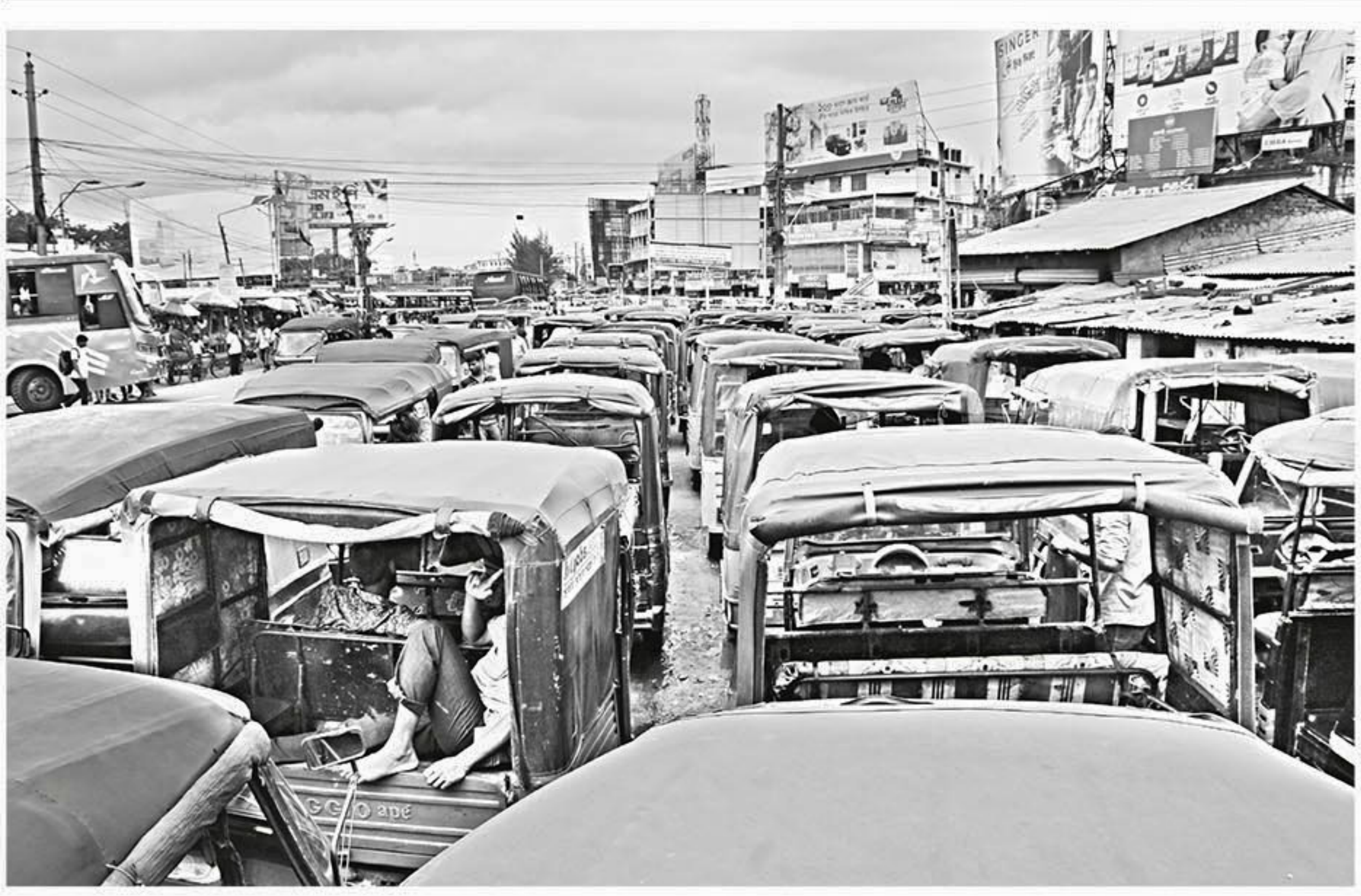
Vehicles parked in rows on this road beside Nathullahbad bus terminal in Barishal city continue to choke an already busy thoroughfare. The photo was taken on Monday.