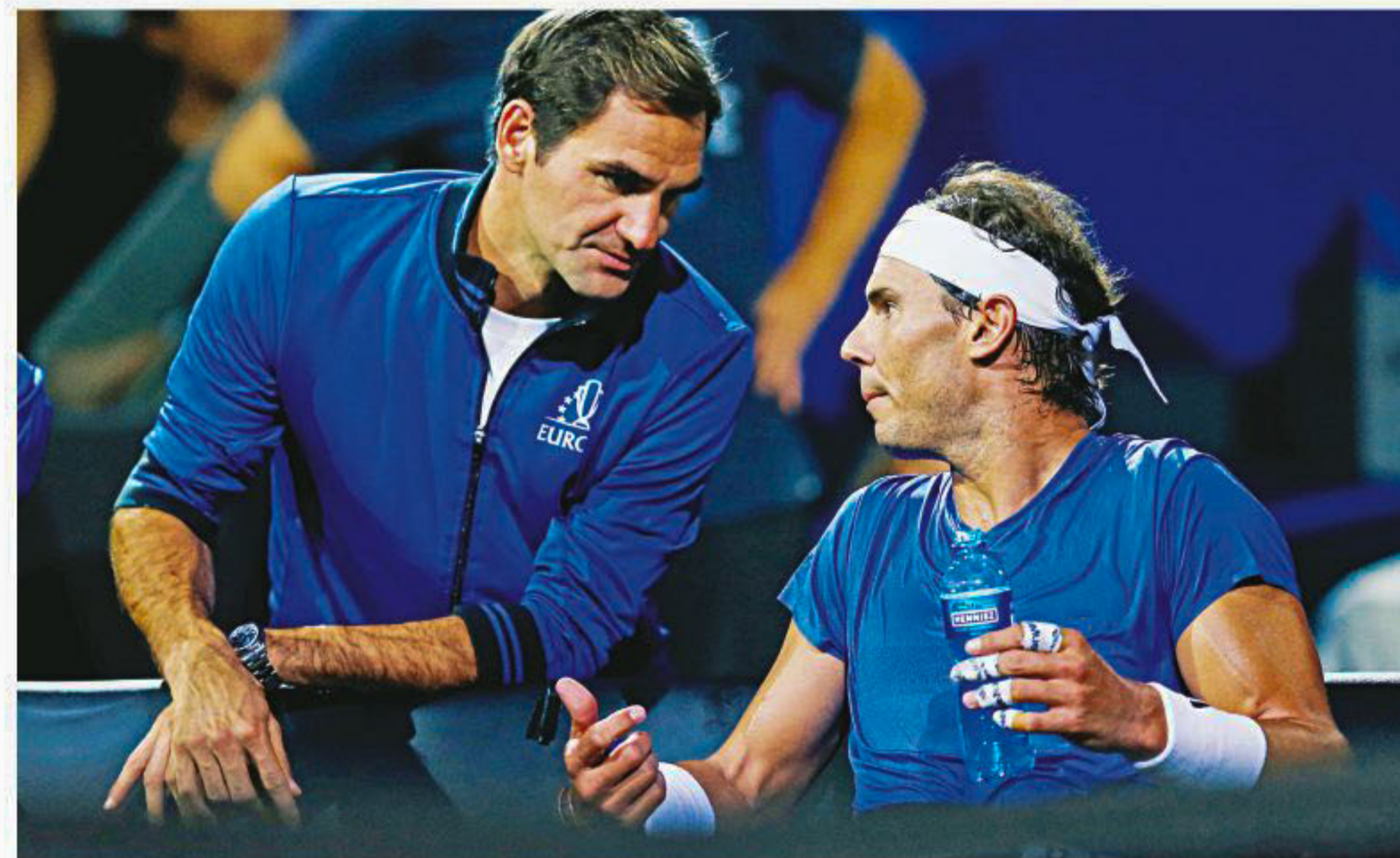
After saying Rafael Nadal's (R) coaching had saved him against Nick Kyrgios, Roger Federer returns the favour in the Spaniard's game against Milos Raonic at the Laver Cup on Sunday.

He said: "When you see a chance to come to