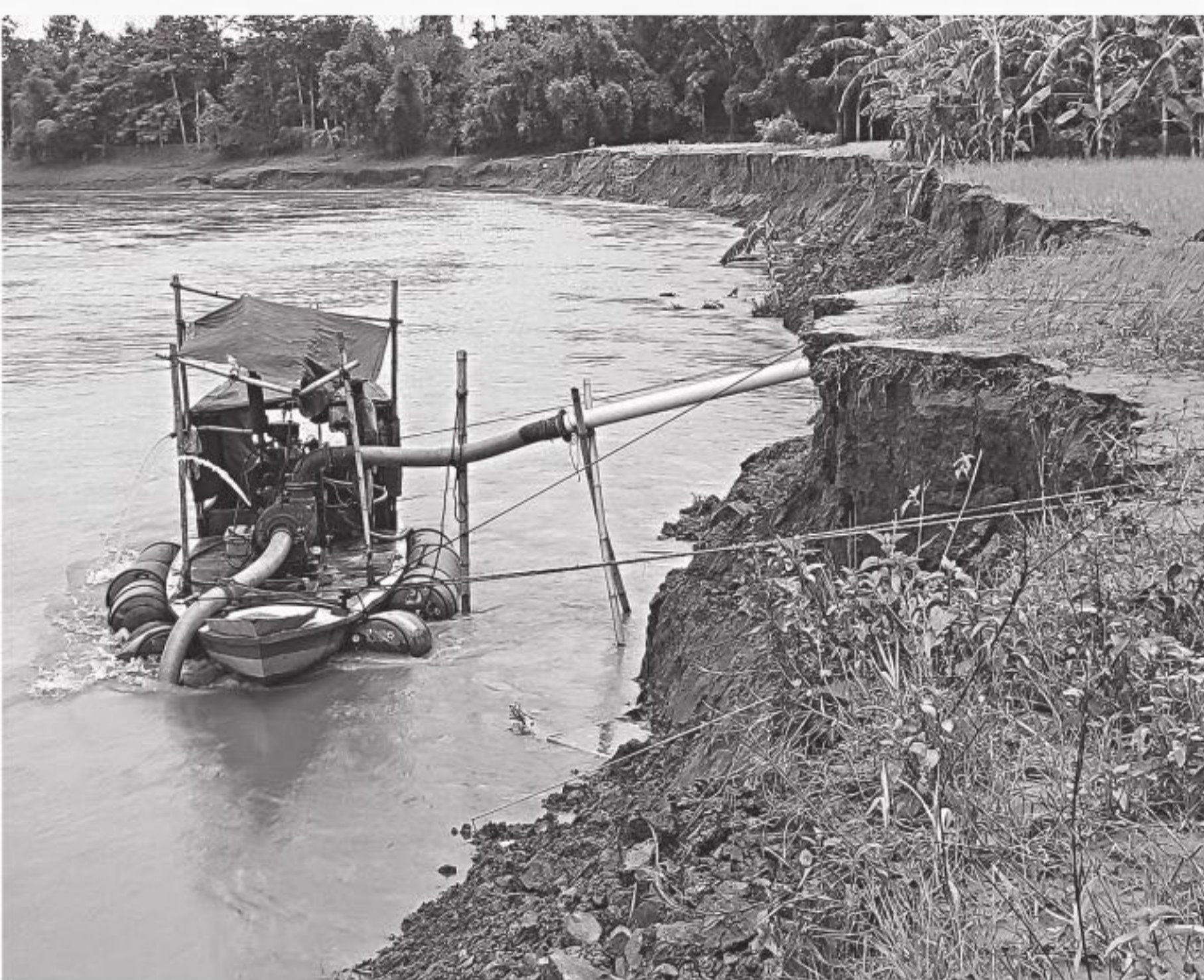
Illegal sand lifting with dredgers from the Monu river triggers erosion, threatening agricultural lands and dwellings in Prithimpasha union under Kulaura upazila of Moulvibazar.