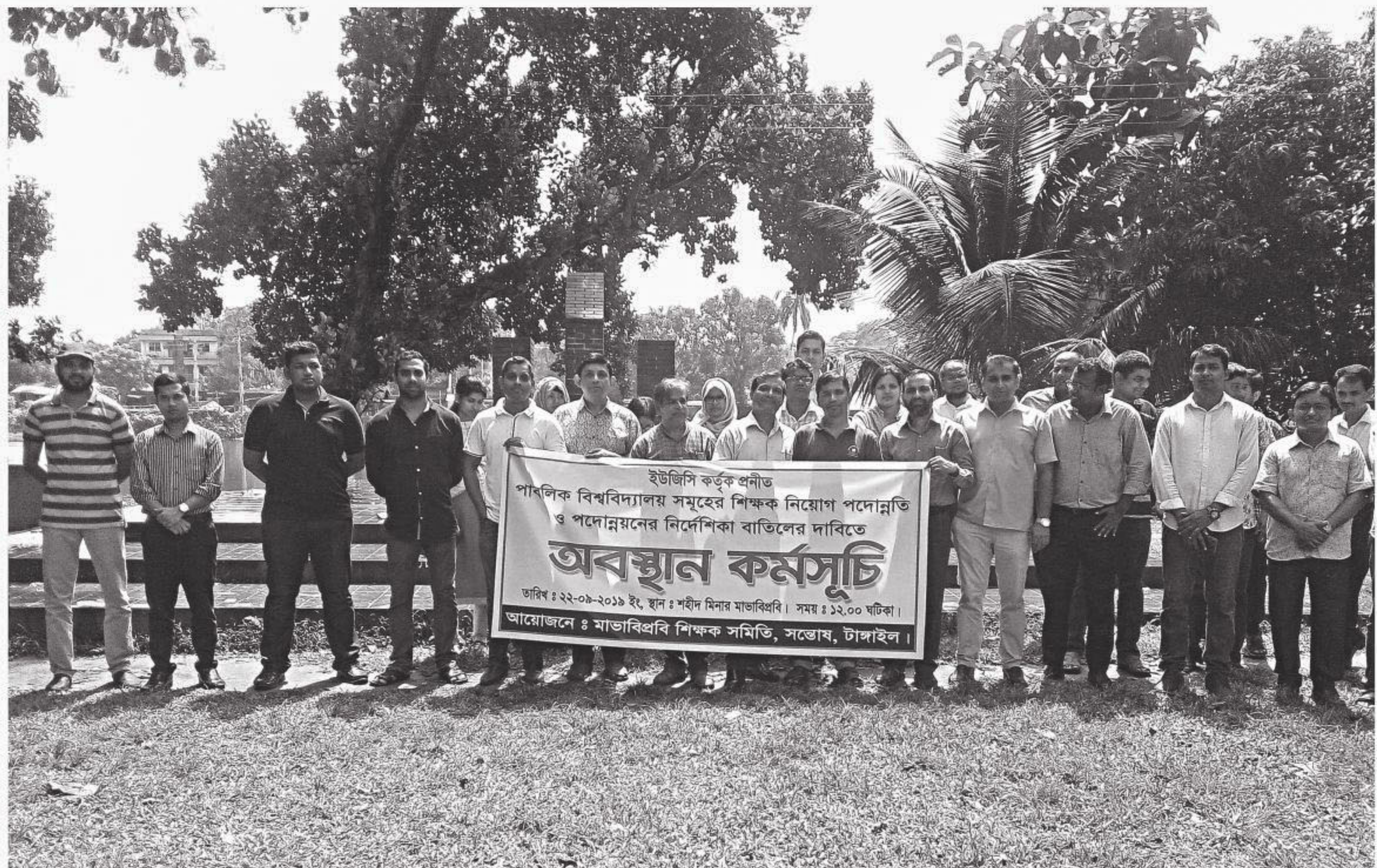
Mawlana Bhashani Science and Technology University Teachers Association forms a human chain on the campus at Santosh in Tangail yesterday demanding revocation of the University Grants Commission's direction about the appointment and promotion of teachers at public universities.