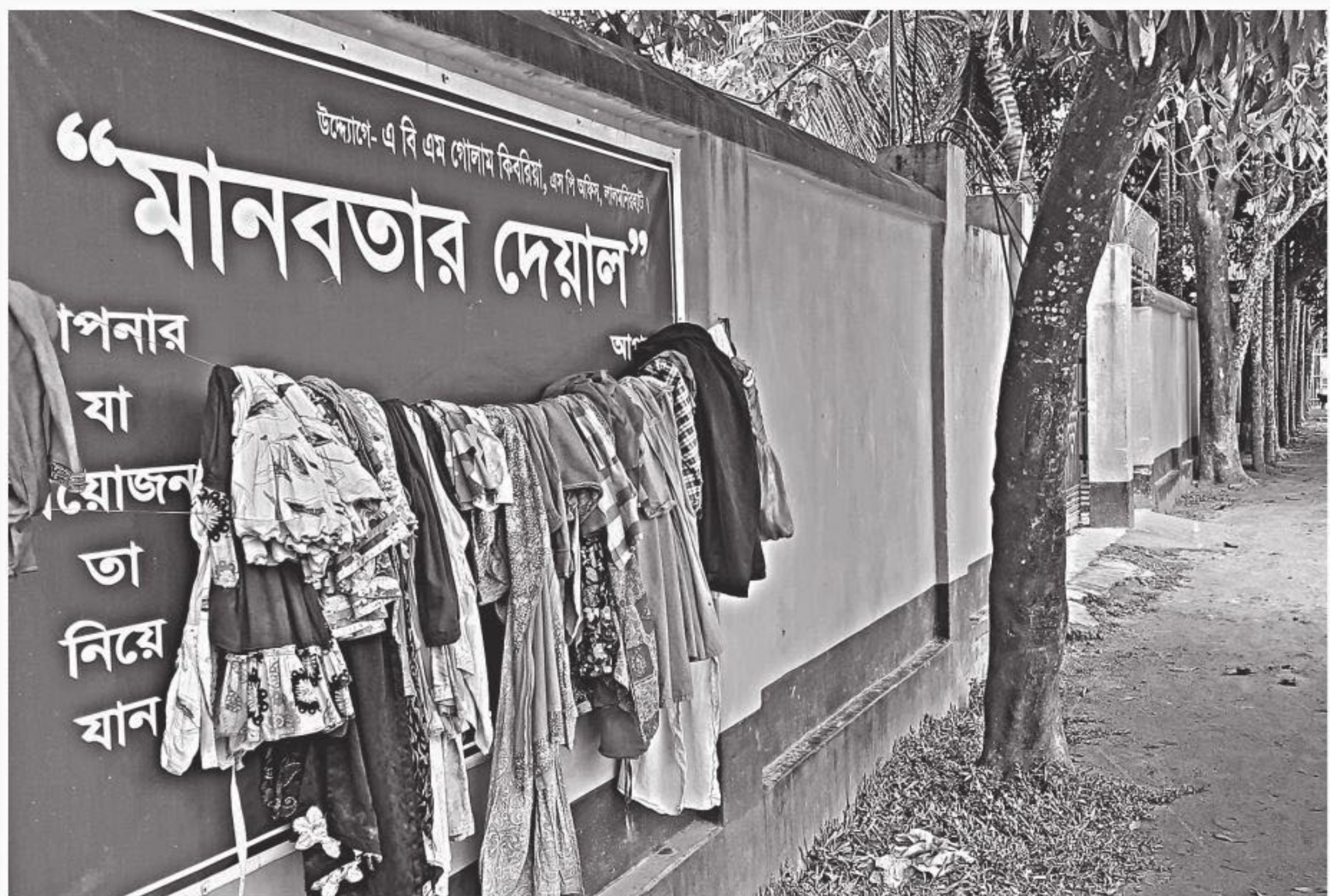
People keep old clothes on the ropes set at the 'Wall for humanity' beside the Collectorate playground at Khordosaptana in Lalmonirhat town, allowing needy people to take the items as per requirement. A local resident took the initiative three months ago.