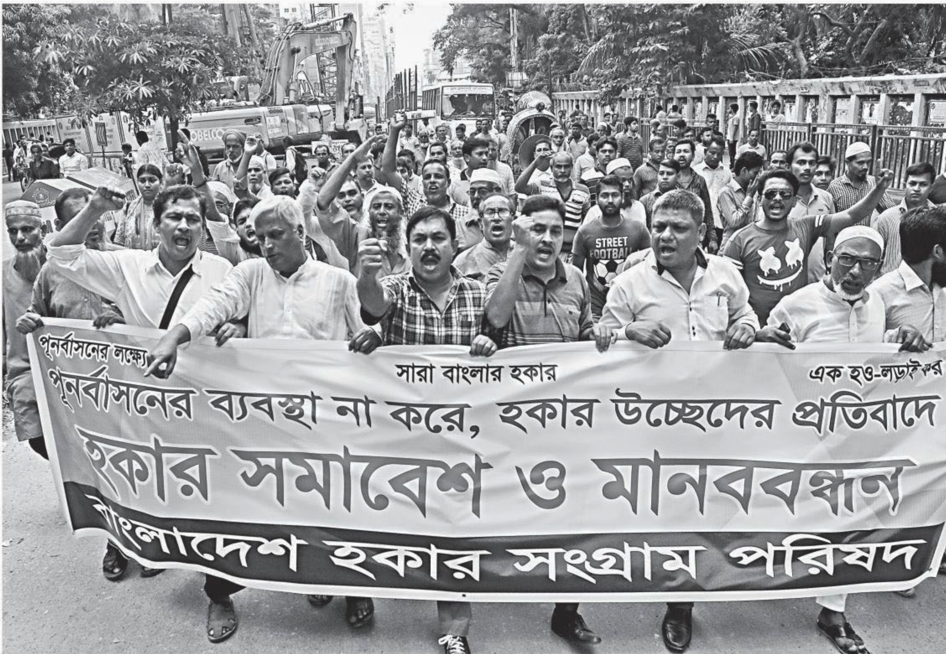
With the demand "rehabilitation before eviction", Bangladesh Hawker Sangram Parishad brought out a procession in the capital's Jatiya Press Club area yesterday.

Calculators, mobile phones and electronic devices are prohibited in the examination halls.