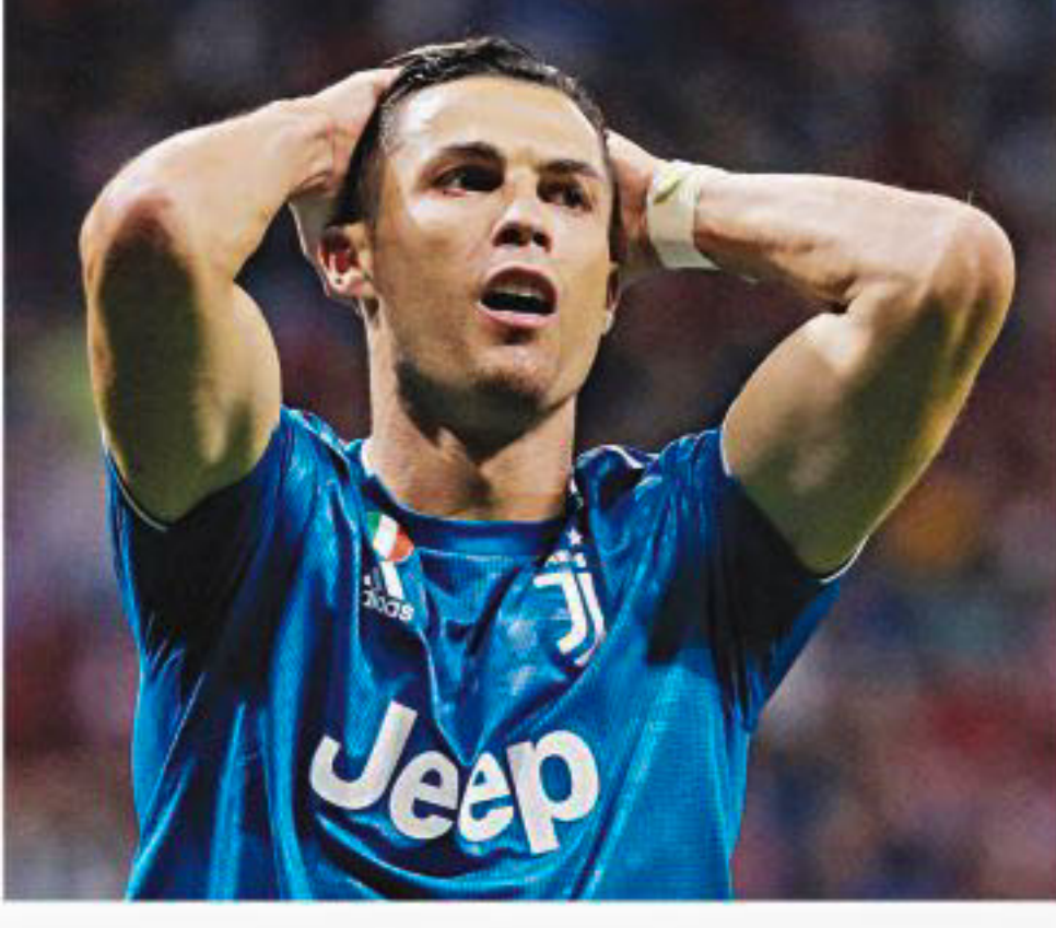
Juventus forward Cristiano Ronaldo (L) rued his missed opportunities while Atletico Madrid midfielder Hector Herrera capitalised on his as the sides drew level in Madrid yesterday.