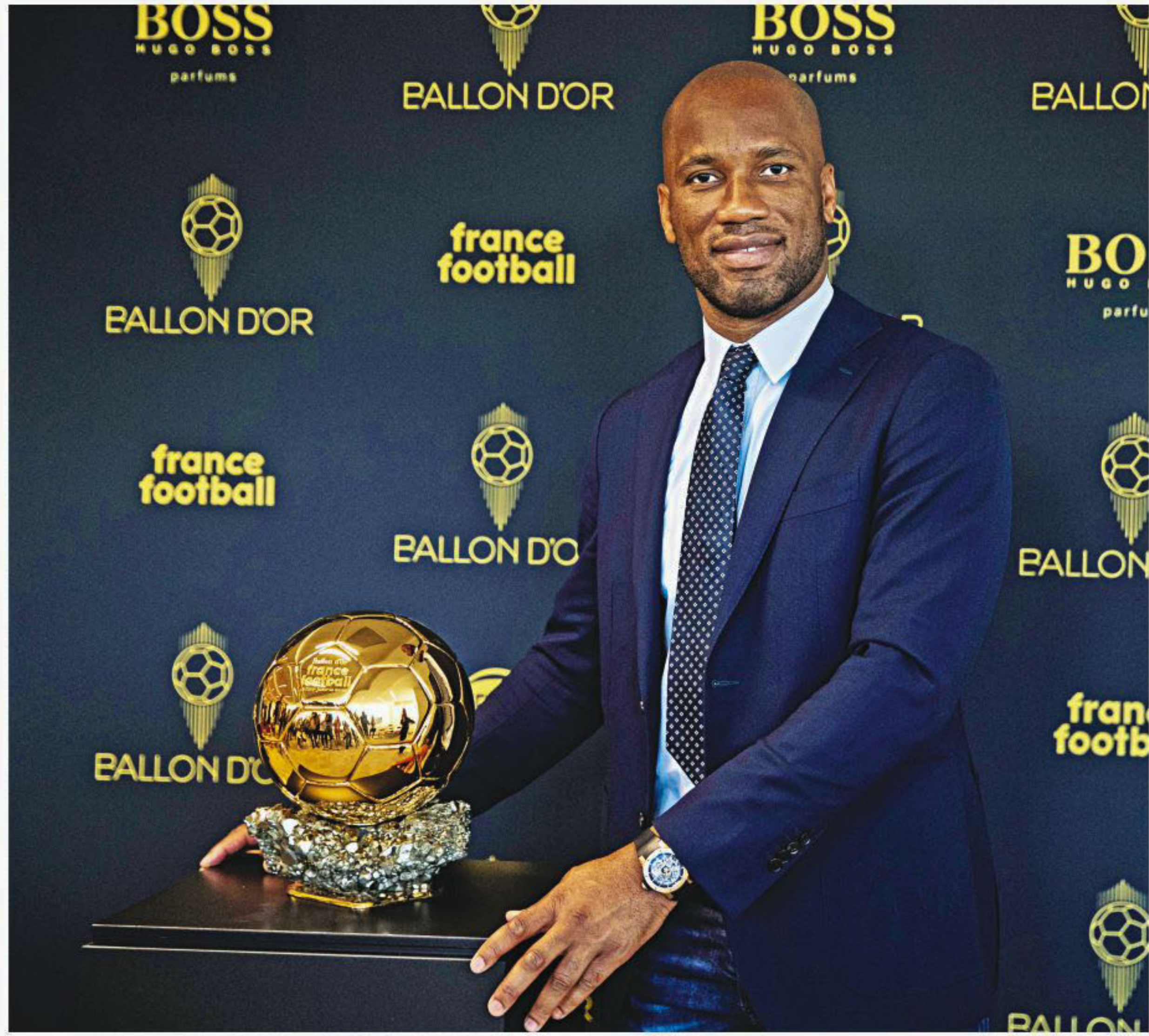
Former Ivory Coast and Chelsea forward Didier Drogba, ambassador for the 2019 edition of the Ballon d'Or, poses with the trophy during the new Ballon d'Or trophy presentation press conference in Paris yesterday.

The 25-year-old was assessed after the legality of his bowling action came under question by match officials in the first Test against New Zealand in Galle from August 14-18.