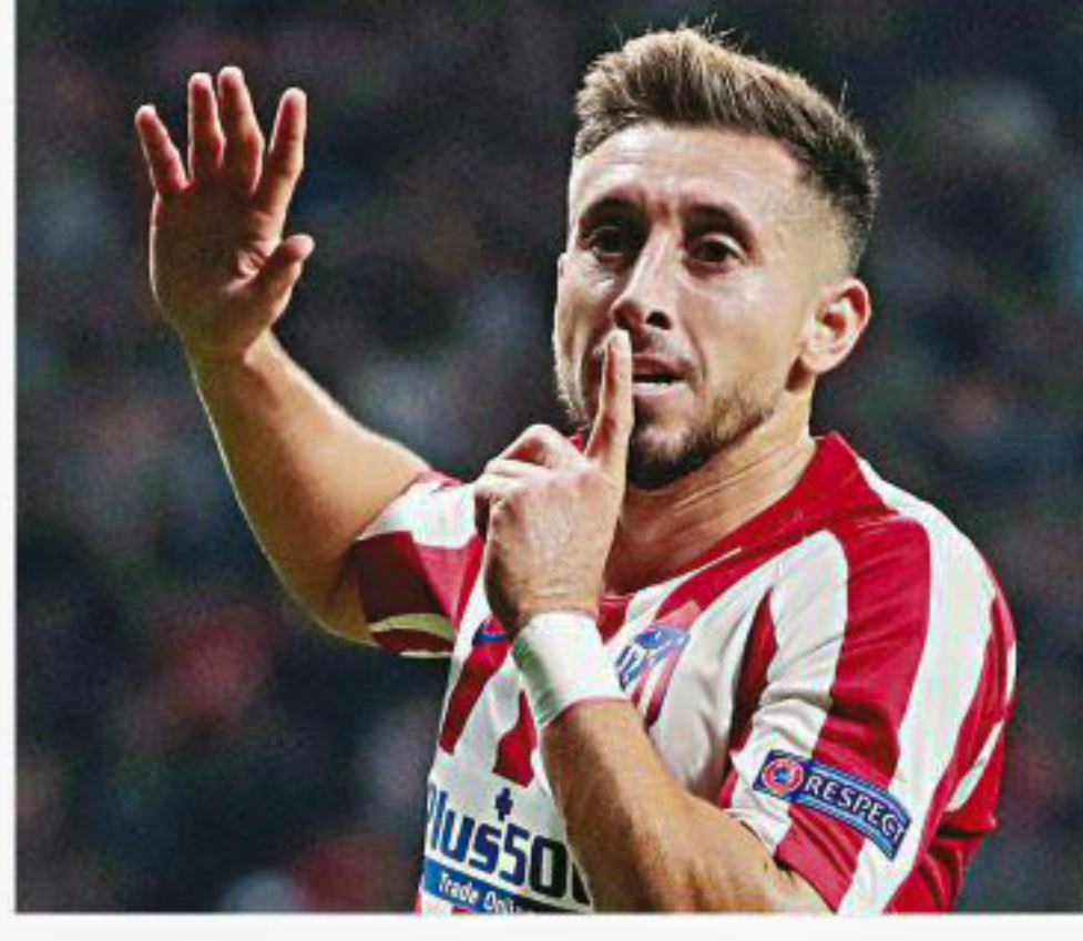
Atletico Madrid midfielder Hector Herrera capitalised on his as the sides drew level in Madrid yesterday.

With Neymar suspended and Kylian Mbappe and Edinson Cavani sidelined by injury, Angel Di Maria stepped up in their absence by grabbing two first-half goals in a 3-0 triumph at the Parc des Princes.