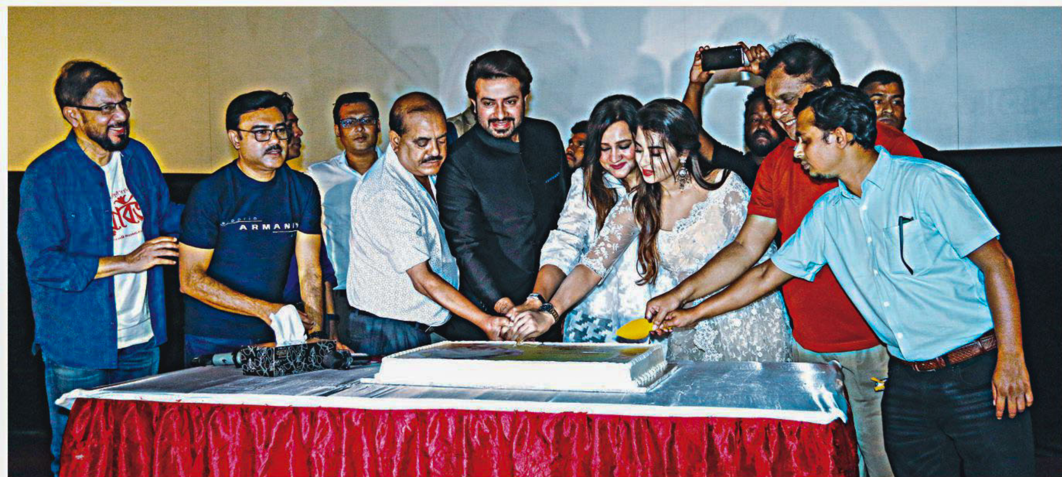
Guests cutting a cake to honour Salman Shah's birth anniversary.