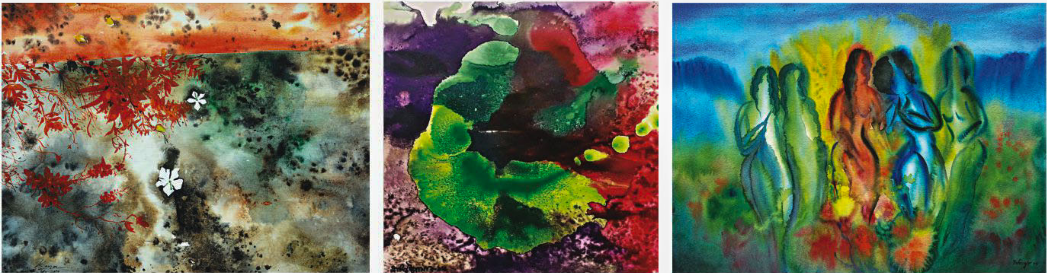
Paintings at the exhibition