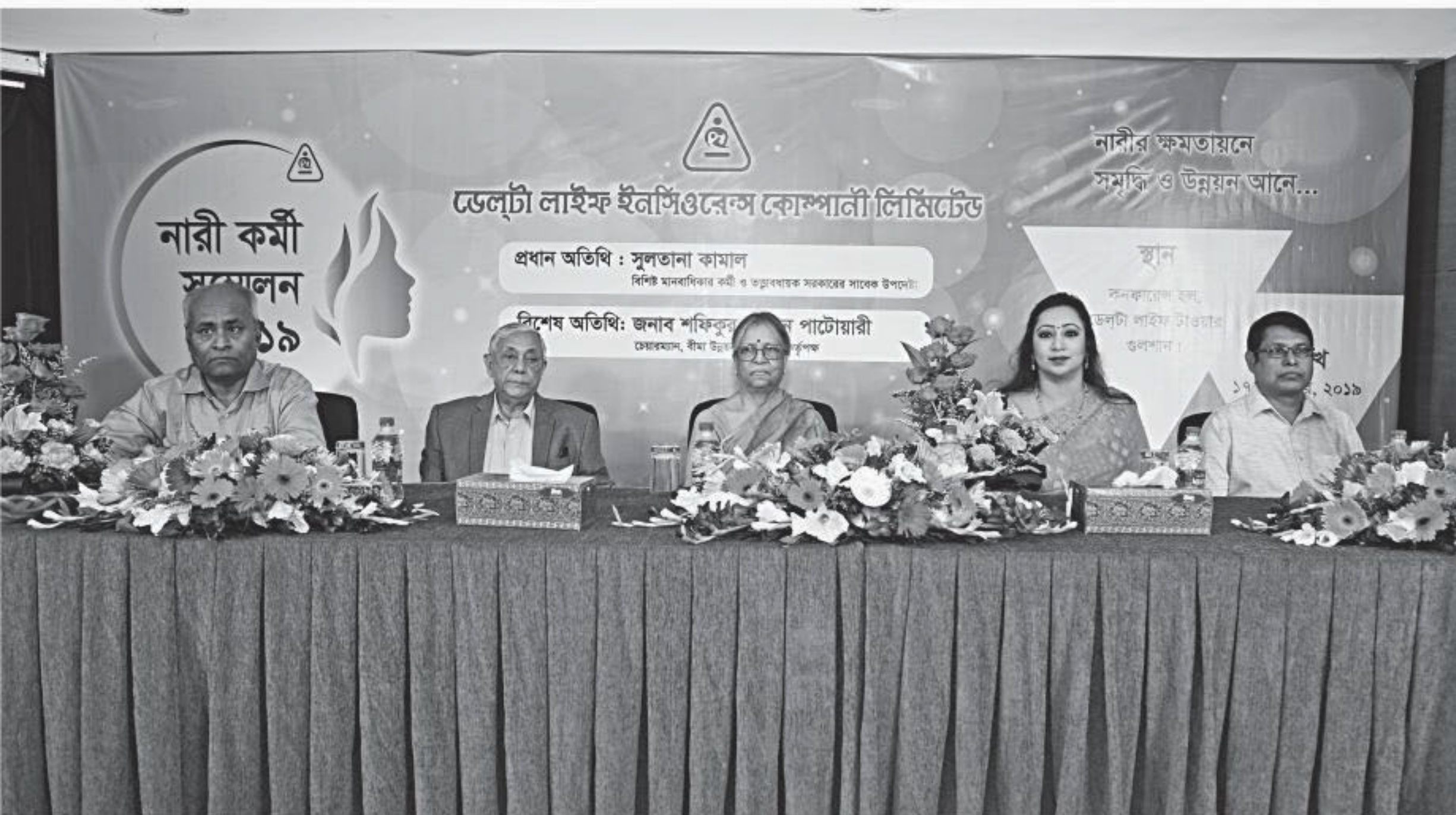
Delta Life Insurance Ltd honoured its women agents at its annual "Women Agent Summit-2019", held at Delta Life Tower in Dhaka yesterday. Agents were recognised for their outstanding contributions to promoting micro-insurance among low-income people across the country.