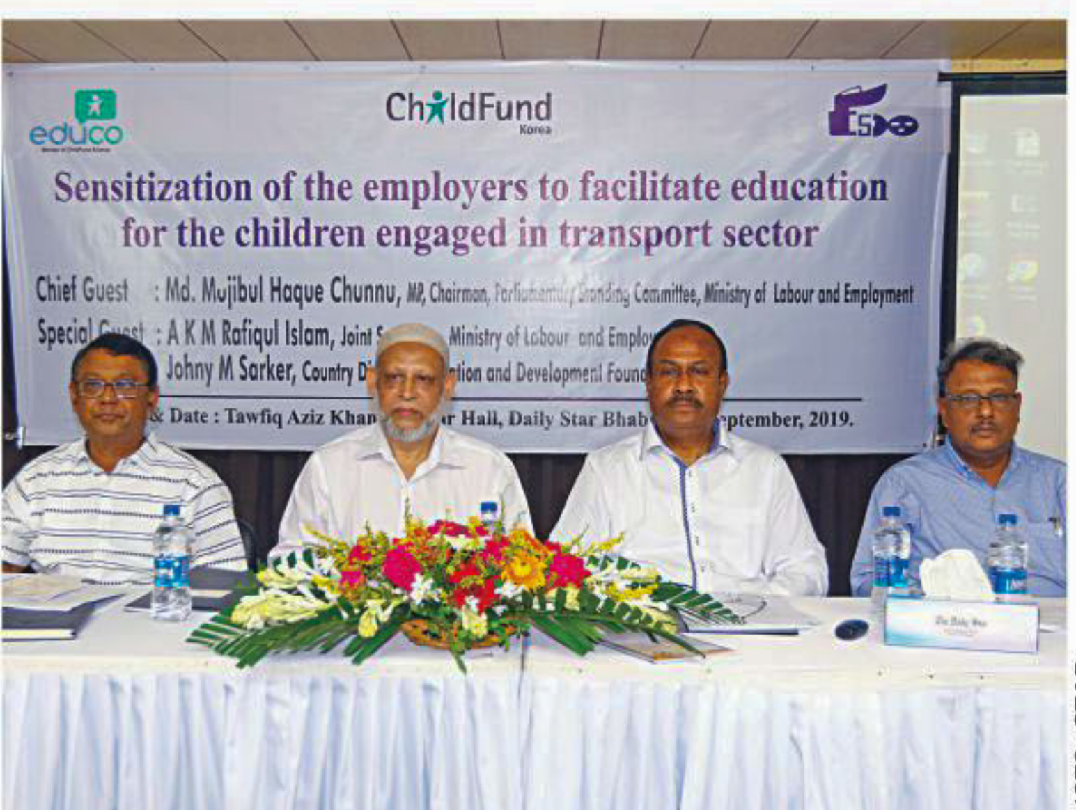
Speakers during the discussion at The Daily Star Centre yesterday.