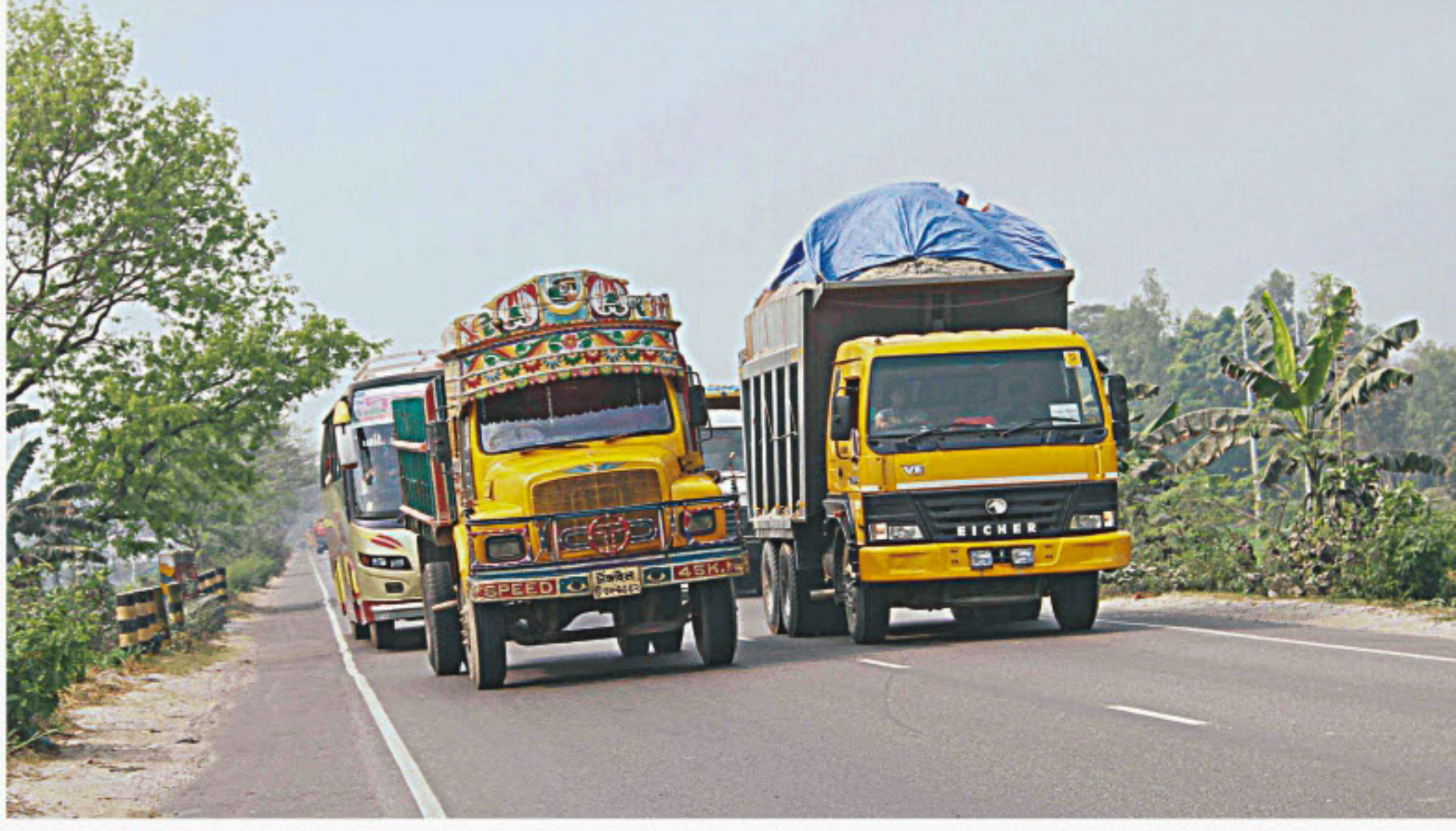
Some 32 units of trucks were sold each day this year, down from 43 in 2018.