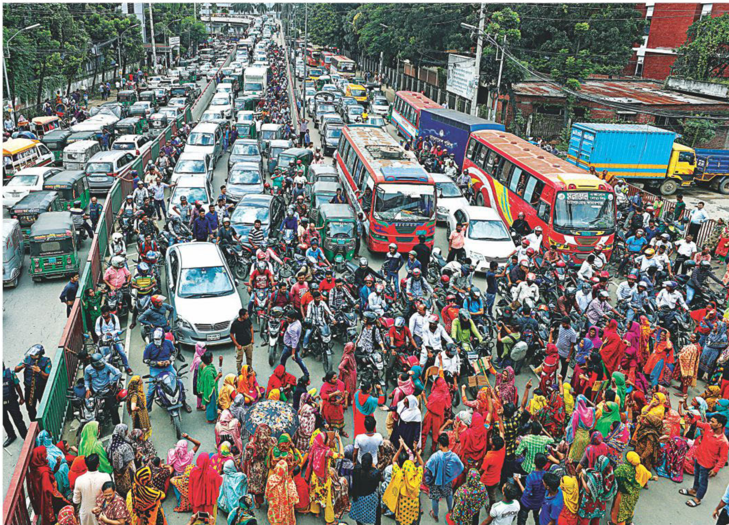
Clockwise... vehicles remain stuck in traffic as workers of Nassa Mainland Garment block a road in the capital's Saat Rasta area yesterday morning, protesting the termination of 66 co-workers; the demonstrators stop a car; a policeman baton-charges some protesters; a female police member and a female demonstrator scuffle during the demo.