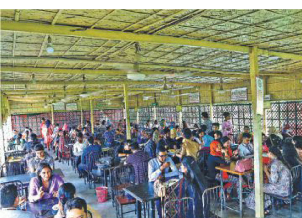
Students at the cafeteria, made entirely of bamboo.