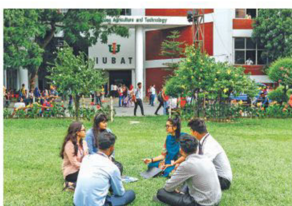
Students spending time at the university's green field.

With the slogan, "An environment designed for learning," the IUBAT community educates their students about the importance of nature and how to nurture it. They offer a mandatory grooming course which emphasises on how to lead a modern life