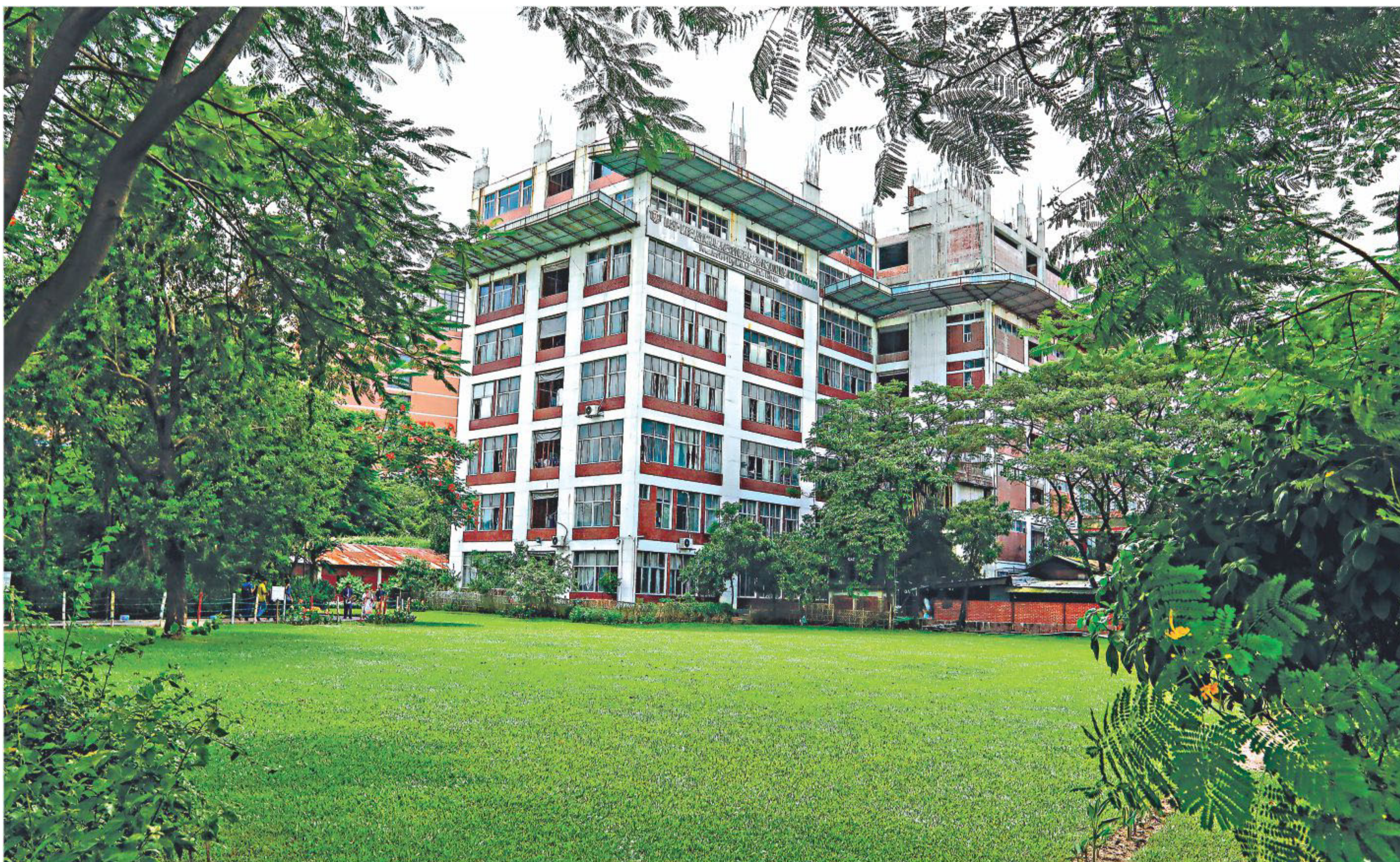
The IUBAT campus in Uttara.