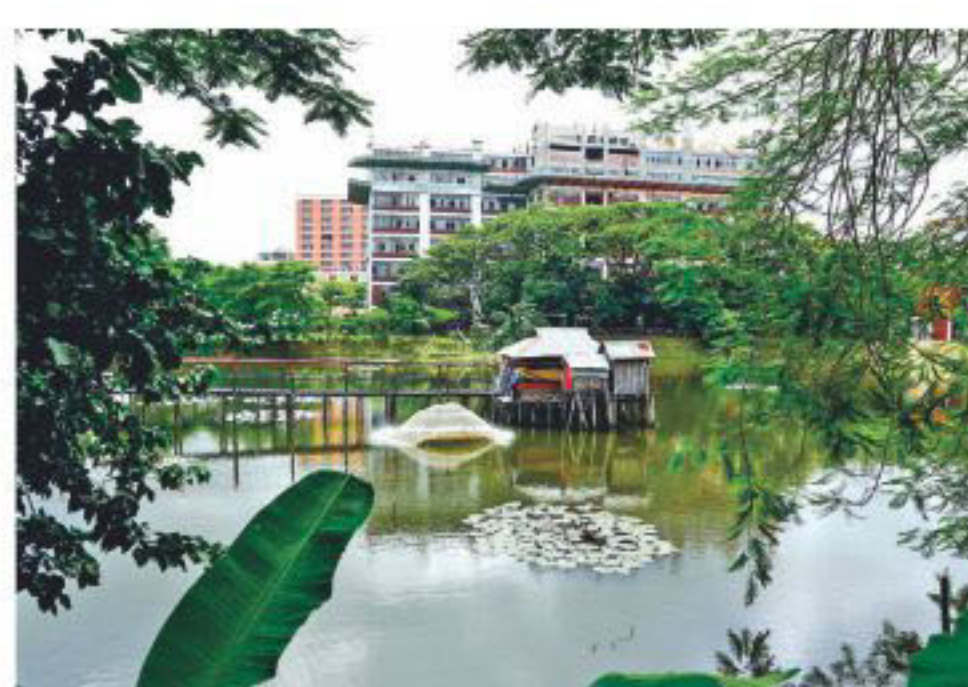
Members of the IUBAT community throw fishing nets in the pond.

IUBAT has two cafeterias, one of which is made entirely of bamboo. One of their unique facilities include a software called 'Moodle', through which students can stay updated about recent academic announcements and programmes of the university. The software was introduced in an attempt to reduce the waste of resources (for example, paper), and familiarise students with digital activities. In addition, IUBAT offers bus facilities, free of charge, to their students.