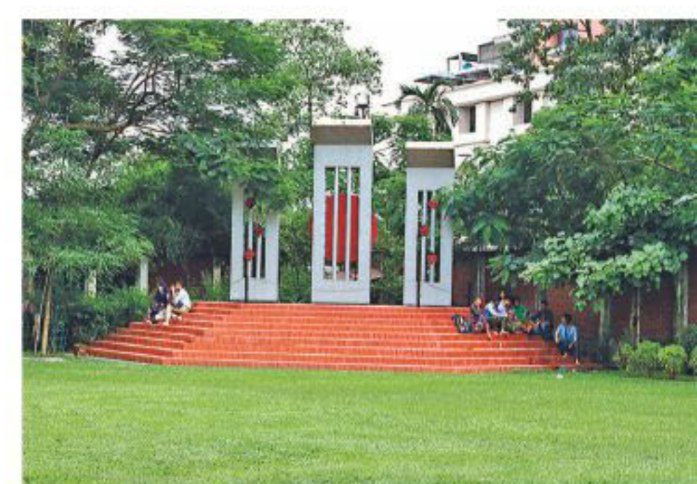
IUBAT's own Shaheed Minar, built inside their green courtyard.

IUBAT carries the mission of nurturing young leaders who are not only proactive and competitive about their education and careers, but who also play vital roles in conserving the environment.