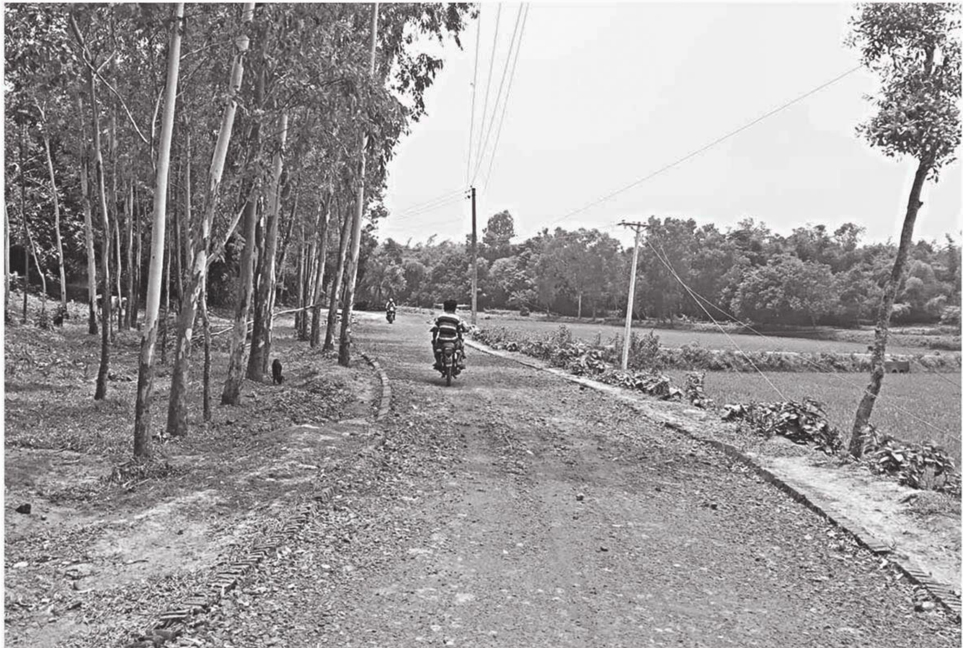
Construction work of this road in Tangail's Sakhipur upazila has remained suspended for about a year now, much to the sufferings of locals.

However, the contractors have recently taken initiative to complete the construction works with the help of other contractors, he added.