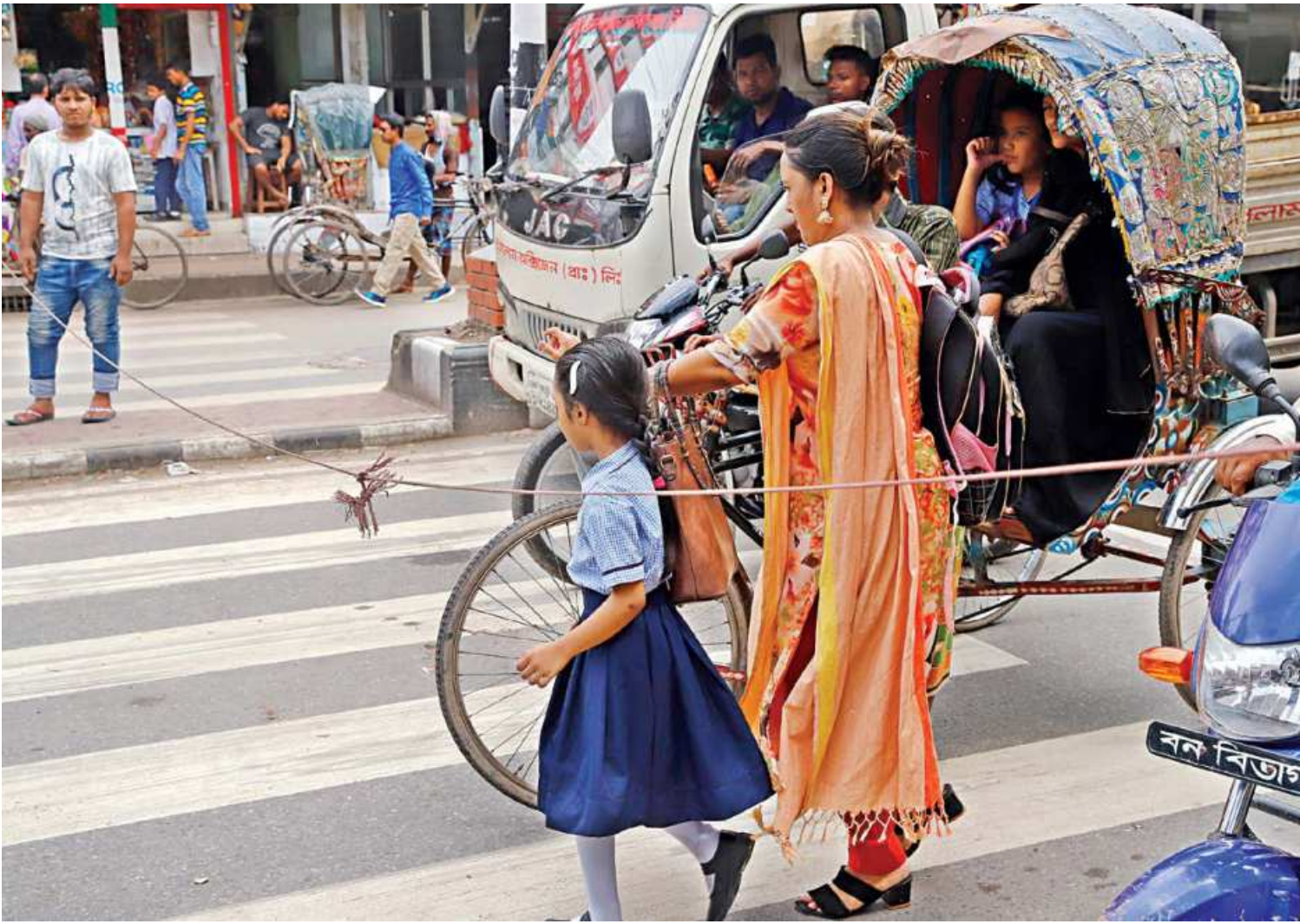
A rope hung across a zebra crossing to control traffic while vehicles stand right on the markings at the capital's Malibagh Chowdhury Para, causing inconvenience to pedestrians. The photo was taken yesterday.