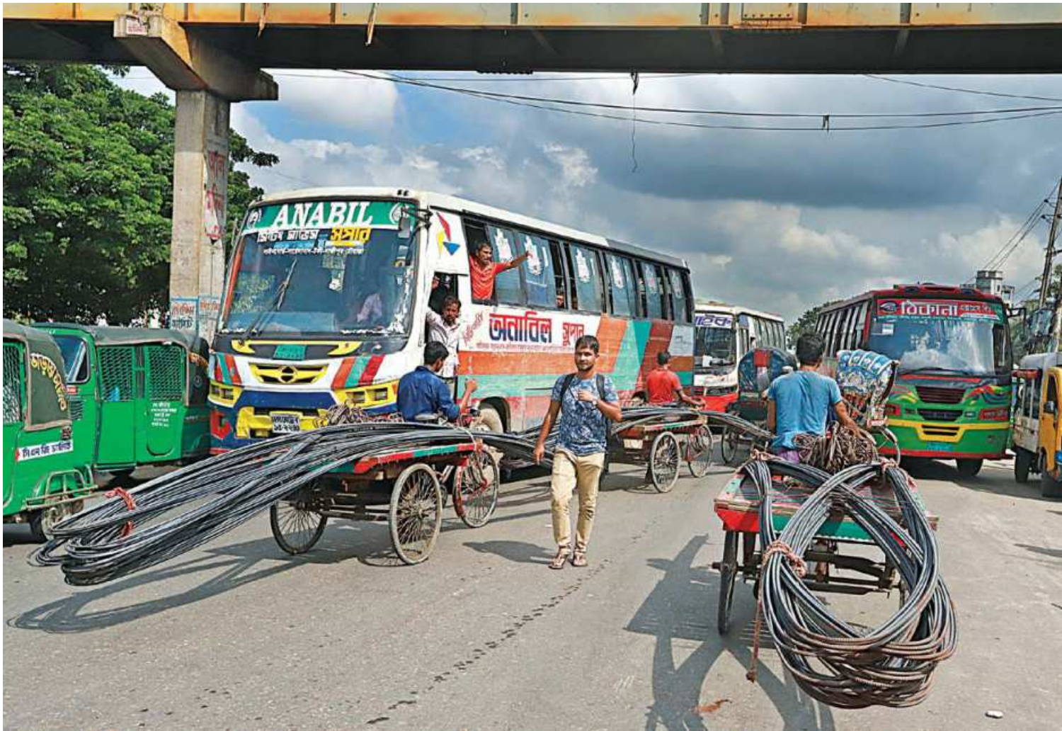
Vans laden with iron rods lumber on the wrong side of the Dhaka-Chattogram highway near the capital's Jatrabari on Sunday. Such light vehicles are banned on highways, but a traffic policeman standing nearby (not seen in the photo) did nothing to stop them.