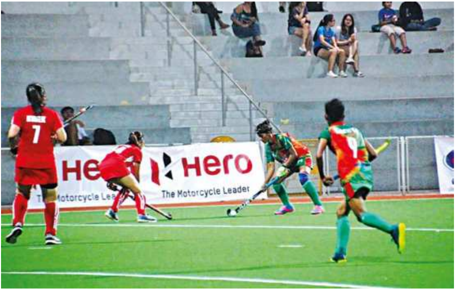
A Bangladesh player tries to manoeuvre the ball into the Singapore half during their Women’s Junior AHF Cup fixture in Singapore yesterday.