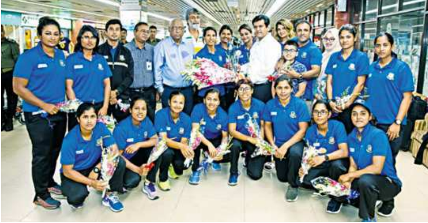
The Bangladesh team were given a warm welcome upon their return from Scotland yesterday, where the Tigresses retained the Women’s T20 World Cup Qualifiers title in Dundee.

Scandinavian rivals Norway. Italy also kept their 100 percent record thanks to Jorginho’s late penalty, which fired Italy their own sixth straight win, 2-1 at nearest rivals Finland. Chelsea midfielder Jorginho’s 79th-minute winner in Tampere sent Roberto Mancini’s side six points clear of the second-placed Finns in Group J, after inform Norwich City striker Teemu Pukki had levelled Ciro Immobile’s first Italy goal in two years with a penalty of his own six minutes before. Four-time world champions Italy are flying high with a maximum 18 points with four qualifying games to play, nine points ahead of third-placed Armenia.