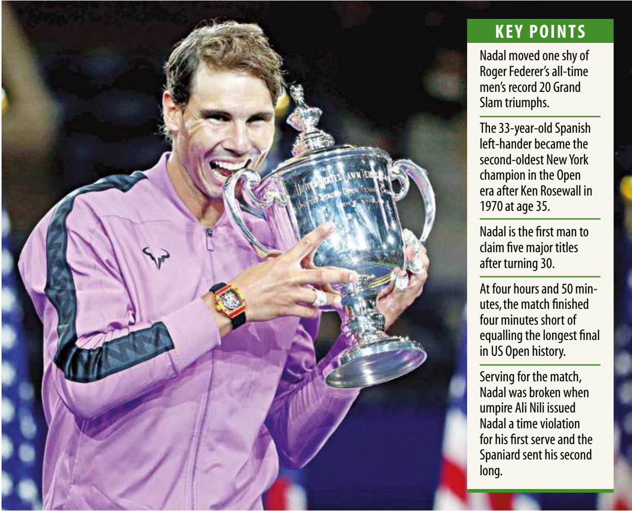
Rafael Nadal takes a bite out of the US Open trophy after winning the men’s singles final against Daniil Medvedev at Flushing Meadows in New York on Sunday.