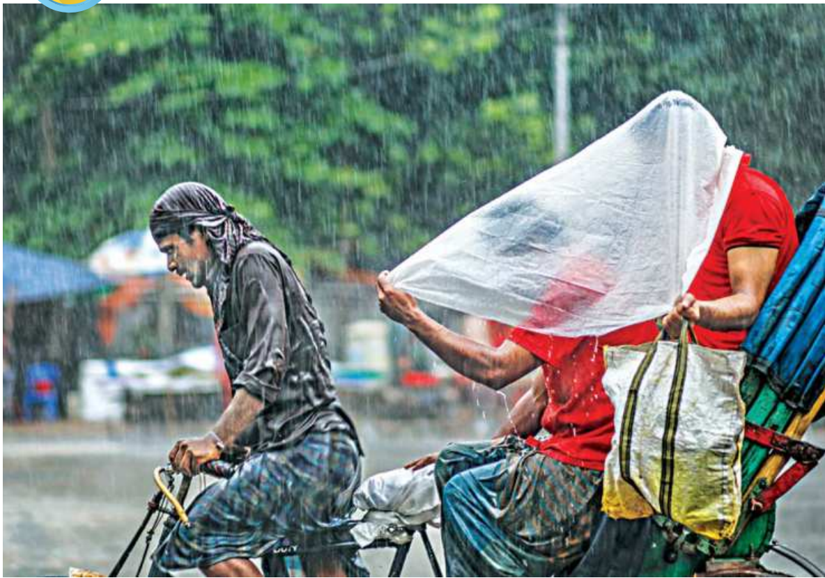
Yesterday’s heavy downpour brought back familiar monsoon scenes of Dhaka. This plastic sheet barely covers three people on a rickshaw in Shahbagh, as city-dwellers were hardly prepared for the sudden autumn rain.