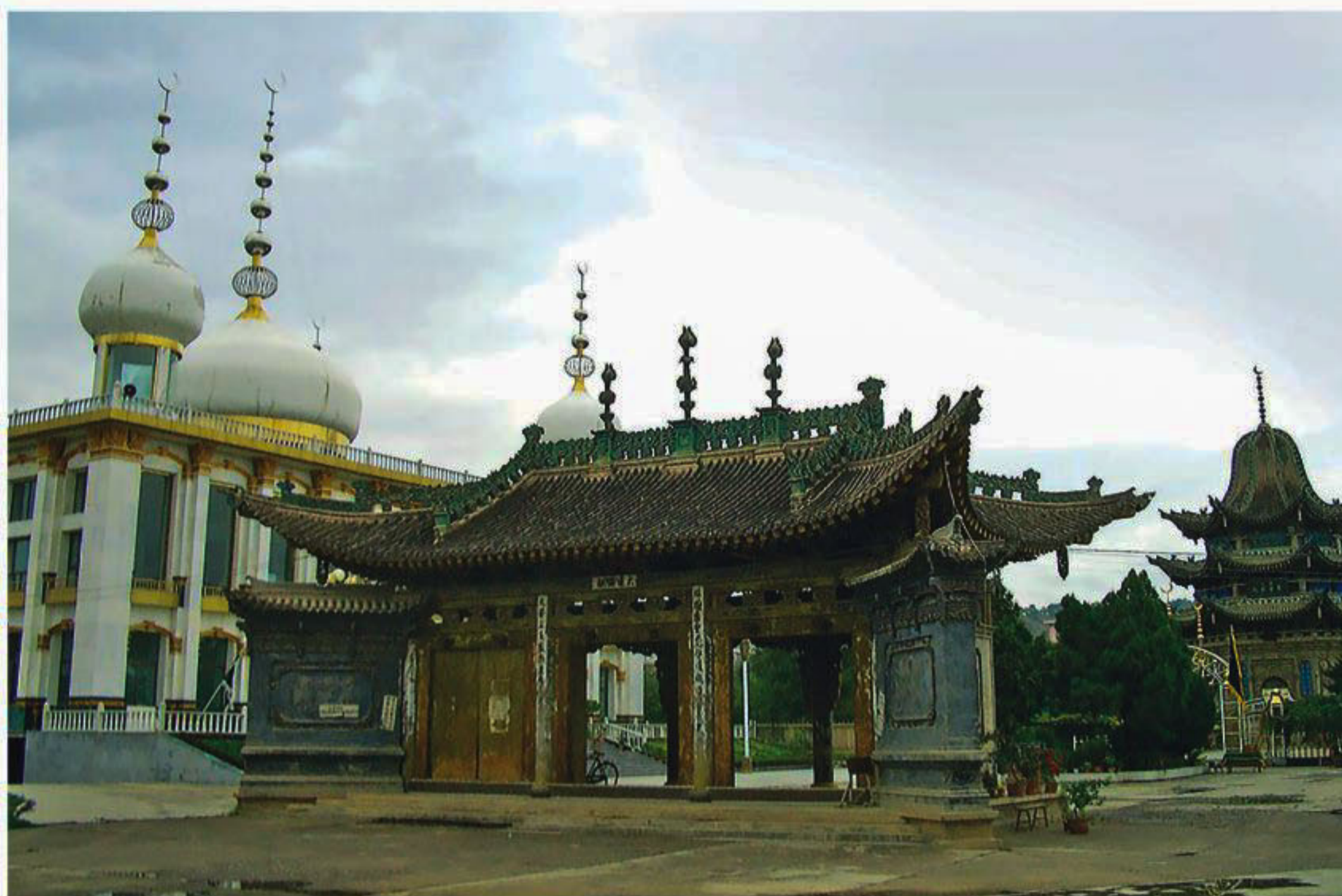
The Huasi Mosque was built during the Ming Dynasty. The mausoleum of Ma Laichi, a Chinese Sufi master, who brought the Khufiyya movement to China, lies next to it.