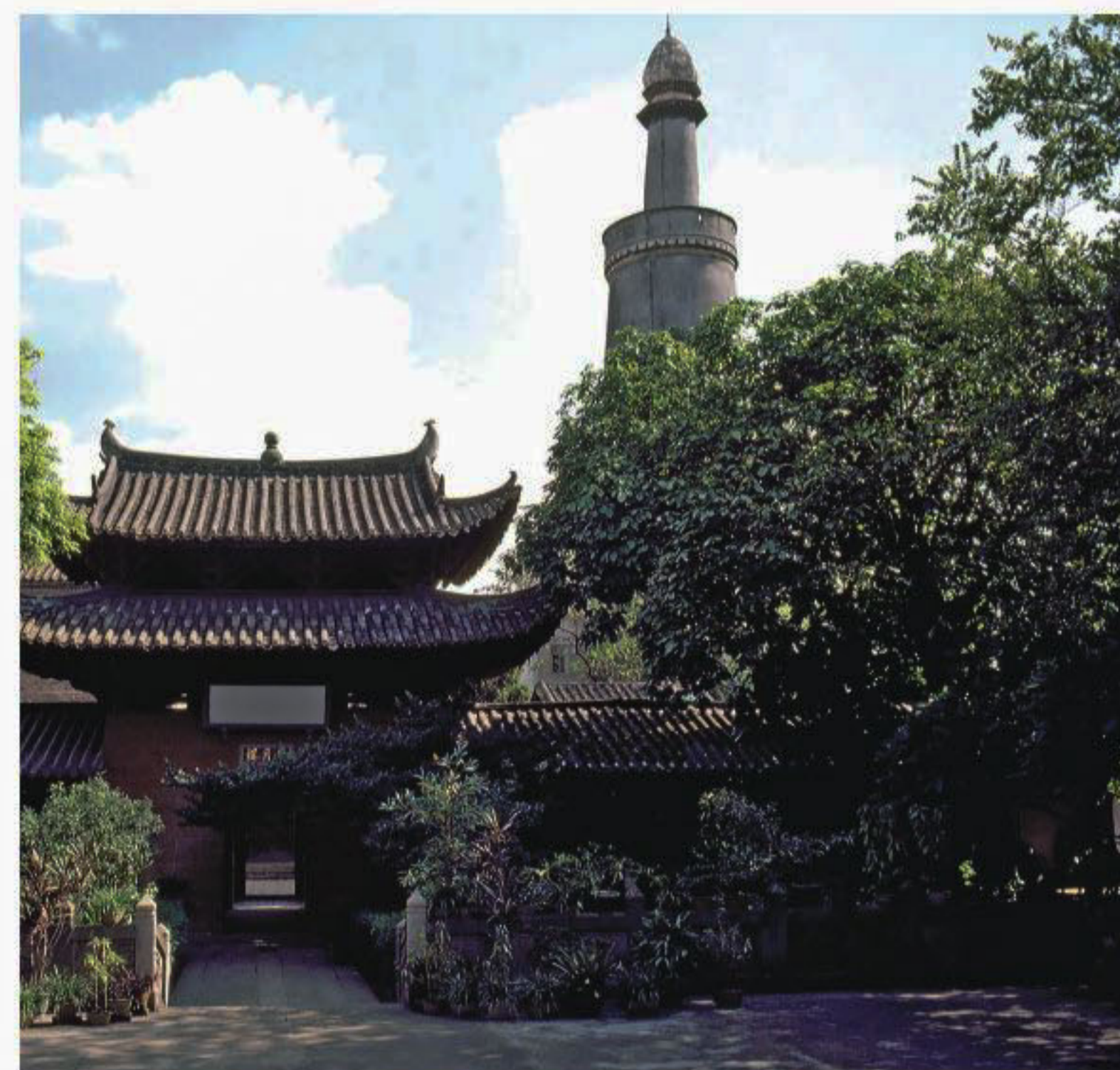
Huaisheng Mosque in Canton is one of the oldest mosques in the world. It was originally built over 1,300 years ago.

the religion across vast China, as well as its rich, diverse legacy.