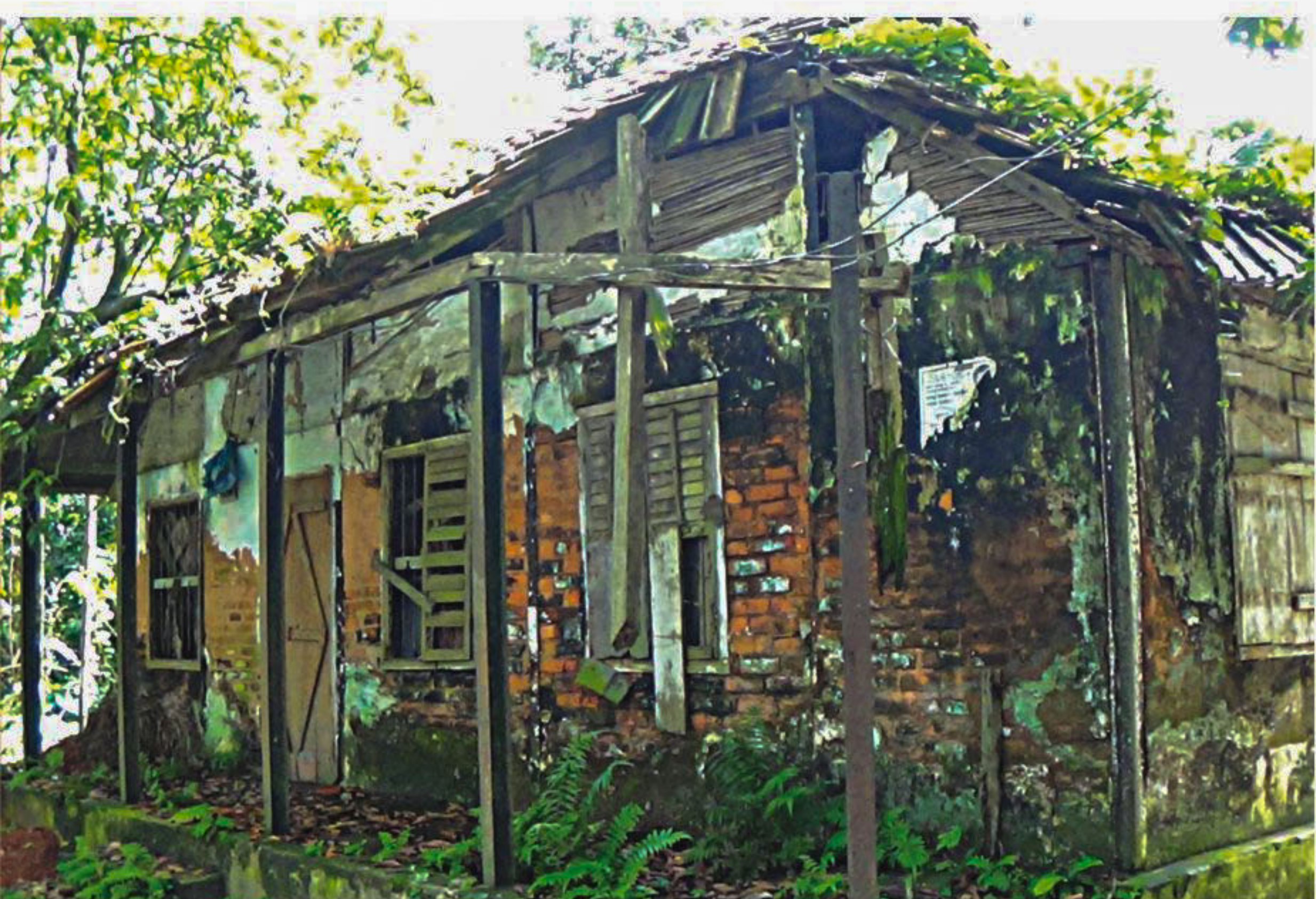
The ancestral home of great social reformer Leela Nag in Moulvibazar's Panchgaon. The 4.39-acre homestead that hosts this now worn-out bungalow has been occupied by the family of a local Razakar for years.