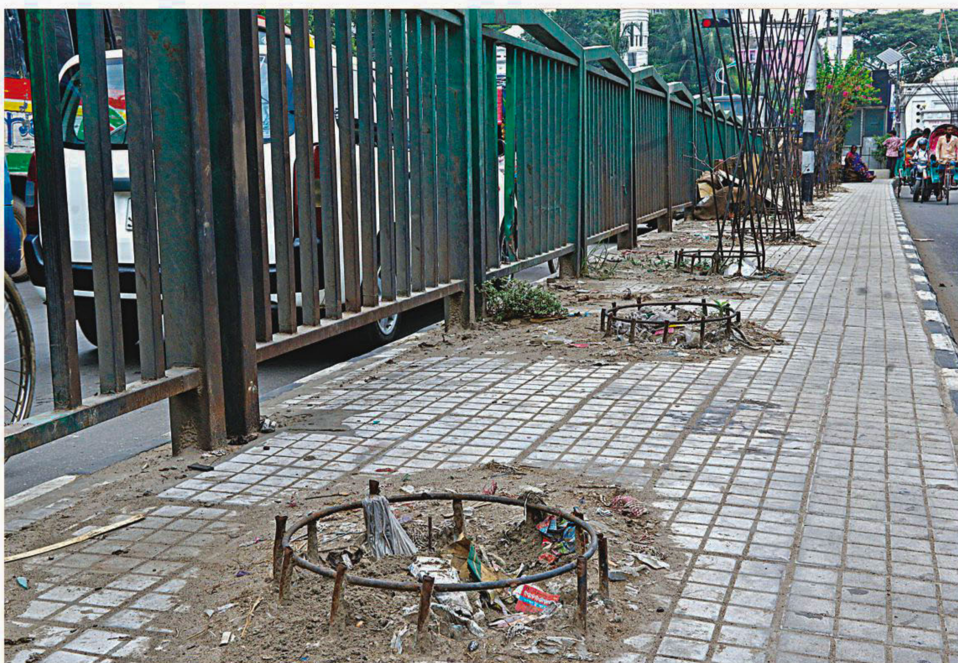
Metal frames installed on the central reservation of a street near Phulbaria in Gulistan to protect the plants and trees there have been sawed off and stolen. The Dhaka South City Corporation had installed these as part of a beautification move.