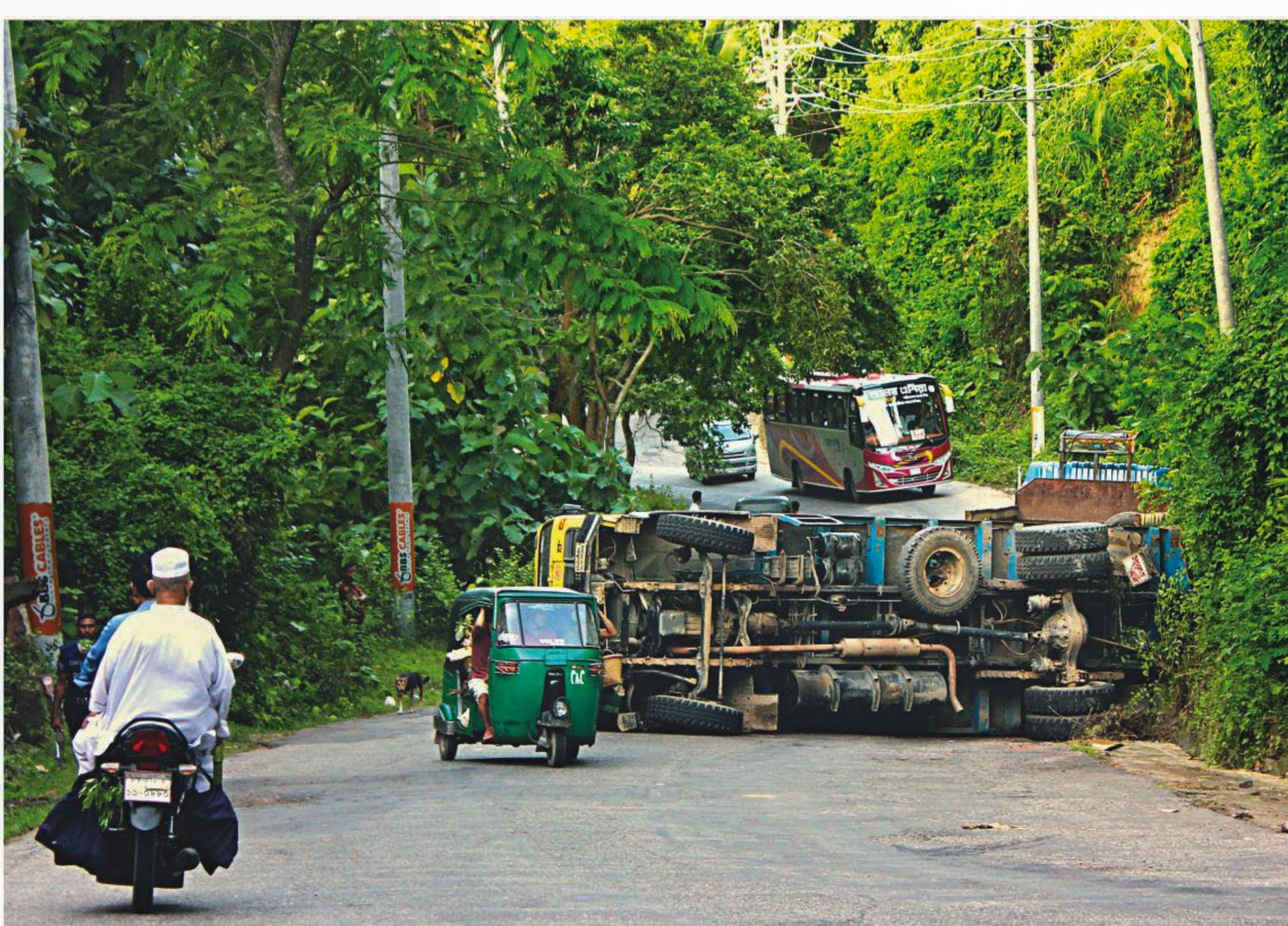
A stone-laden lorry lies on its side at Manikchhari on Chattogram-Rangamati highway yesterday. Locals claimed that every month four to five overloaded trucks flip on the highway that goes through the difficult terrain.