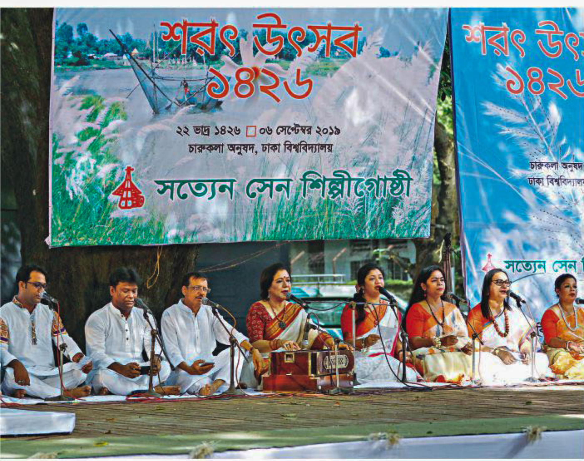
SHARAT UTSHAB 1426 OBSERVED AT CHARUKALA Organised annually by Shottensen Shilpigosti, Sharat Utshab 1426 took place yesterday at Bakultala of Charukala (Faculty of Fine Art), Dhaka University. A wonderful arrangement of songs, dance, poetry performances and instrumentals among others, were presented at the event which is conducted in two parts (morning and evening). State Minister of Cultural Affairs K M Khalid graced the occasion as the chief guest.