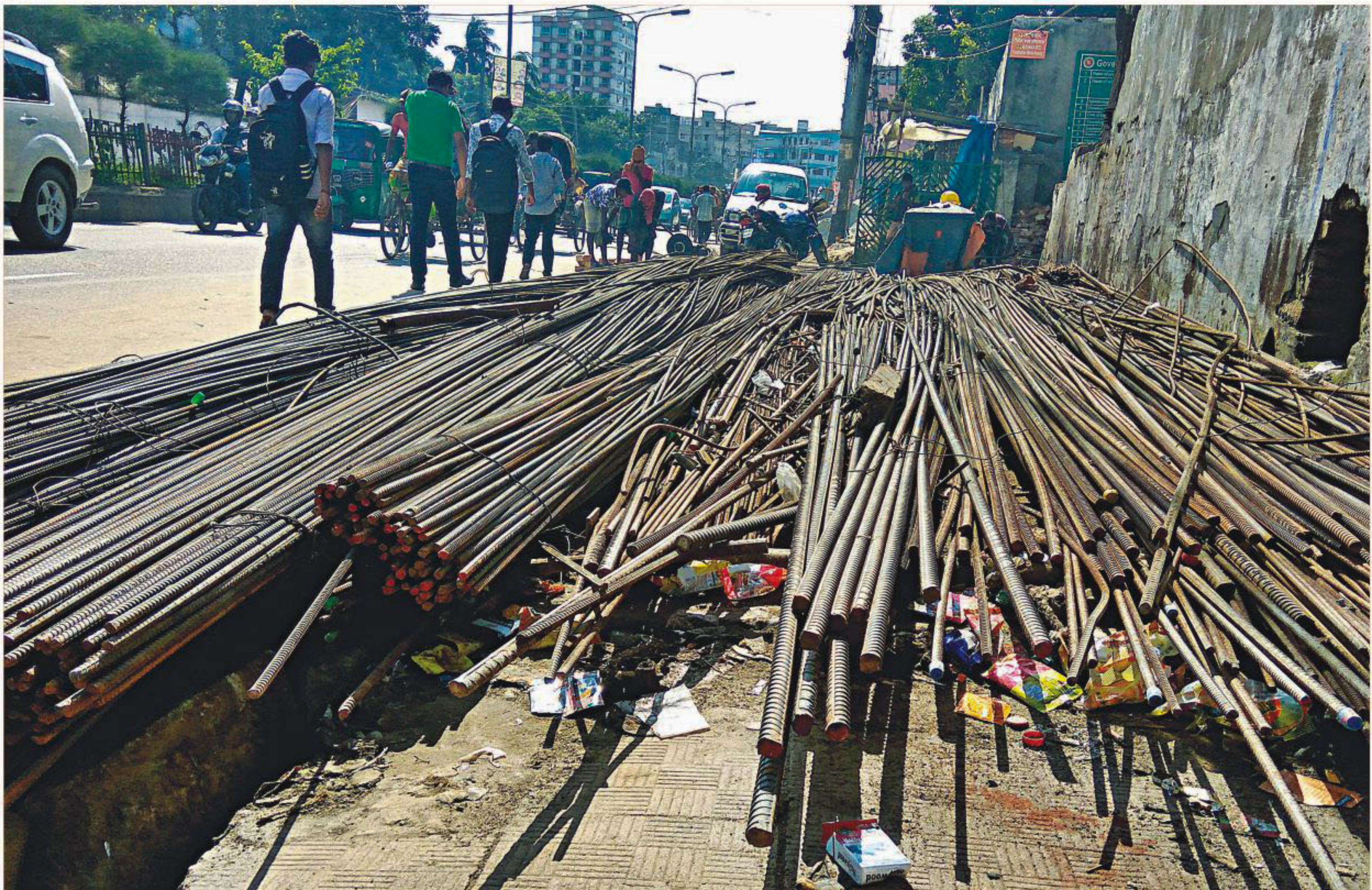
Iron rods occupy a pavement and a portion of Mayor Annisul Huq Road in front of an under-construction building in the city's Tejgaon area yesterday, forcing pedestrians to use the street and risk their lives.

"Attacks on aid workers in clearly marked humanitarian vehicles constitute a violation of international humanitarian law," it said in a statement.