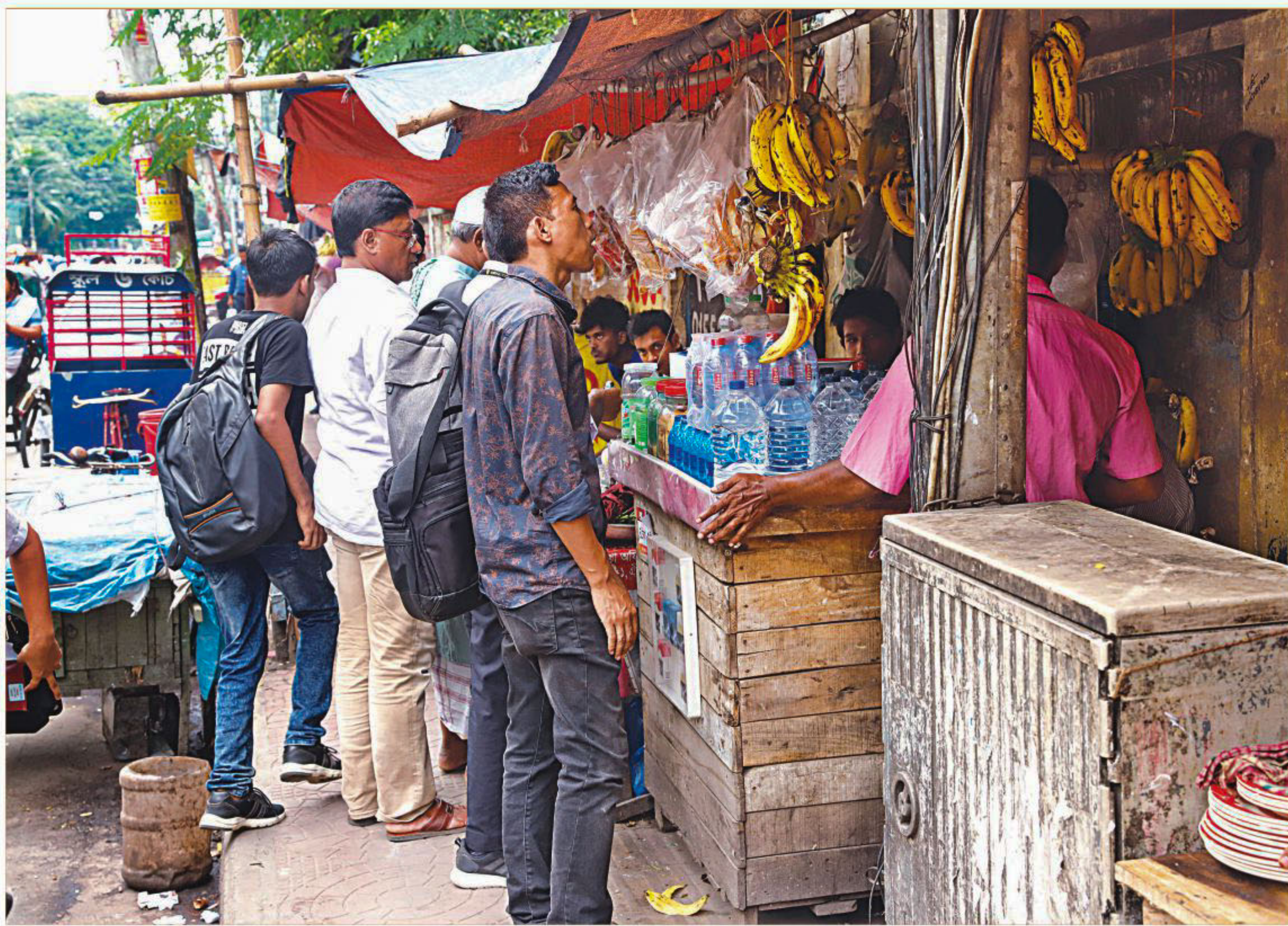
Tea and snacks stalls and their customers leave little room for pedestrians on the pavement of Green Road in the capital. The photo was taken yesterday.