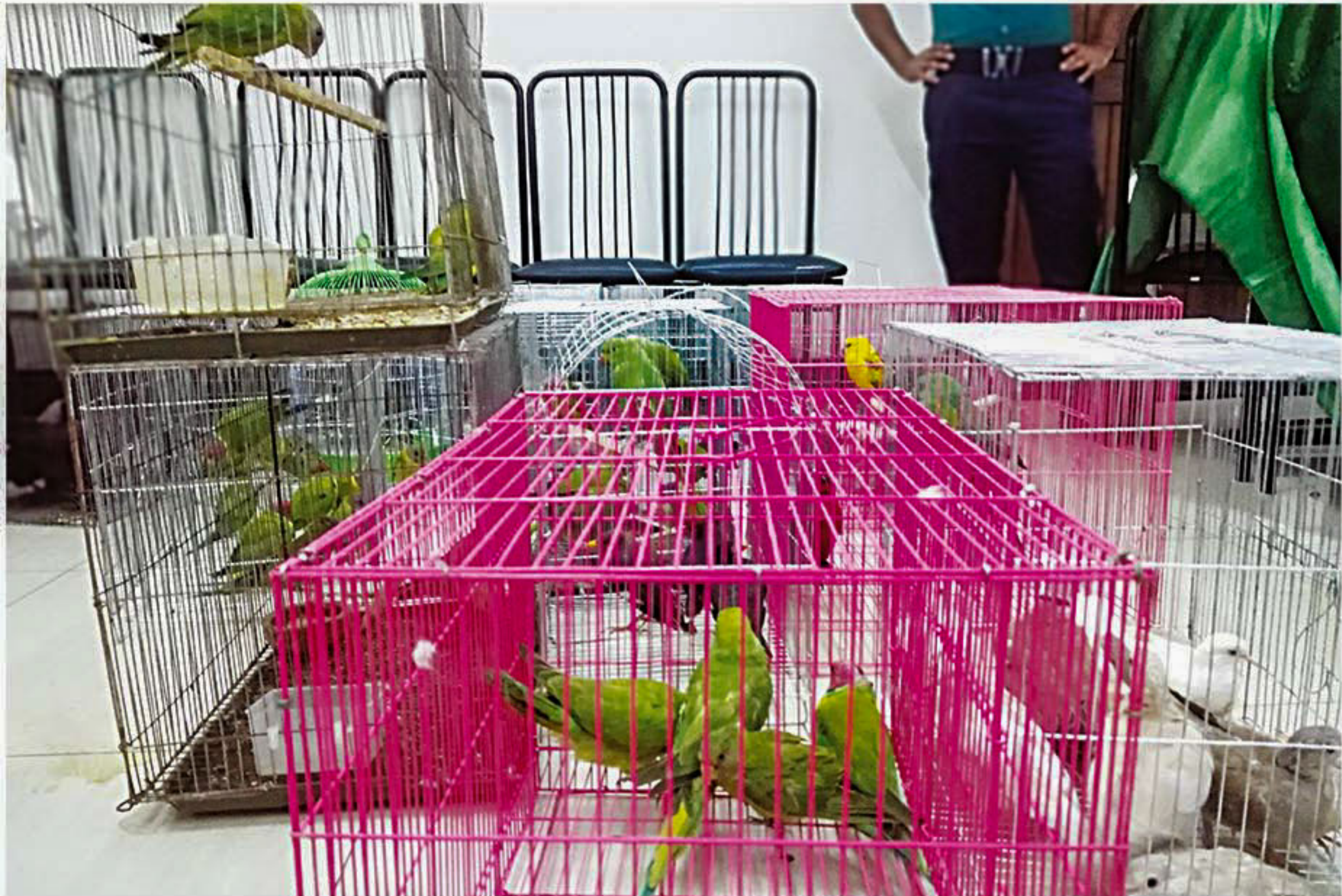
Chattogram district administration yesterday rescued 150 birds of different species -- including some rare ones -- from 12 shops in a drive at Riazuddin Bazar market. It also arrested and sentenced 11 people to one month in jail each.